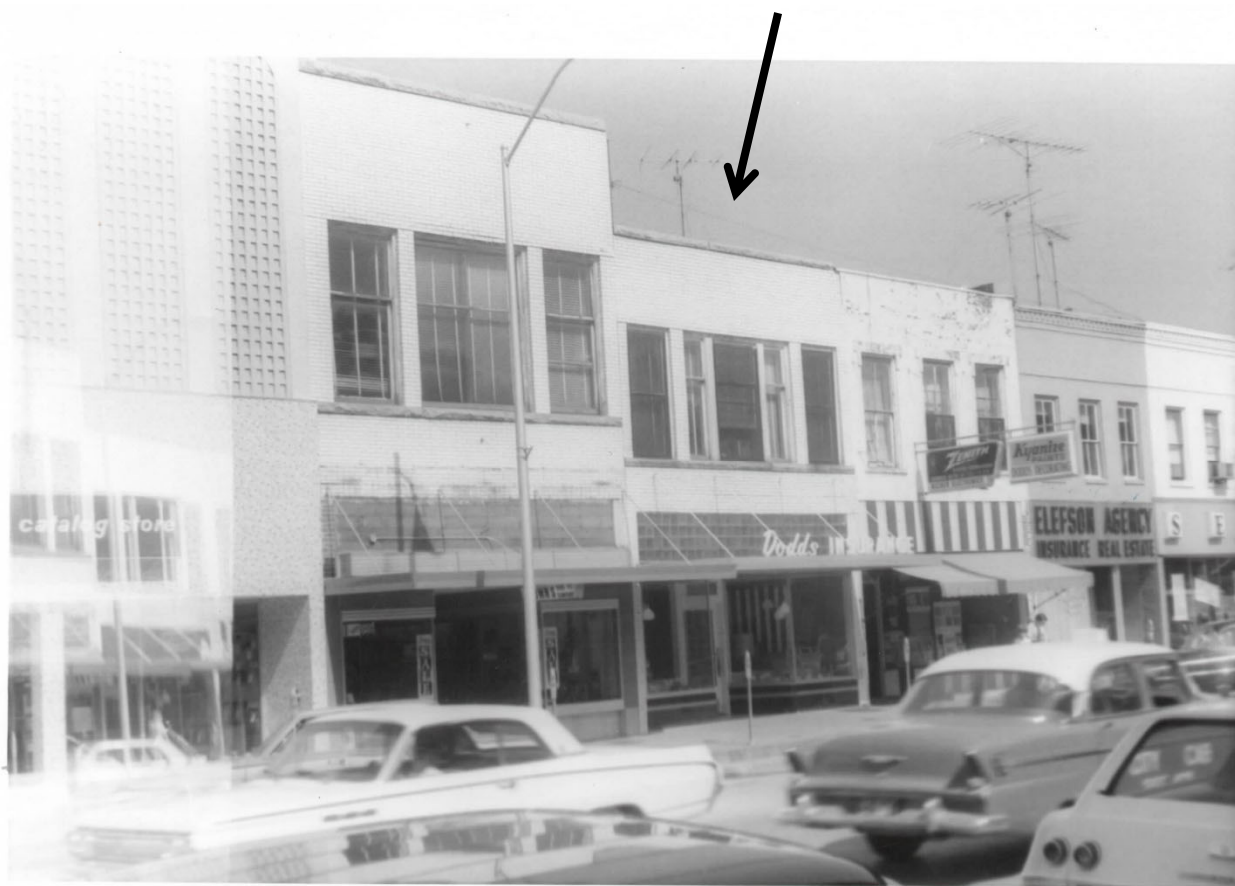
Middle of west side of 100 block of N. Jefferson St in July 1965 (HCHT files)