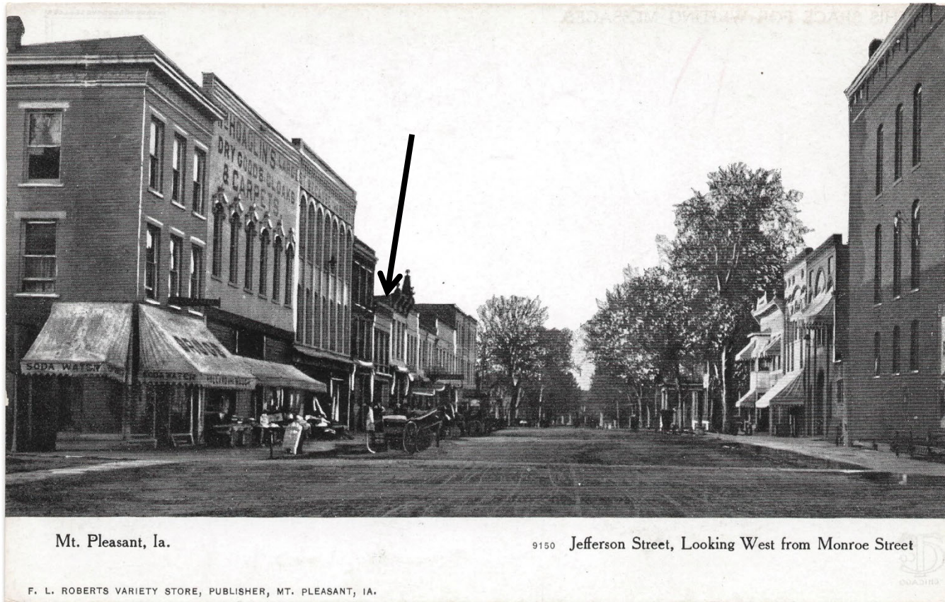
Looking north on 100 block of N. Jefferson St in early 1900s