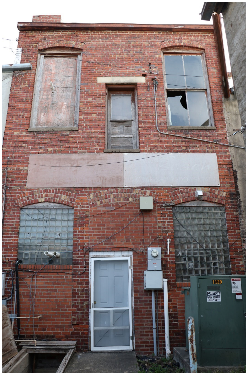
Photograph 44-00190-002. West elevation, looking east (October 2023)