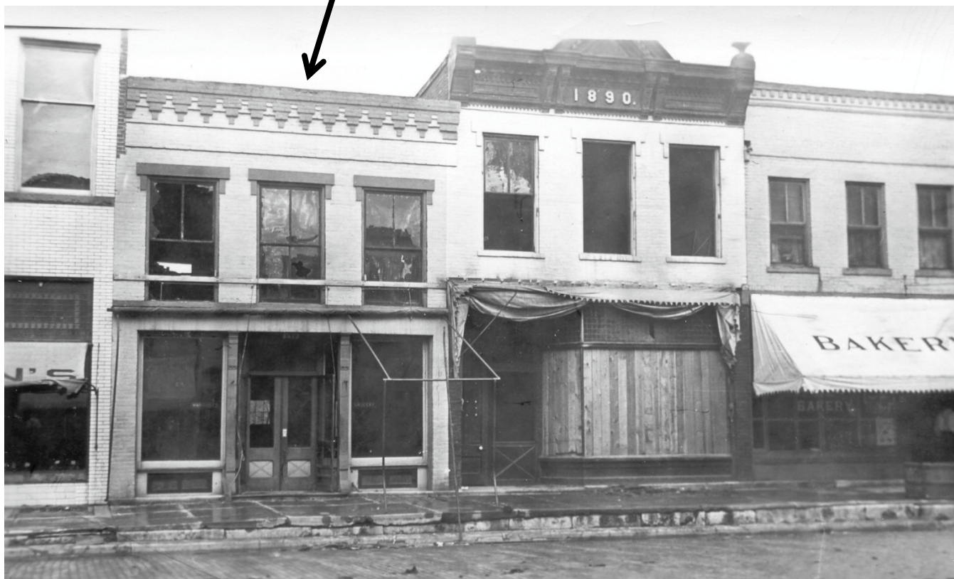
Middle of west side of 100 block of N. Jefferson after June 1914 fire