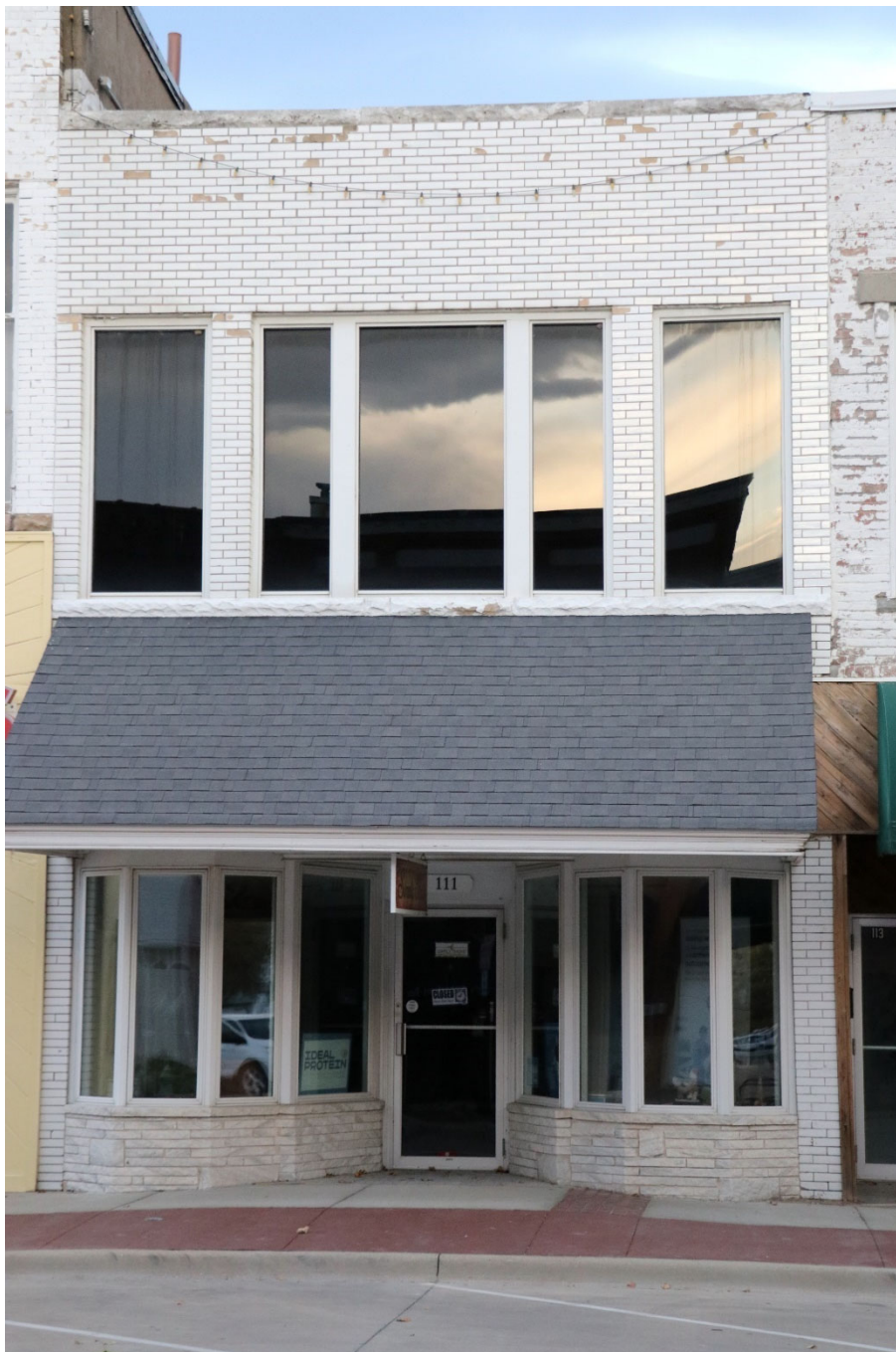
Photograph 44-00190-001. East elevation, looking west (October 2023)