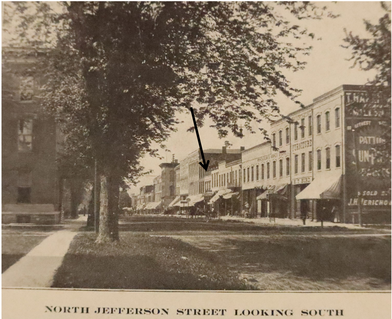
West side of 100 block of N. Jefferson, looking southwest ( Mt Pleasant Beautiful 1909: 5 )