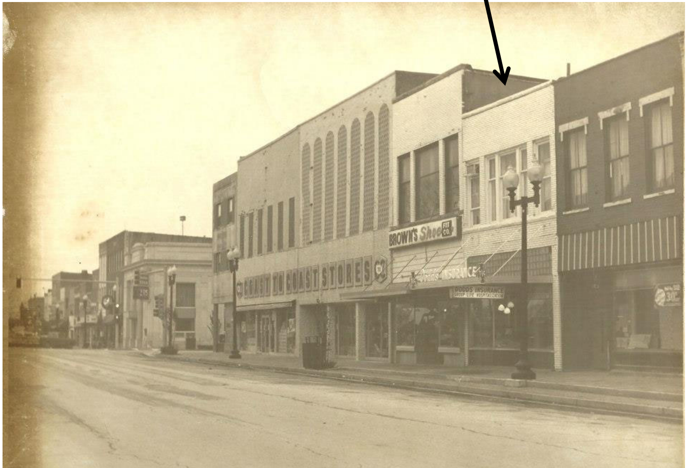
West side of 100 block of N Jefferson St in early 1980s, looking southwest