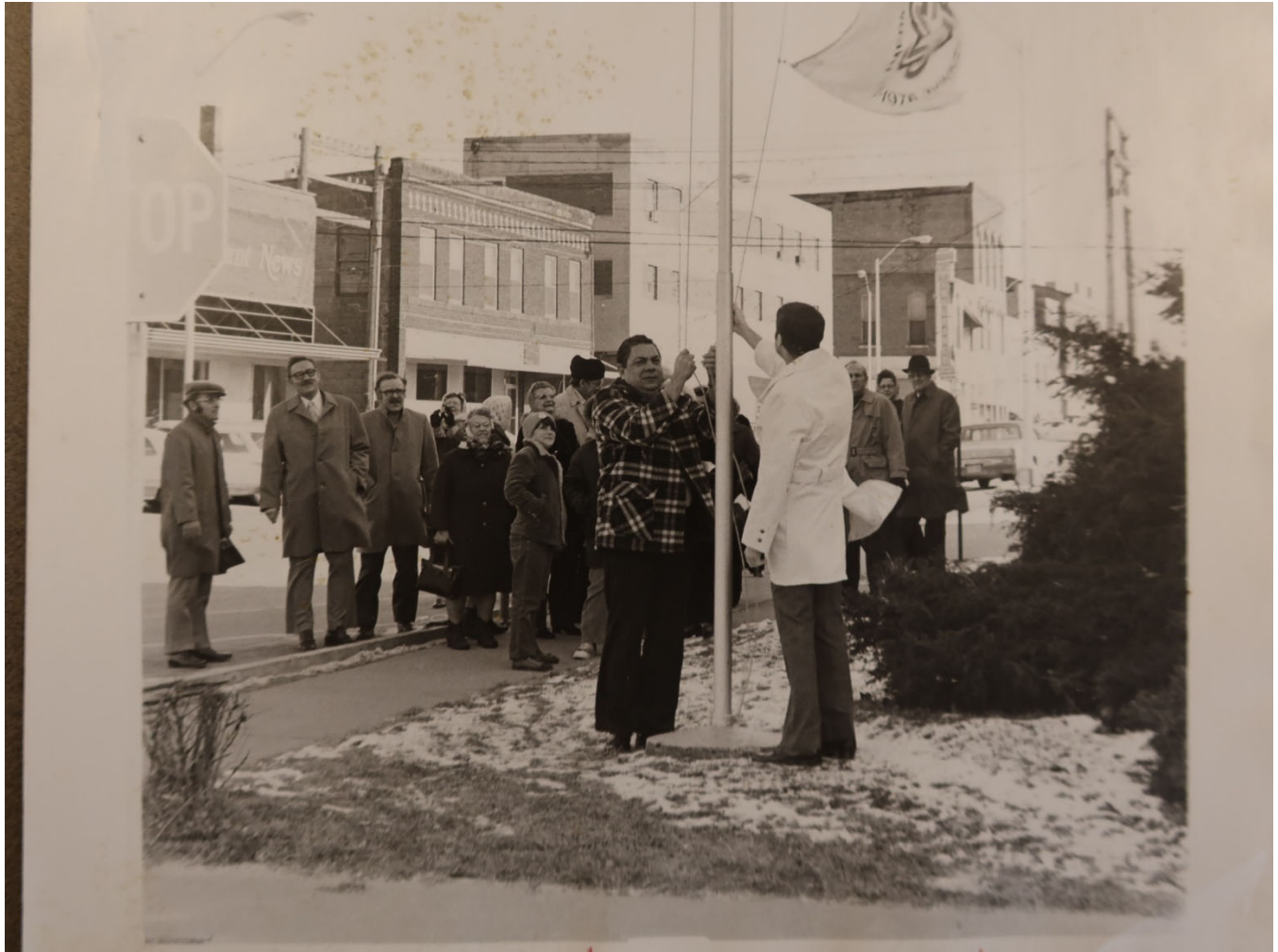
Building in January 1976