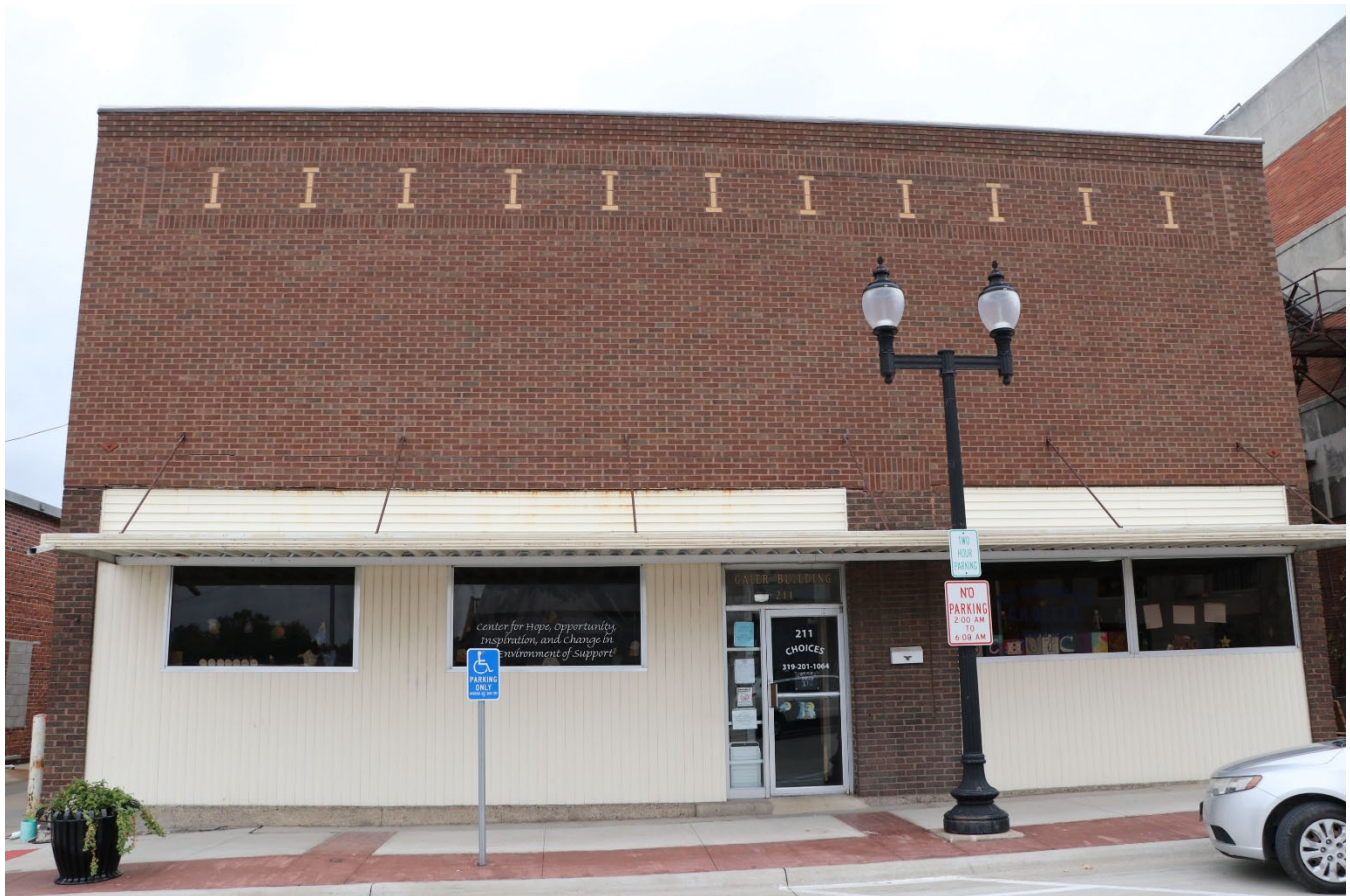
Photograph 44-00374-001. South elevation, looking north (October 2023)