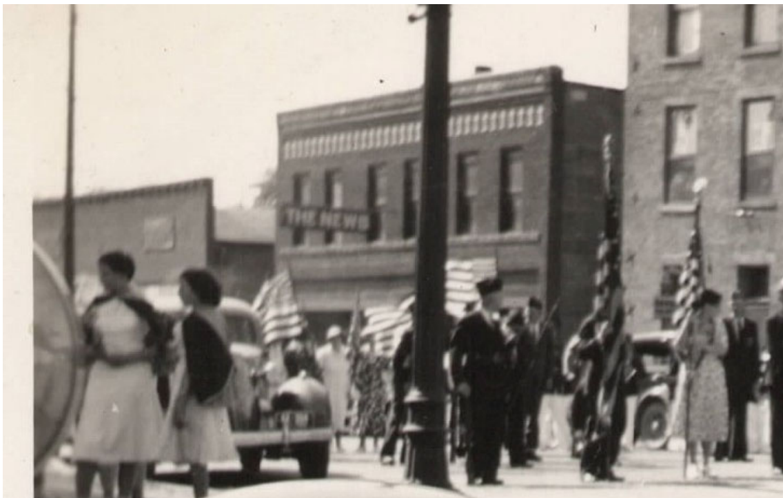
Parade along the 200 block of W. Monroe on May 30, 1937 (Jones, HCHT Facebook album)