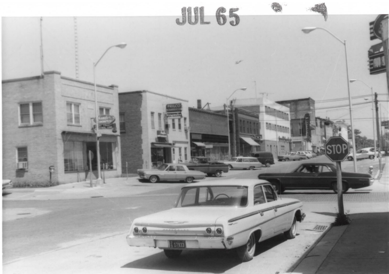
North side of 200 block of W. Monroe St in July 1965, looking northeast