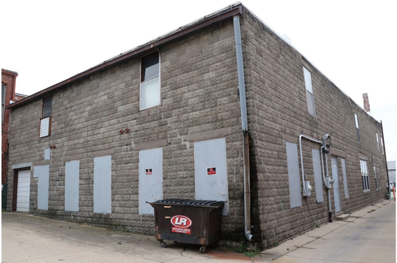
Photograph 44-00374-002. North and west elevations, looking southeast (October 2023)