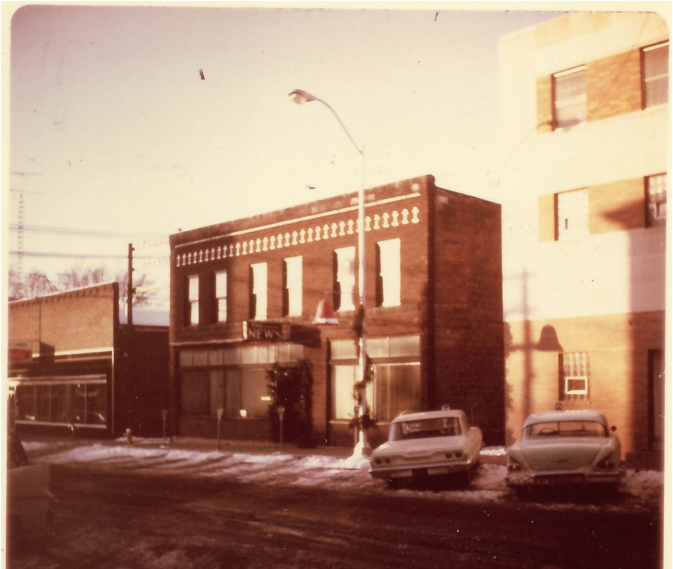
Building around 1964 (HCHT Facebook album)