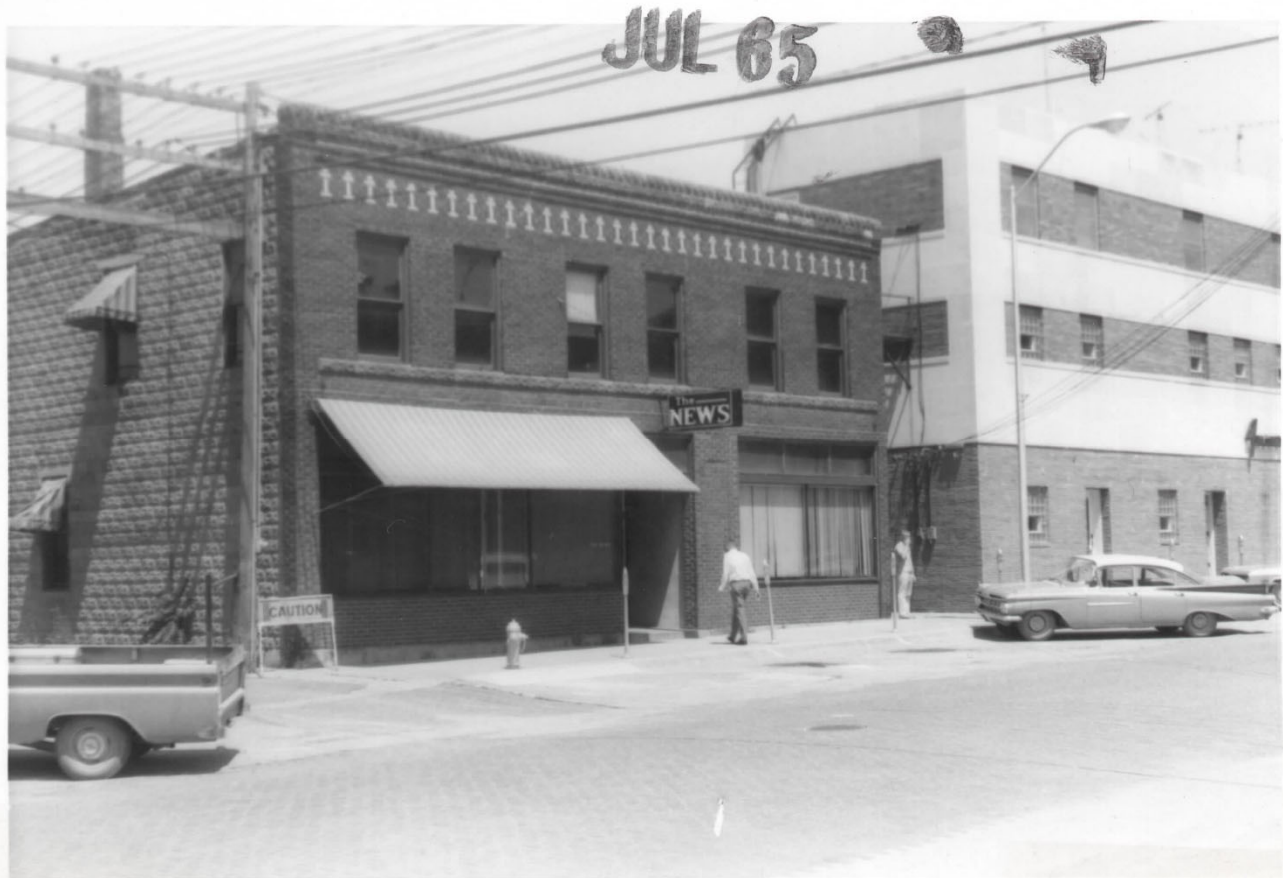
News building at 211 W. Monroe St in July 1965, looking northeast