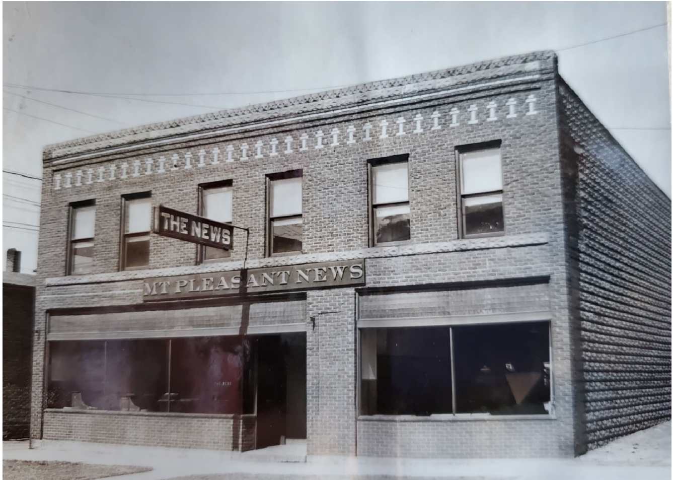
Building occupied by Mt Pleasant News (HCHS binders, Mt Pleasant Public Library)