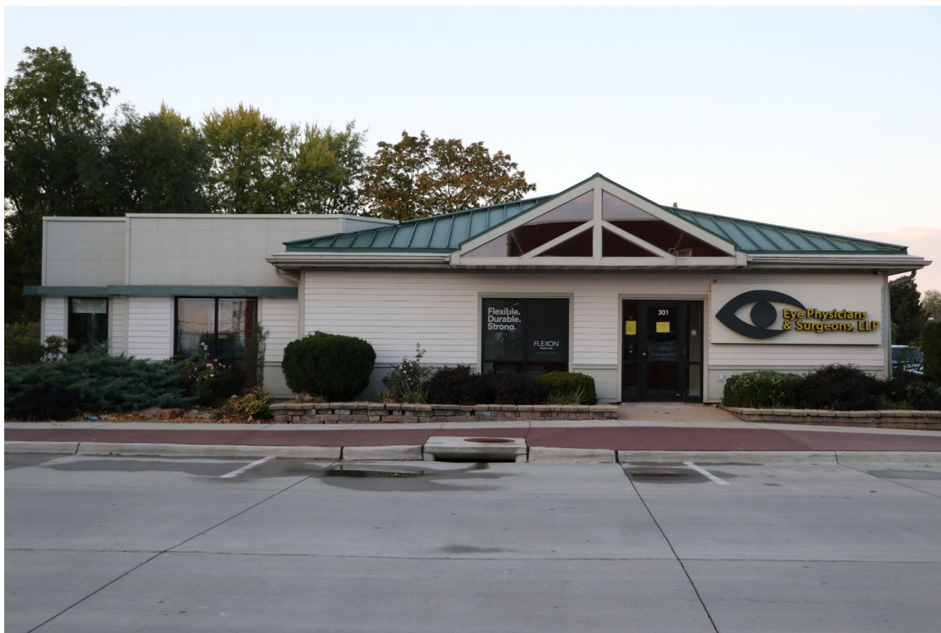
Photograph 44-02265-001. South elevation, looking north (October 2023)