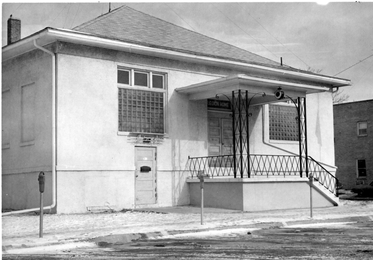
American Legion building in 1970s