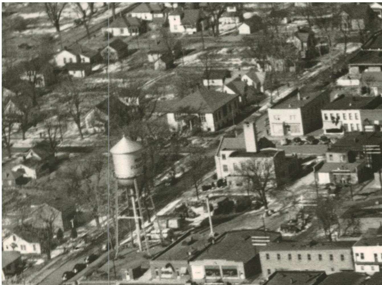
American Legion building at northwest corner of Monroe and Jackson in 1947

section of 1947 aerial photograph of Mt Pleasant, looking north (HCHT files, printed in Des Moines Register , April 27, 1947, sec 9, p3, p83)