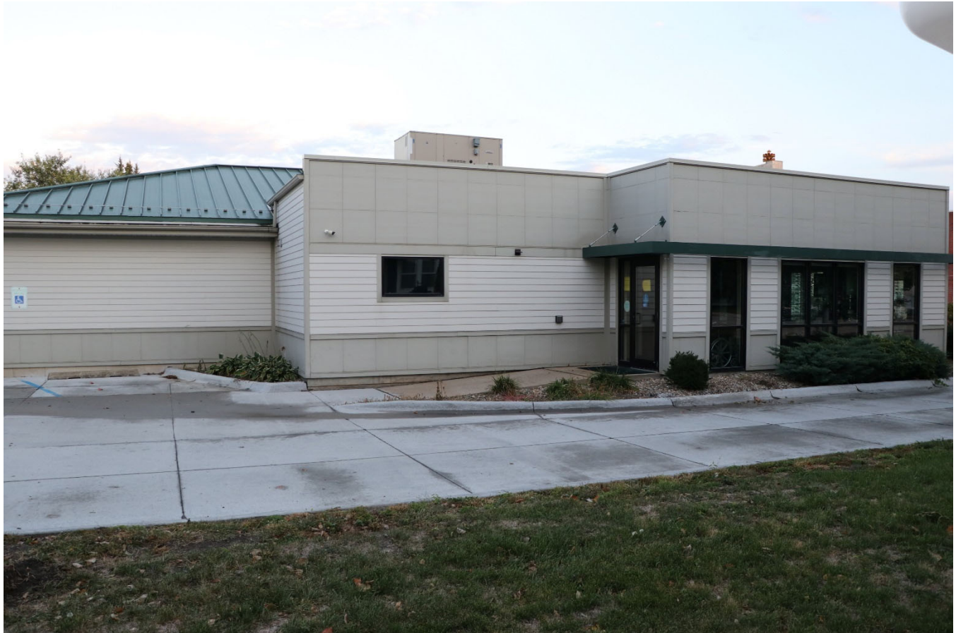
Photograph 44-02265-003. West elevation, looking east (October 2023)