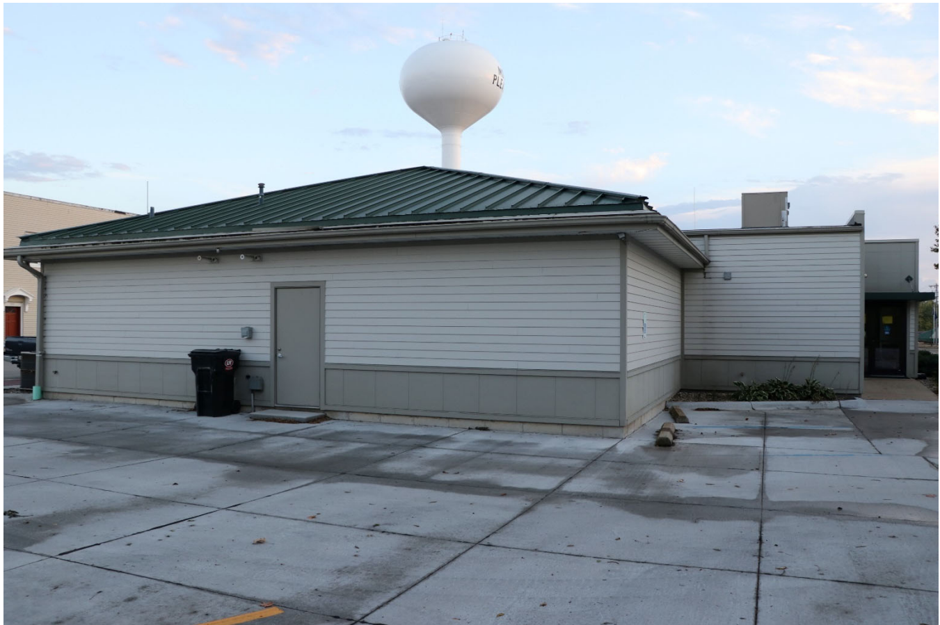
Photograph 44-02265-004. North elevation, looking south (October 2023)