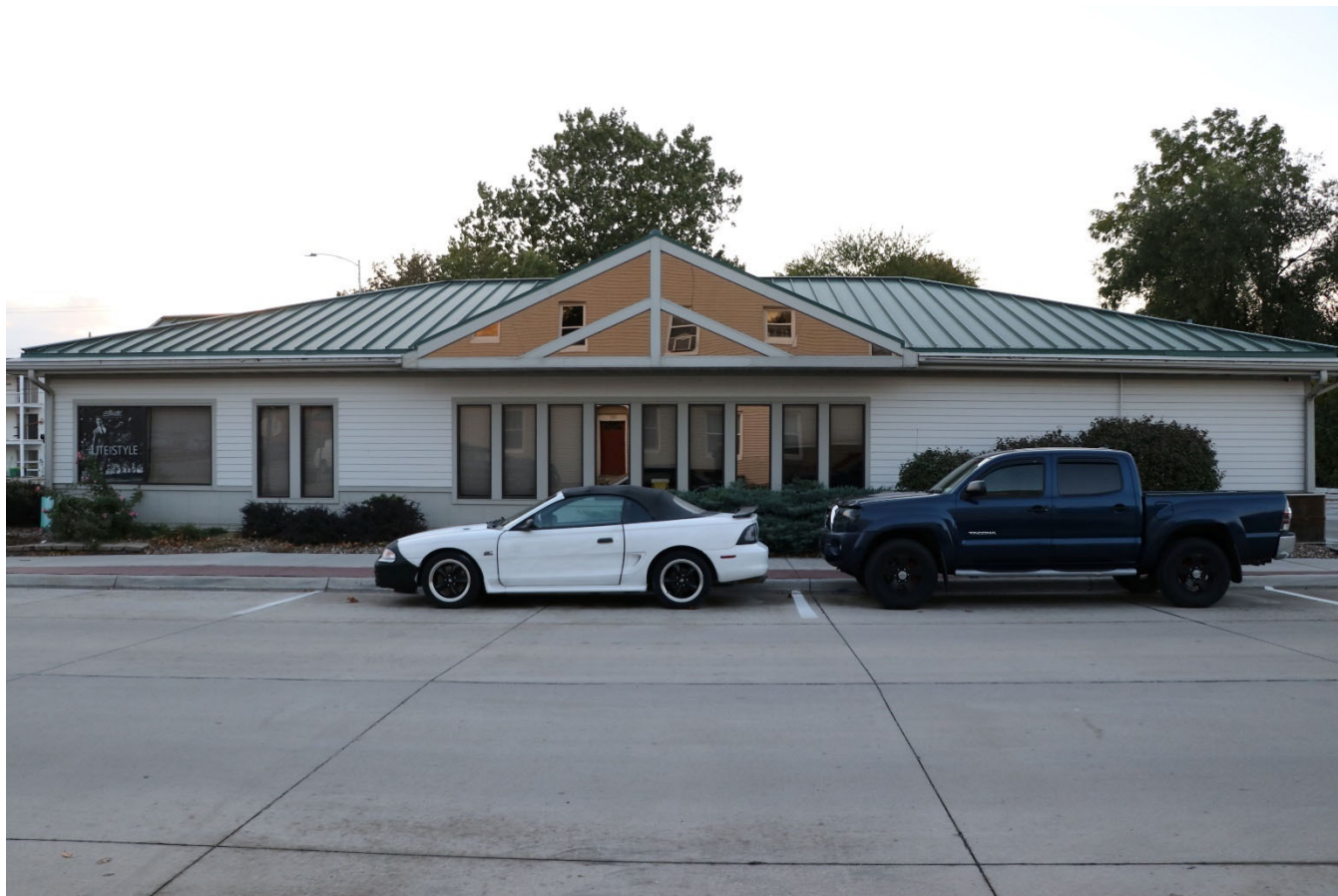
Photograph 44-02265-002. East elevation, looking west (October 2023)