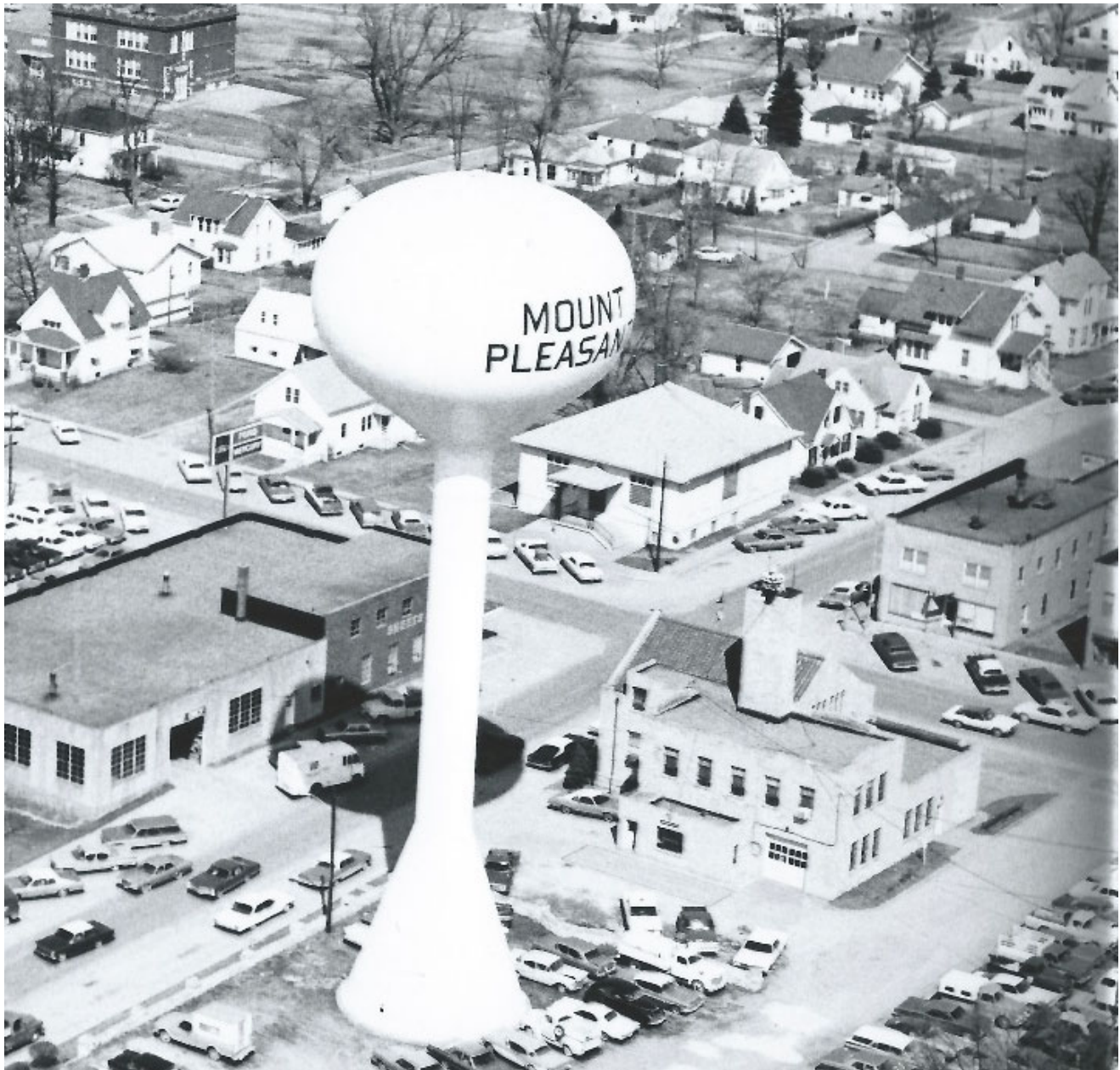
American Legion building at northwest corner of Monroe and Jackson around 1970 (Magnuson, HCHT files)