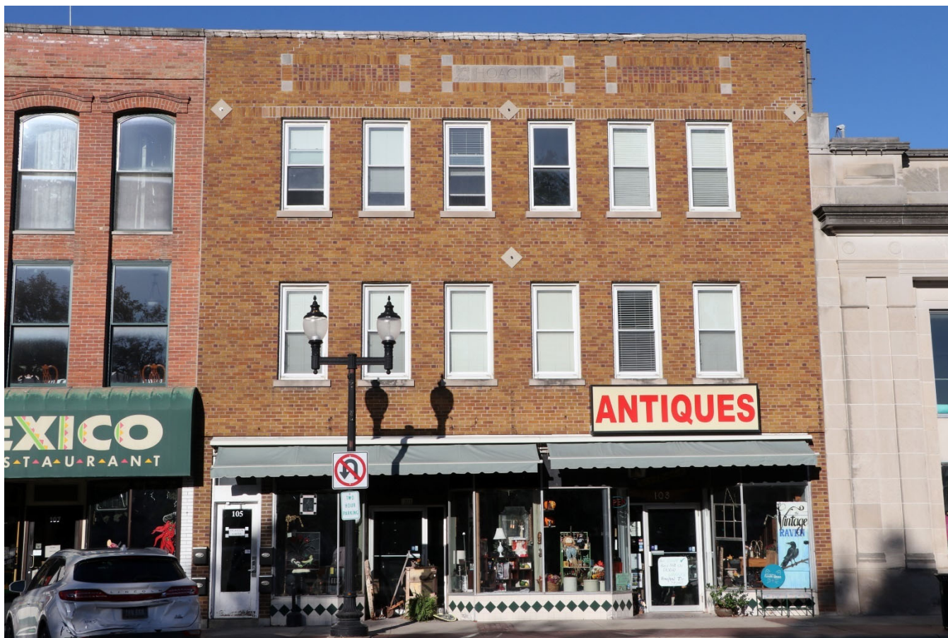
Photograph 44-00204-001. East elevation, looking west (October 2023)