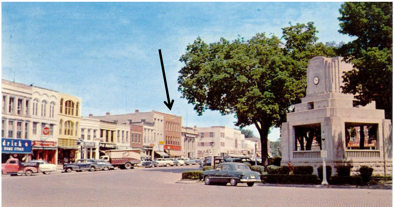
West side of square (100 block S. Jefferson St) in 1950s (HCHT Facebook album)