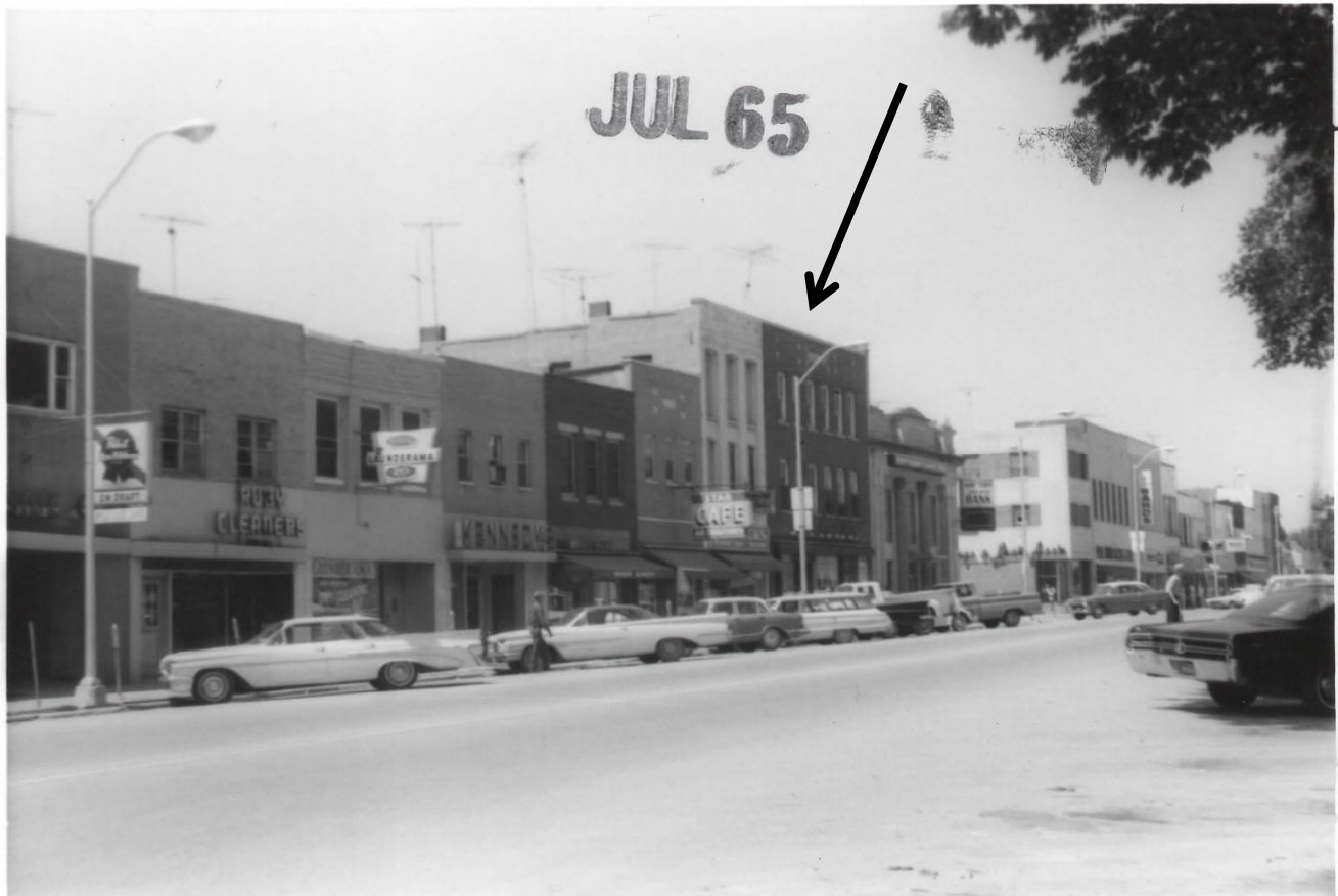
West side of square (100 block S. Jefferson St) in 1965