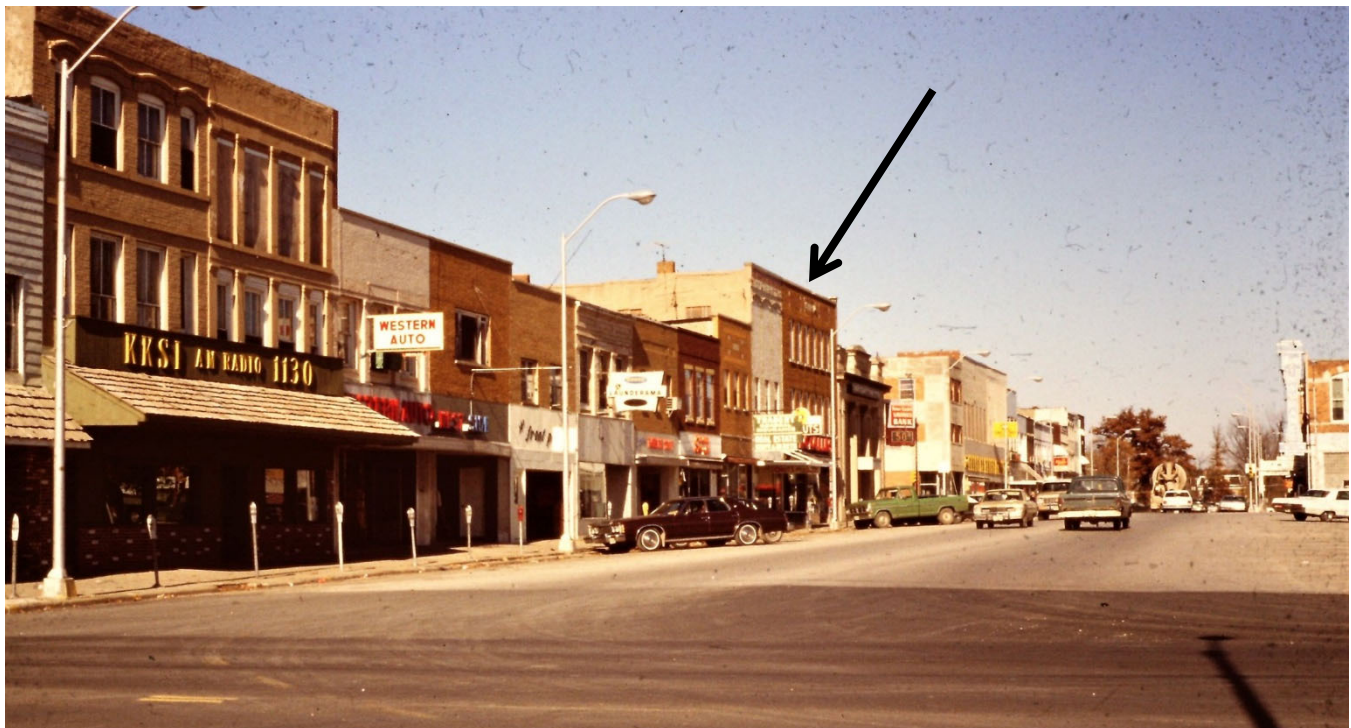
West side of square (100 block S. Jefferson St) around 1978 (HCHT Facebook album)