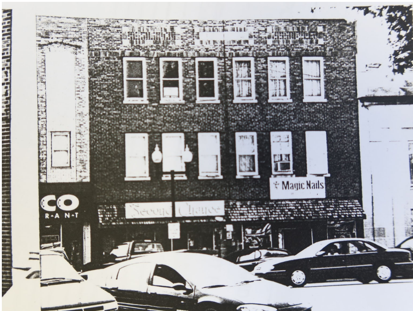
Building in 2003 (City of Mt Pleasant building permits)