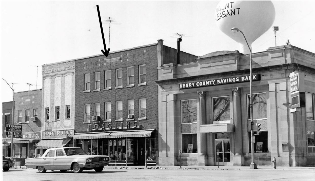
North end of west side of square (100 block S. Jefferson St) in late 1960s (HCHT Facebook album)