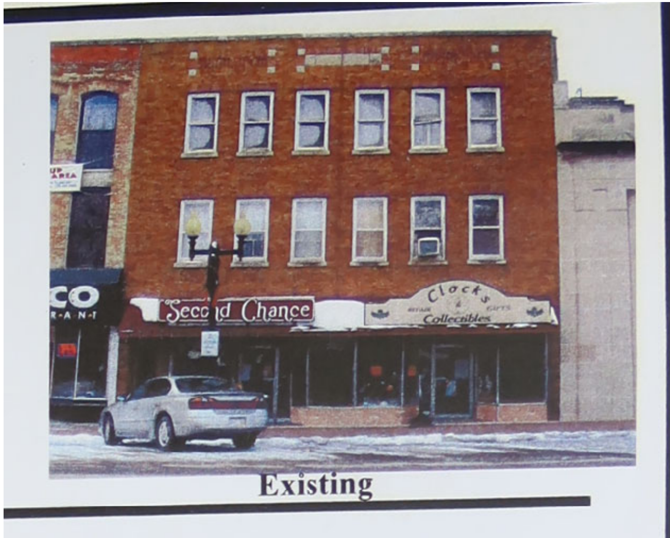
Building in January 2006 (City of Mt Pleasant building permits)