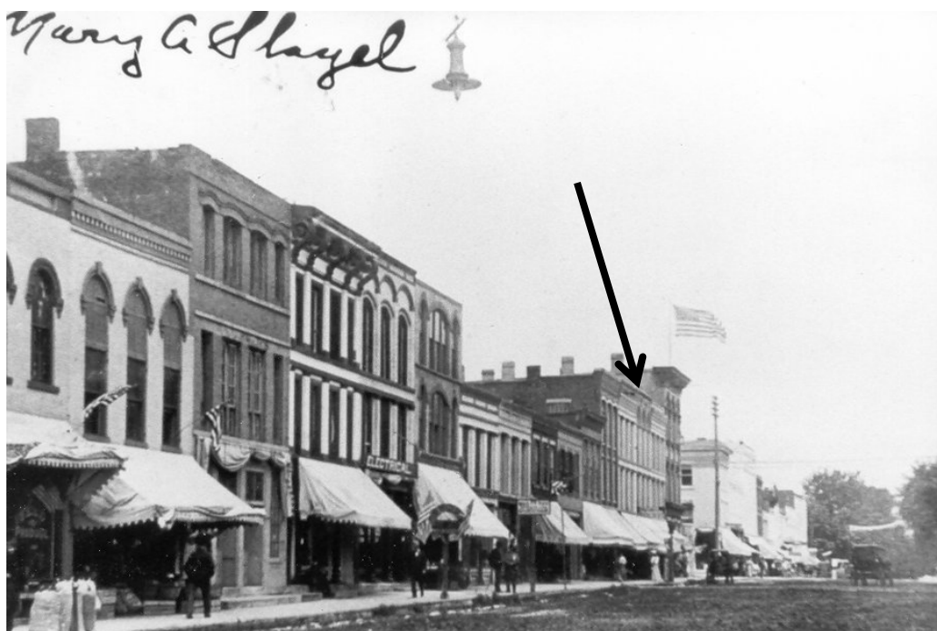
West side of square (100 block S. Jefferson St) around 1910 (HCHT Facebook album)