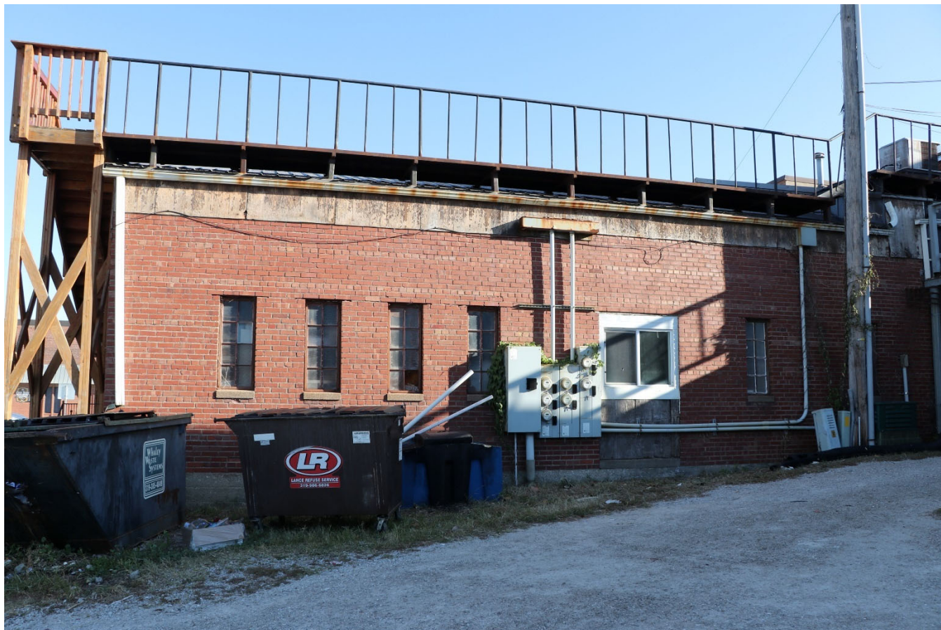
Photograph 44-00204-006. South elevation of rear addition, looking north (October 2023)