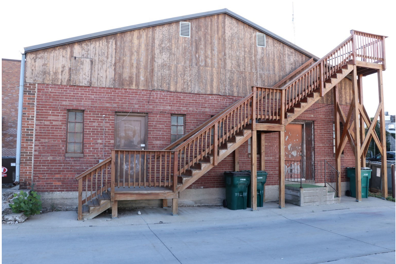
Photograph 44-00204-005. West (Rear) elevation of rear addition, looking east (October 2023)