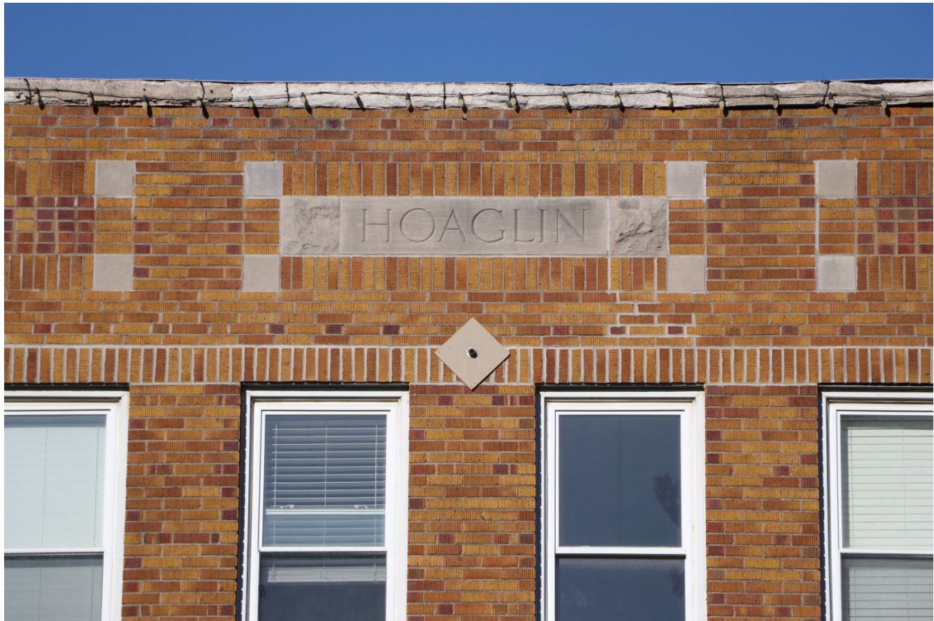
Photograph 44-00204-004. Parapet on east elevation, looking west (October 2023)