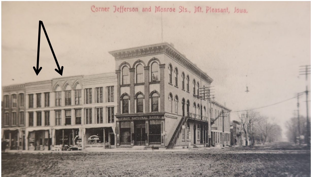
North end of west side of square (100 block S. Jefferson St) in 1890s (HCHS files, library)