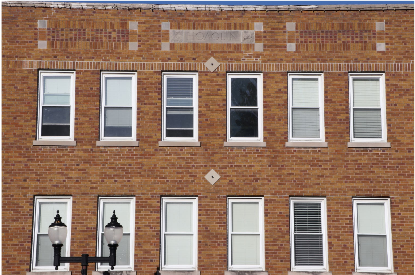
Photograph 44-00204-003. Upper stories on east elevation, looking west (October 2023)