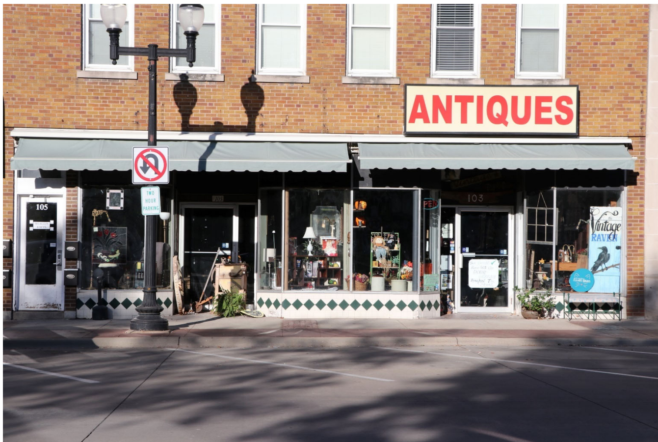
Photograph 44-00204-002. Storefront on east elevation, looking west (October 2023)