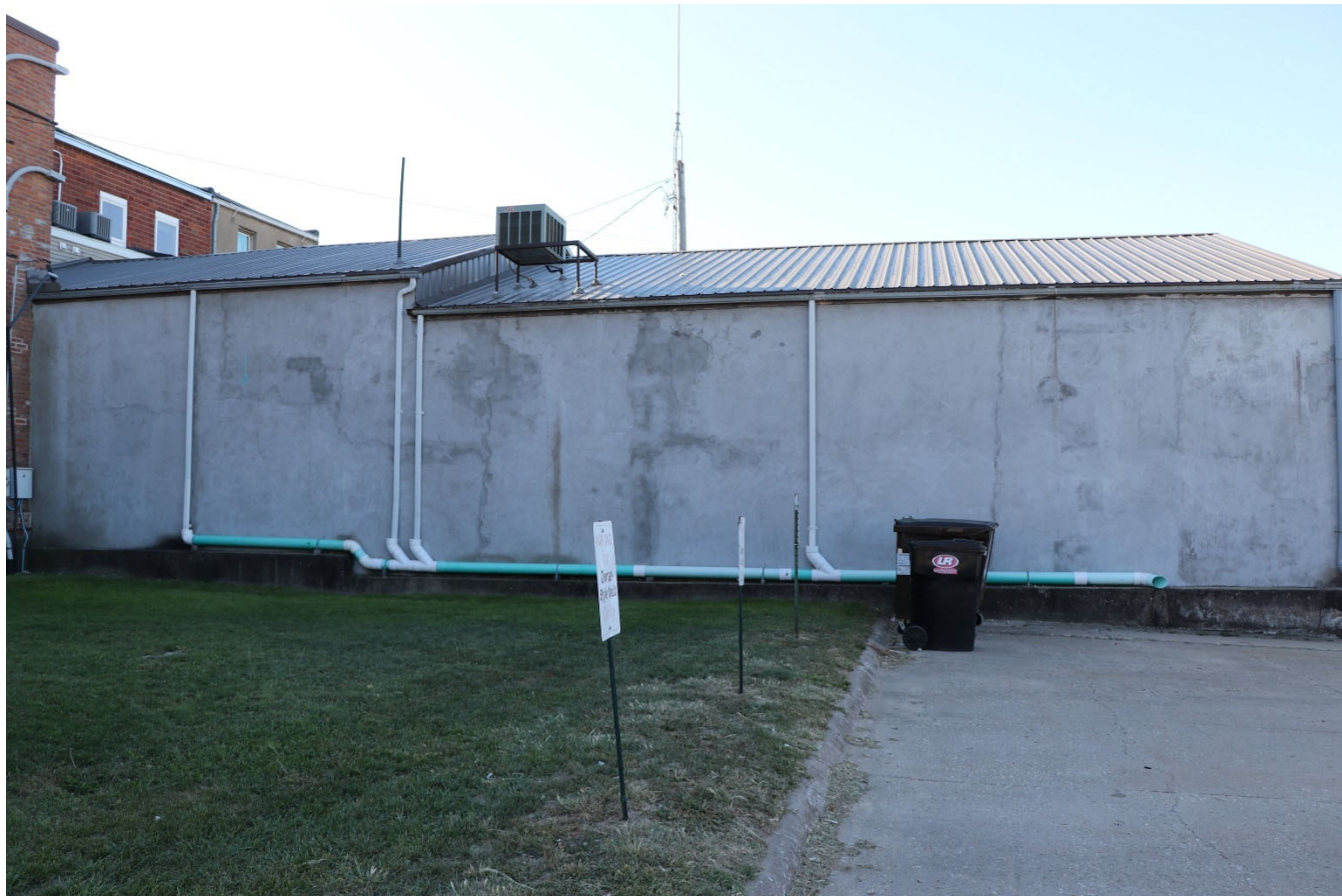
Photograph 44-00204-007. North elevation of rear addition, looking south (October 2023)