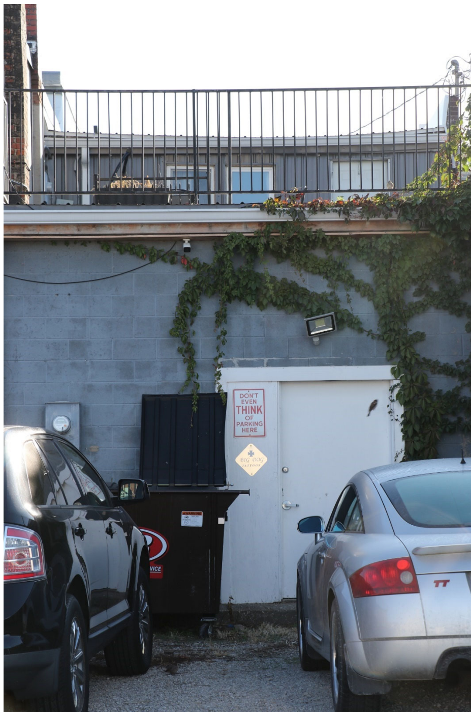
Photograph 44-00207-002. West elevation, looking east (October 2023)