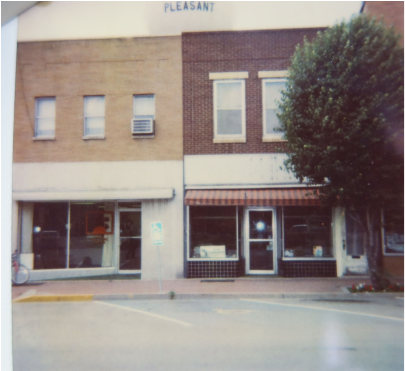
Building in May 1991 (City of Mt Pleasant building permits)