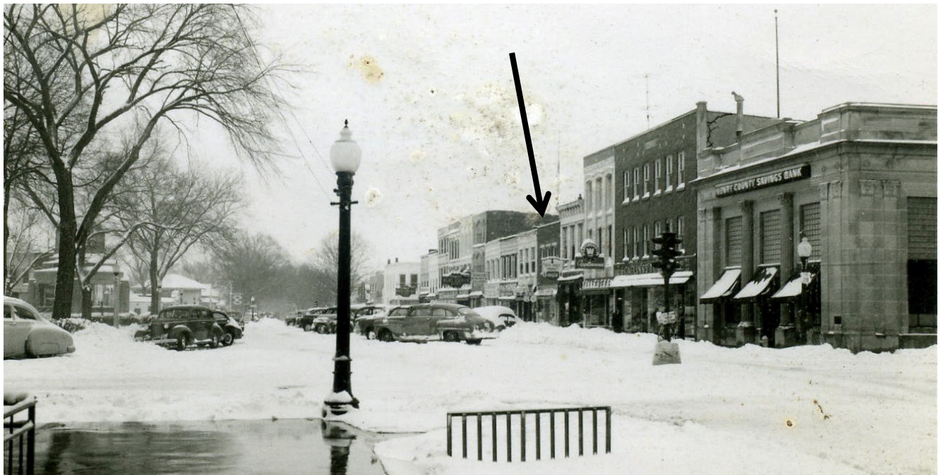
West side of square (100 block S. Jefferson St) in 1940s (HCHT Facebook album)