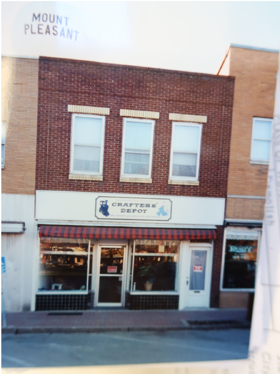
Building in January 1999 (City of Mt Pleasant building permits)