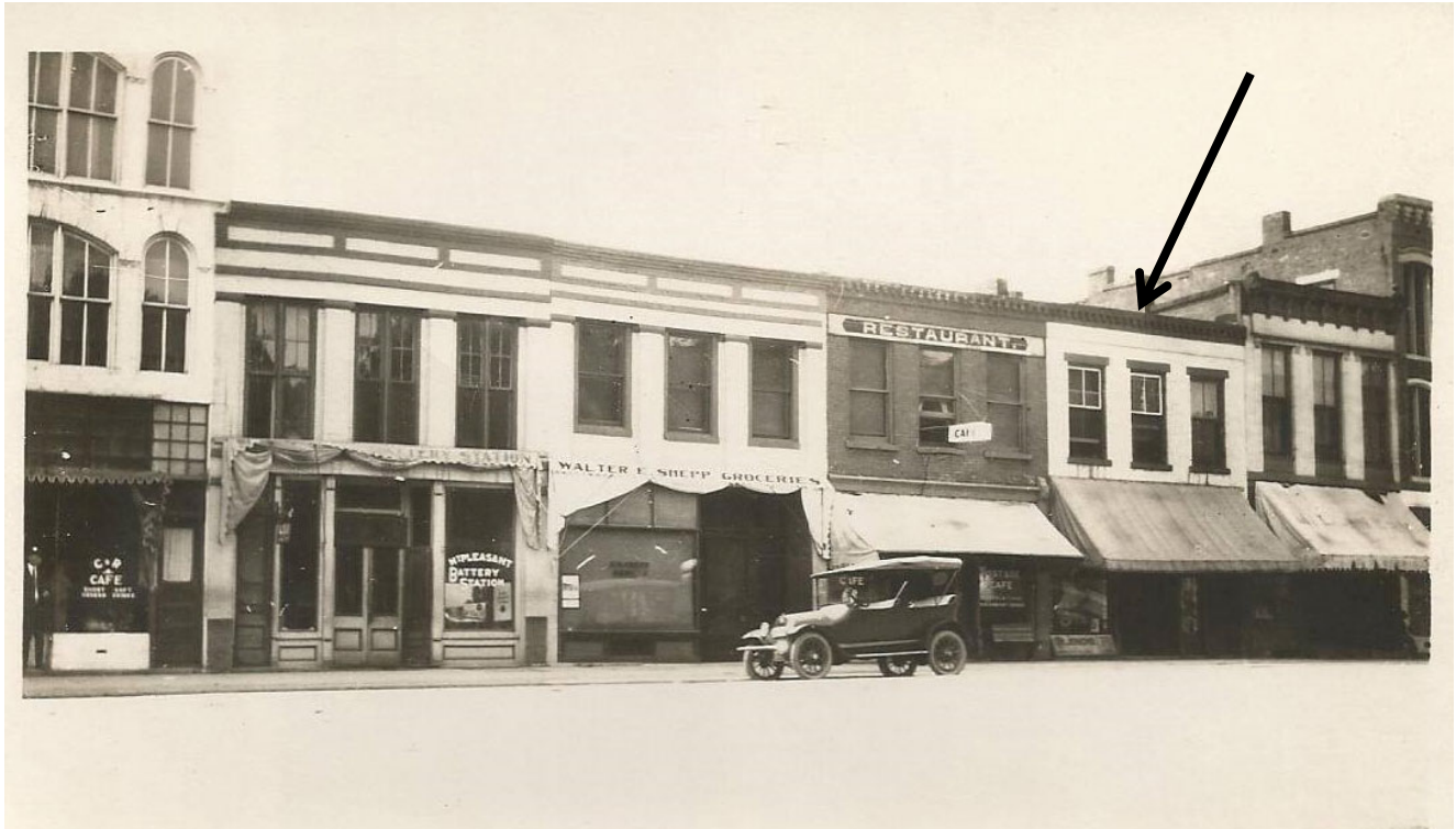
West side of square (100 block S. Jefferson St) around 1918 (HCHT Facebook album)