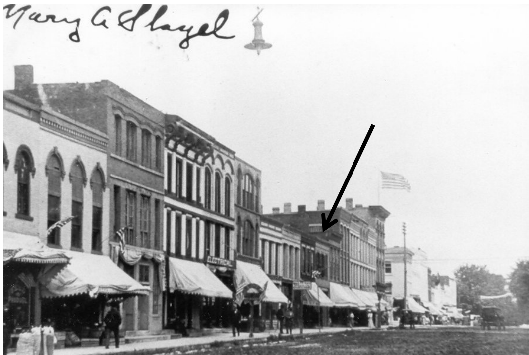
West side of square (100 block S. Jefferson St) around 1910