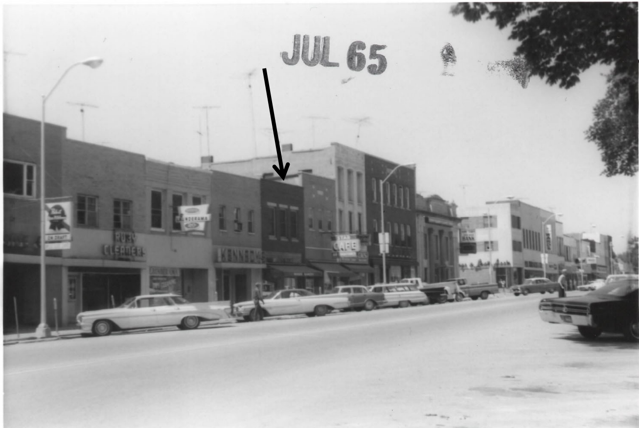
West side of square (100 block S. Jefferson St) in 1965