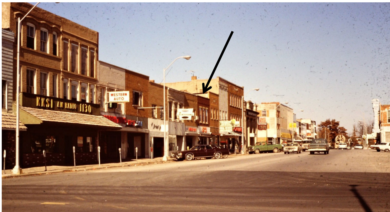
West side of square (100 block S. Jefferson St) around 1978 (HCHT Facebook album)