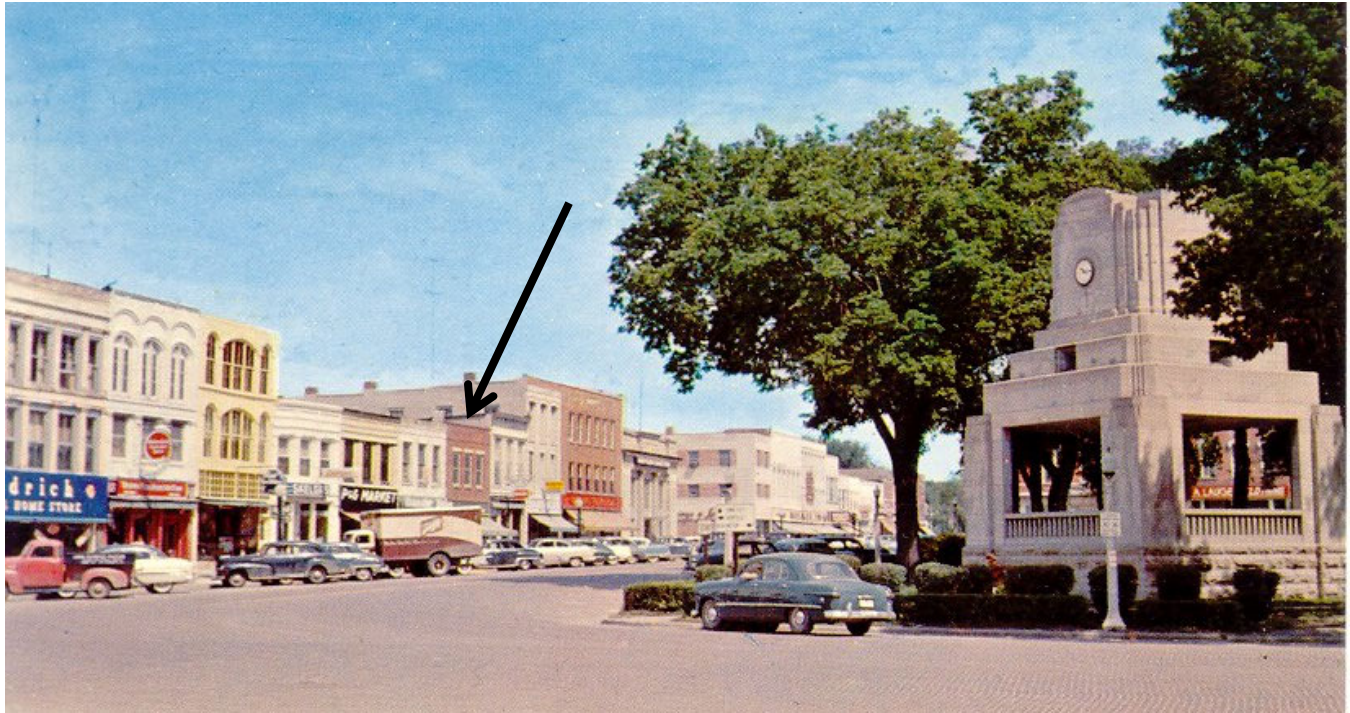
West side of square (100 block S. Jefferson St) in 1950s (HCHT Facebook album)