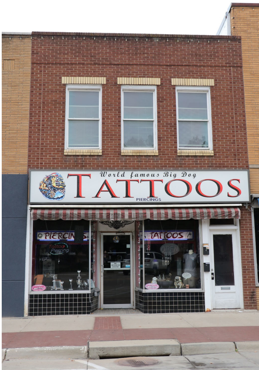
Photograph 44-00207-001. East elevation, looking west (October 2023)