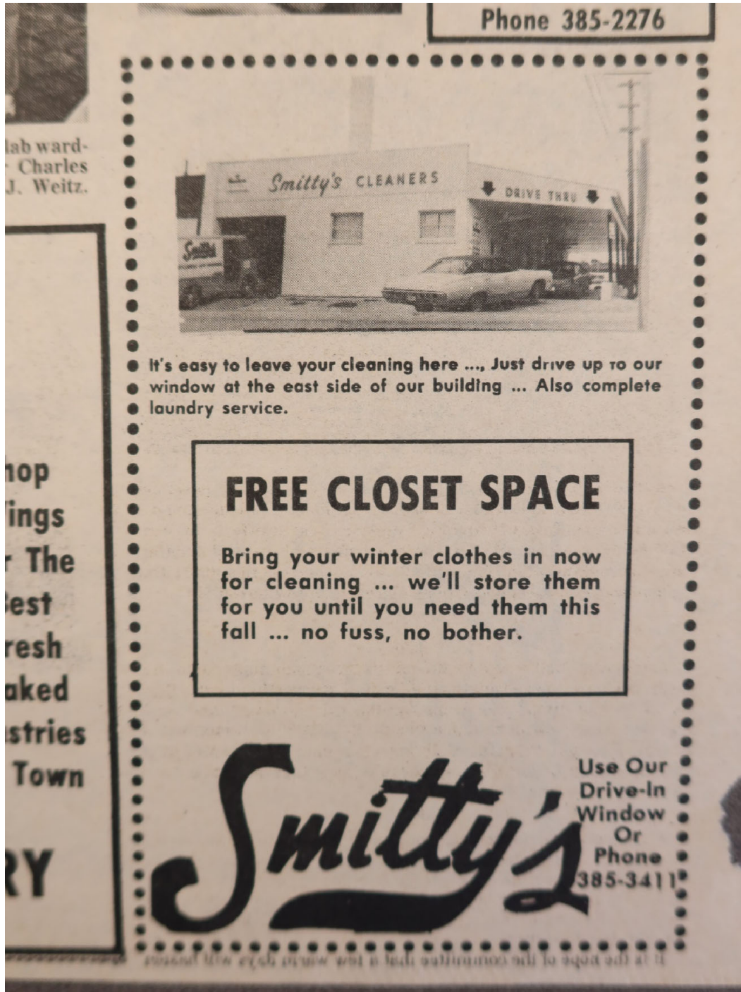
Building after remodel for Smitty's in 1970s