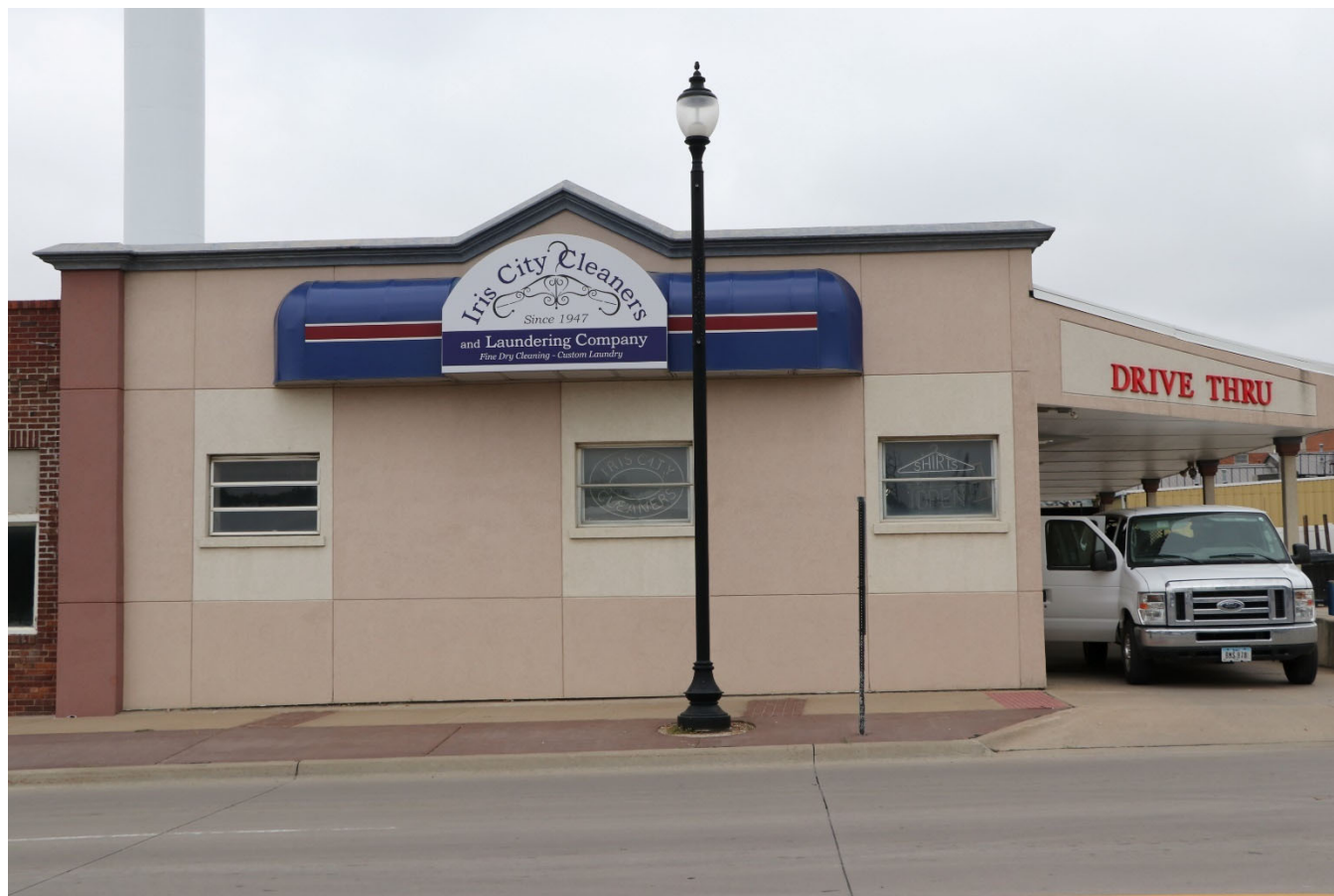
Photograph 44-00446-001. South elevation, looking north (October 2023)