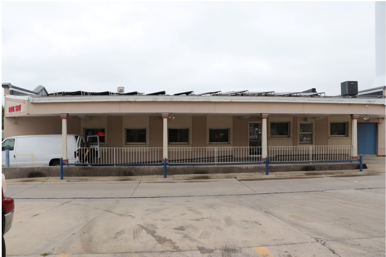
Photograph 44-00446-002. East elevation, looking west (October 2023)