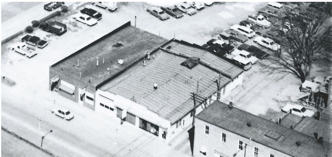
Building around 1970 (Magnuson, HCHT files)