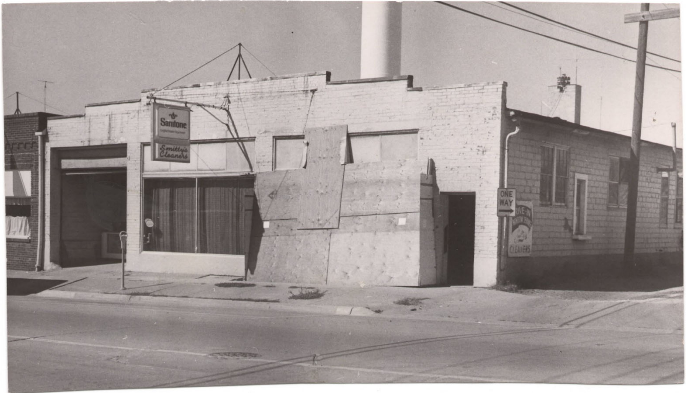
Building as Smitty's in 1960s (HCHT Facebook album)