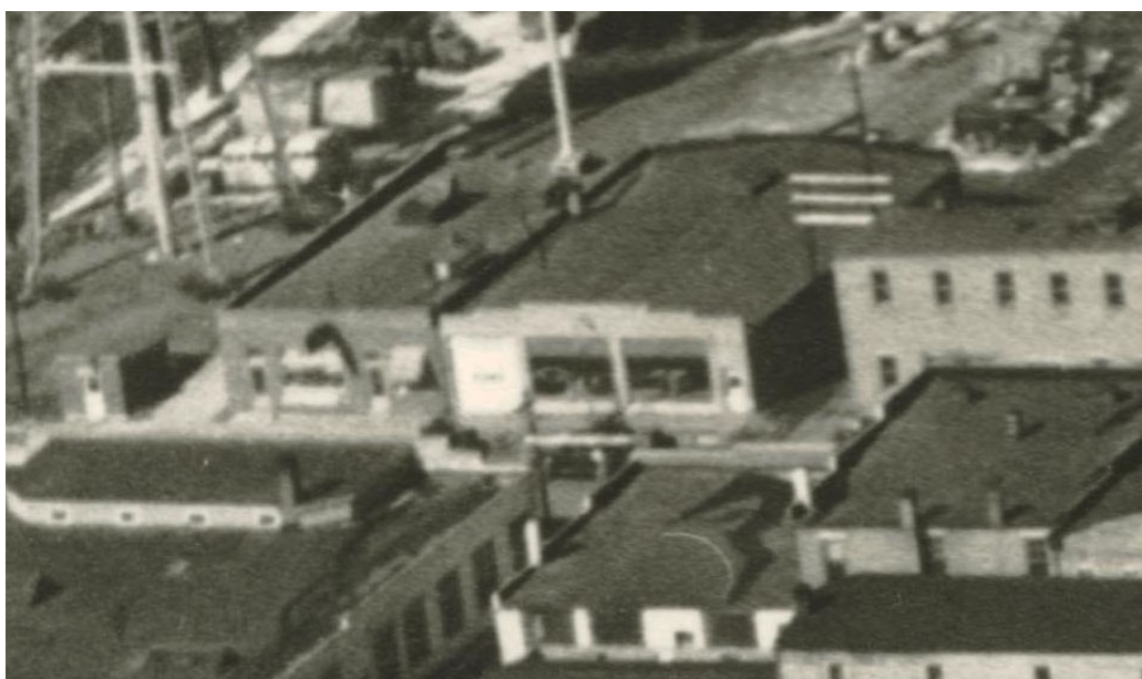
Building on section of 1947 aerial photograph of Mt Pleasant, looking north