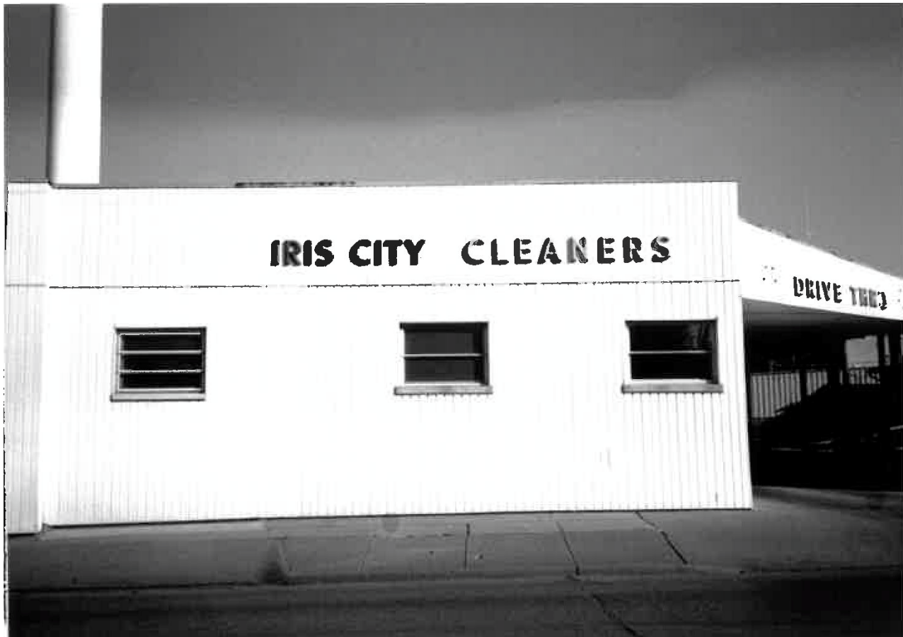
1990 survey photograph (Naumann 1991)