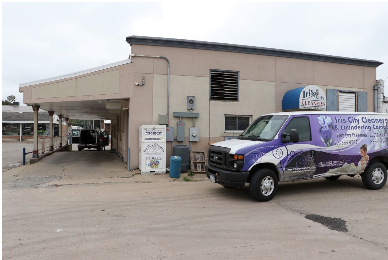
Photograph 44-00446-003. North elevation, looking south (October 2023)