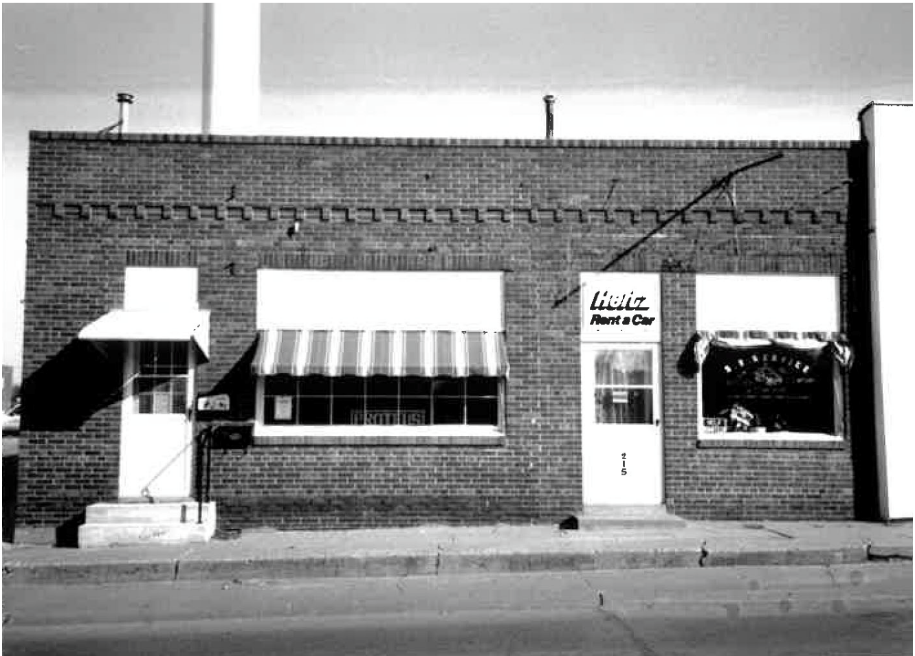
1990 survey photograph (Naumann 1991)