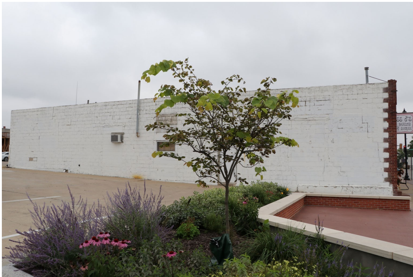
Photograph 44-00447-004. West elevation, looking east (October 2023)