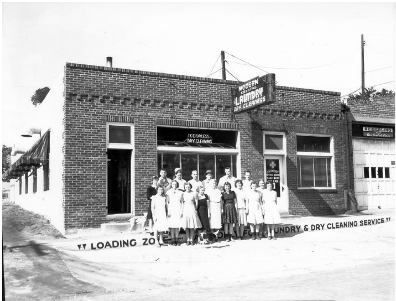
Modern Laundry in 1940s (HCHT Facebook album)