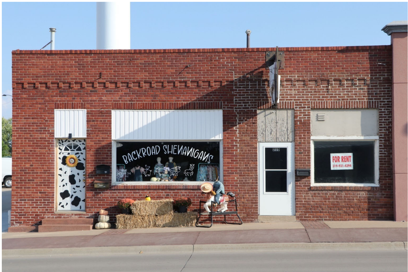
Photograph 44-00447-001. South elevation, looking north (October 2023)