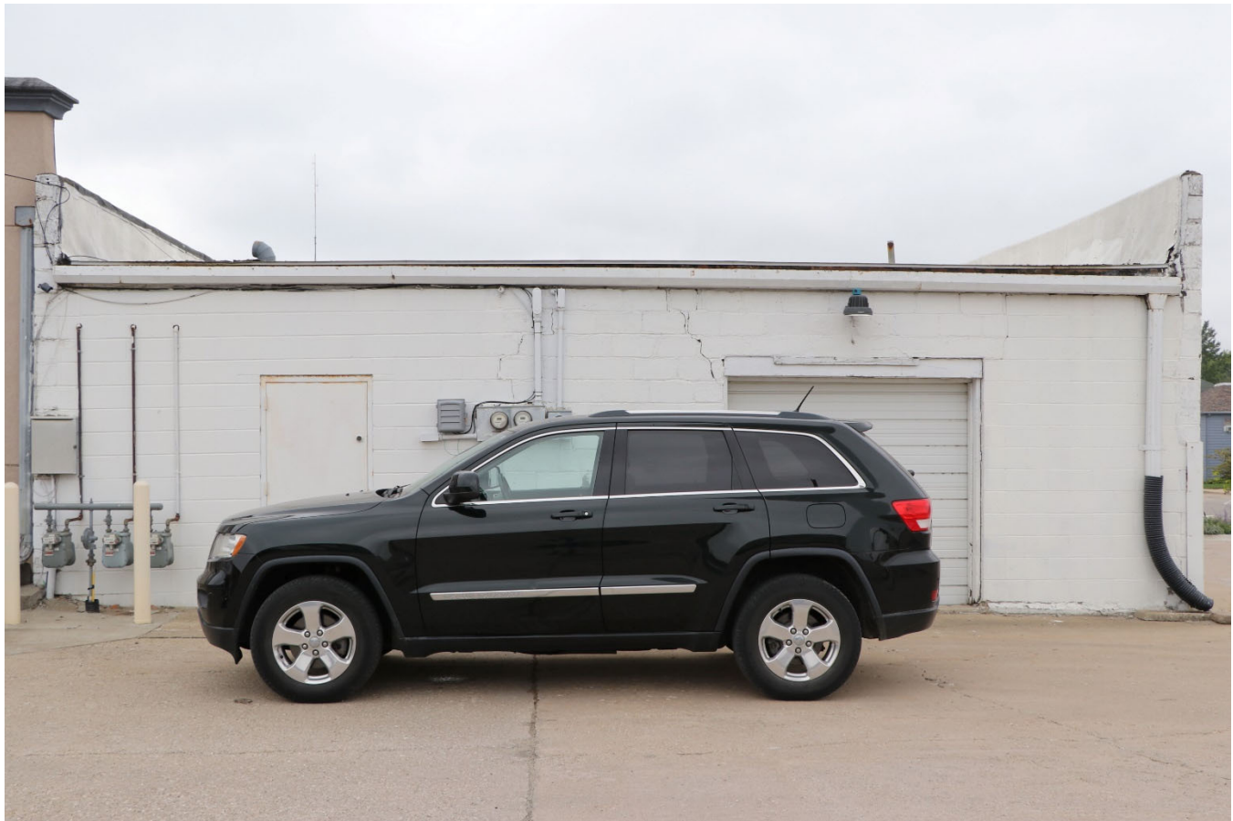
Photograph 44-00447-005. North elevation, looking south (October 2023)