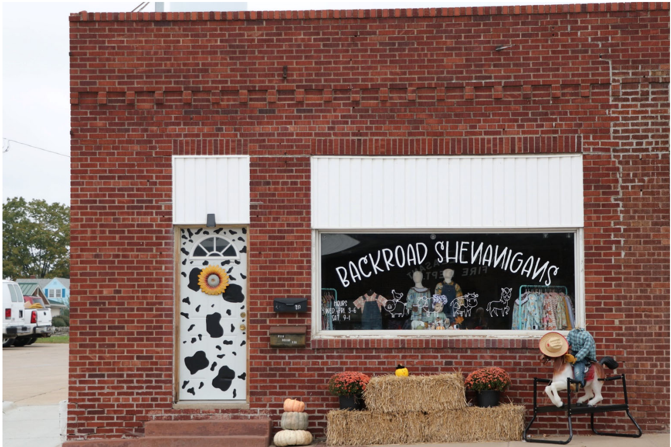
Photograph 44-00447-002. West half of south elevation, looking north (October 2023)