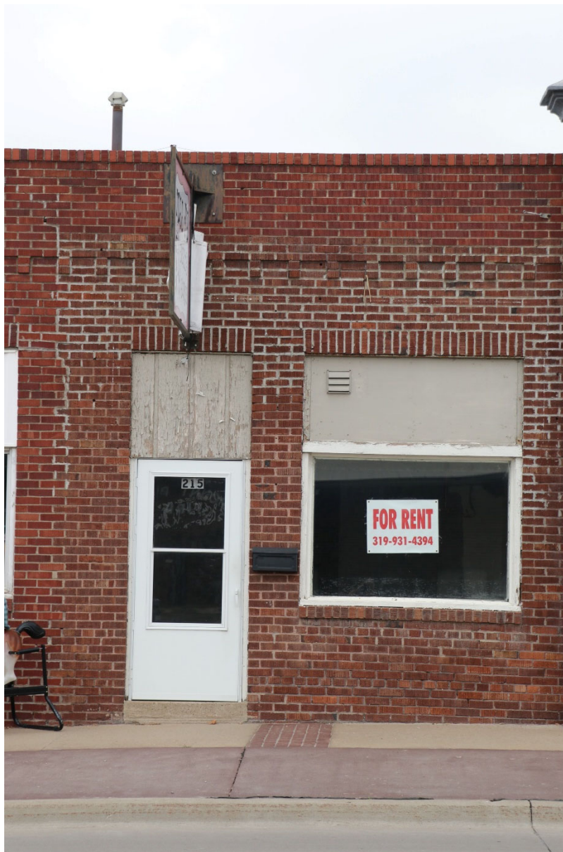
Photograph 44-00447-003. East half of south elevation, looking north (October 2023)