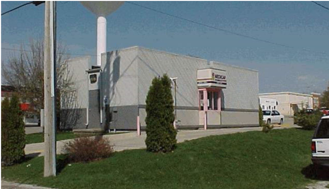
old photograph