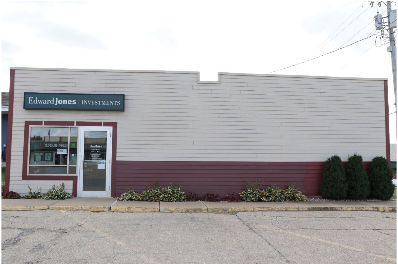
Photograph 44-02276-001. North elevation, looking south (October 2023)