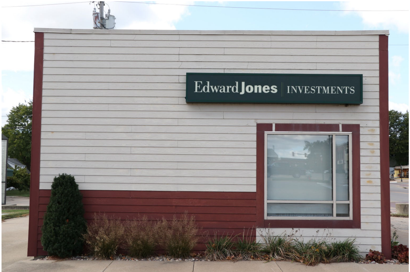
Photograph 44-02276-002. East elevation, looking west (October 2023)