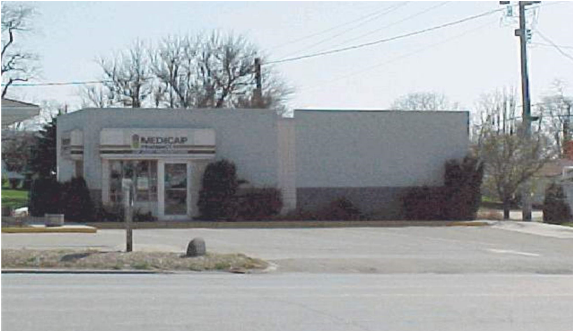
old photograph