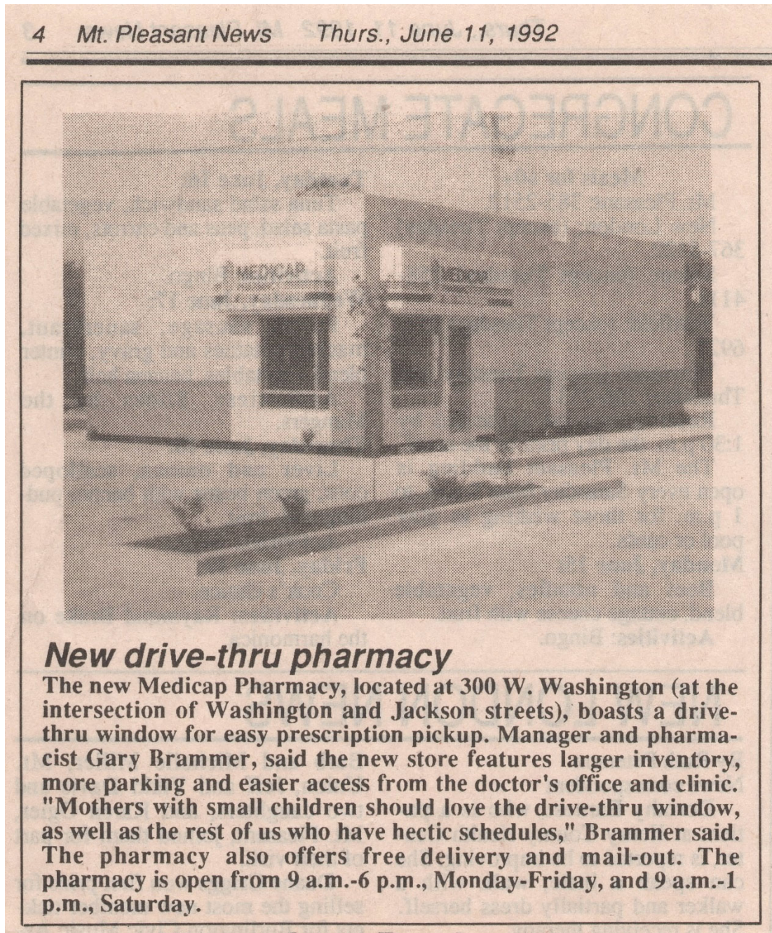
Building in June 1992 ( Mt Pleasant News , June 11, 1992, 4)

Medicap Pharmacy Henry Name of Property County 300 W. Washington St Mount Pleasant Address City