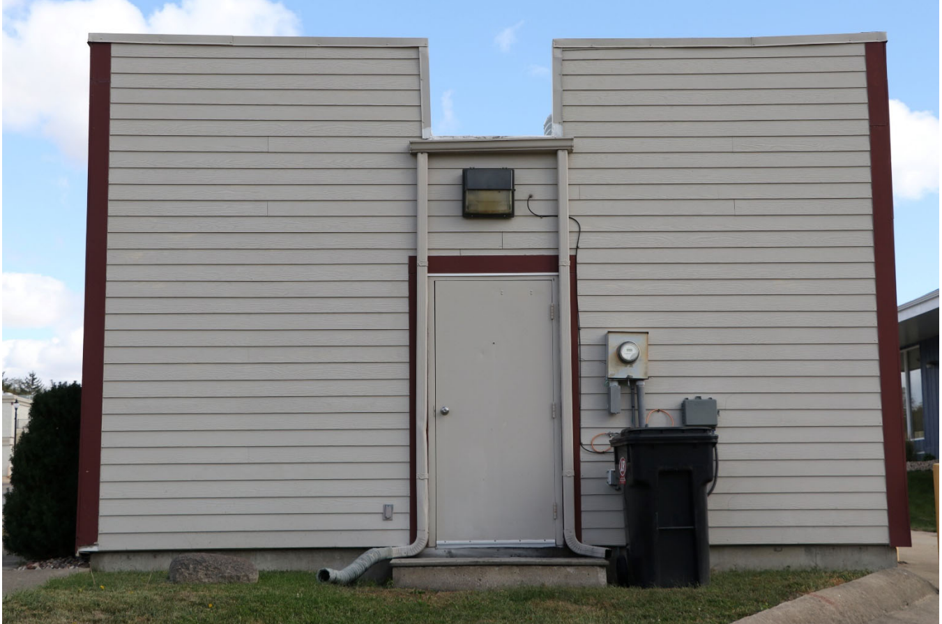
Photograph 44-02276-004. West elevation, looking east (October 2023)