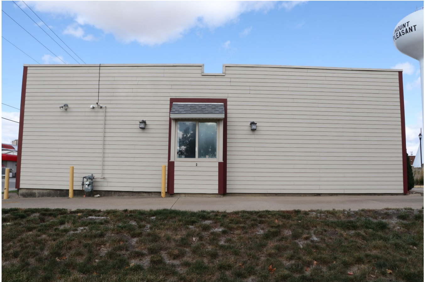
Photograph 44-02276-003. South elevation, looking north (October 2023)