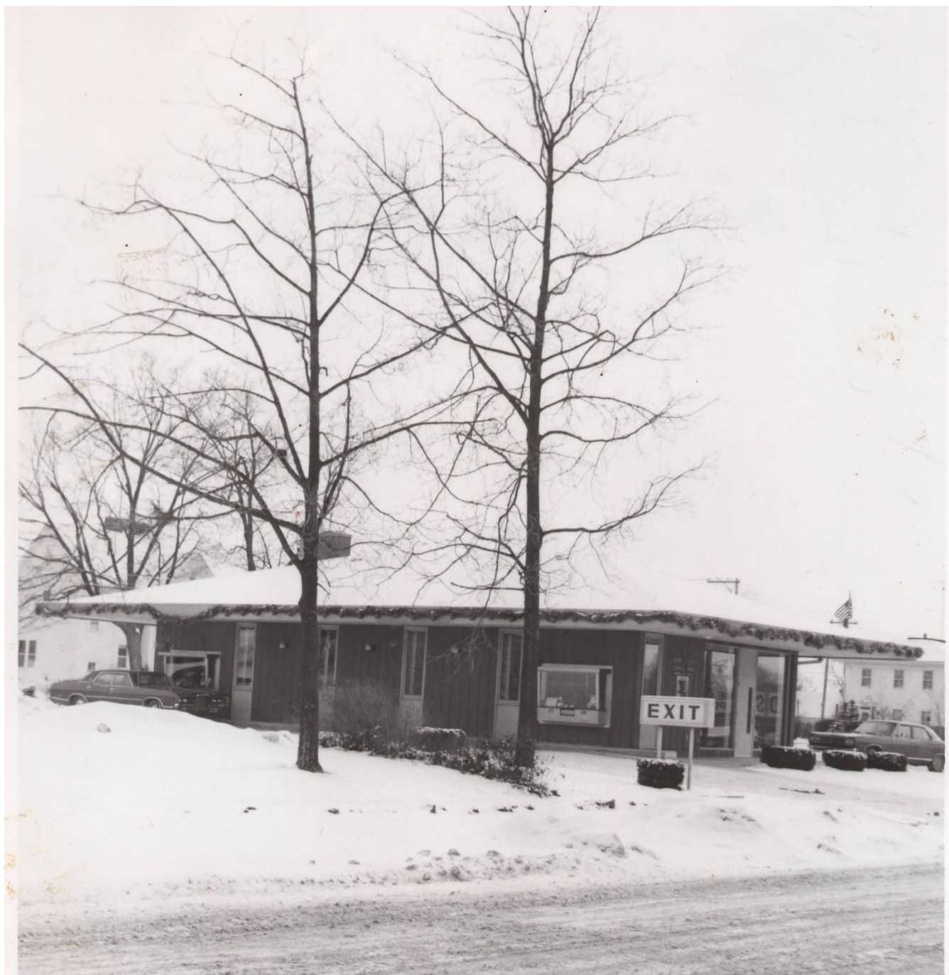
Henry Co Savings Bank drive thru at 301 E. Washington prior to move, January 4, 1974