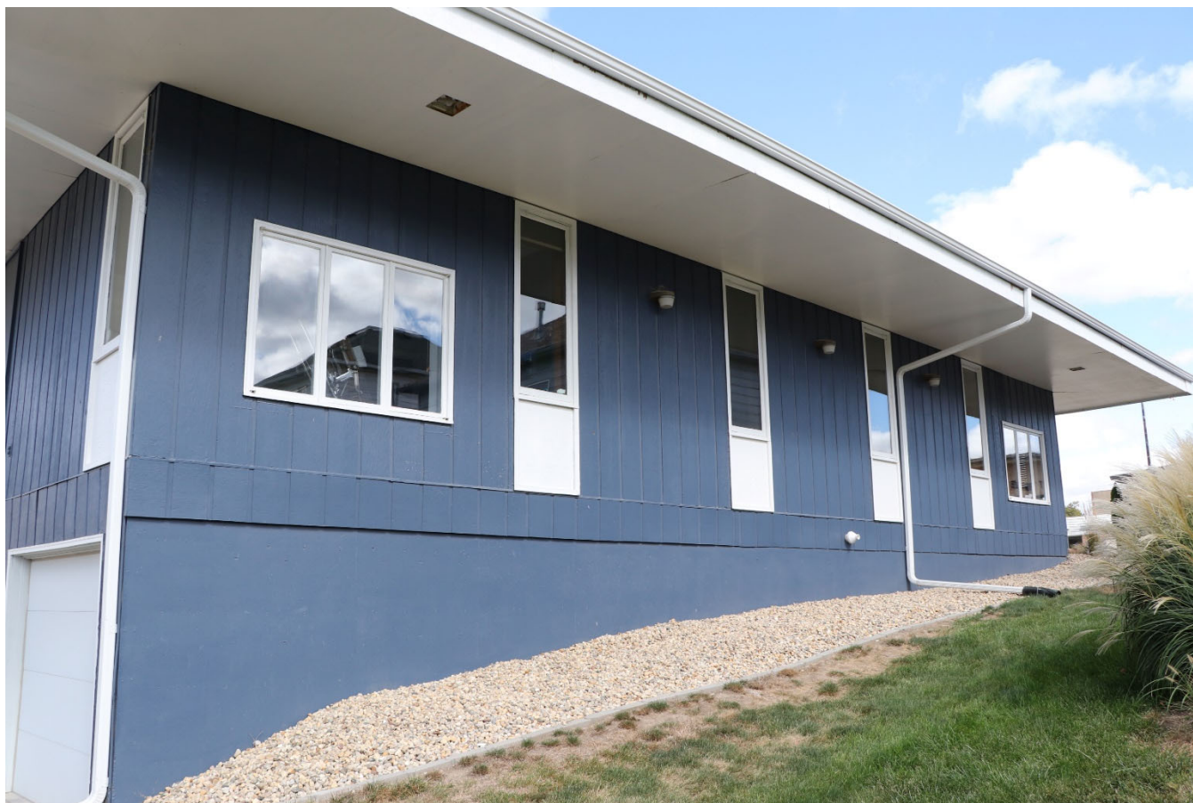
Photograph 44-02240-003. South elevation, looking northeast (October 2023)