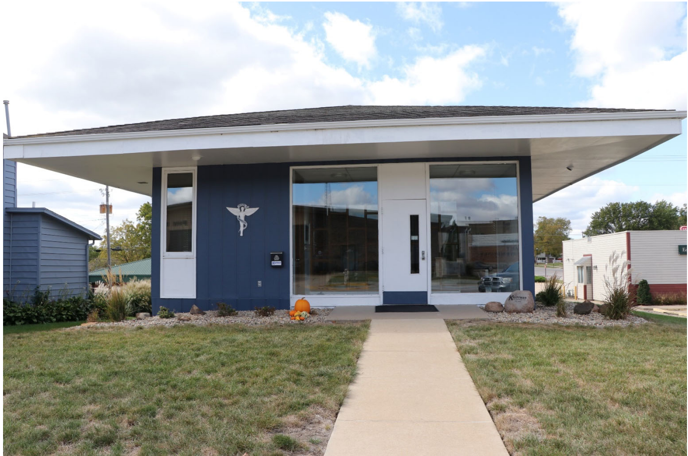
Photograph 44-02240-001. East elevation, looking west (October 2023)