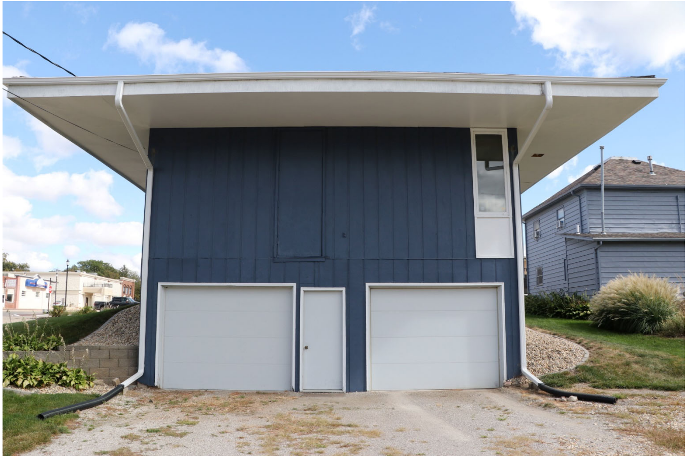
Photograph 44-02240-004. West elevation, looking east (October 2023)