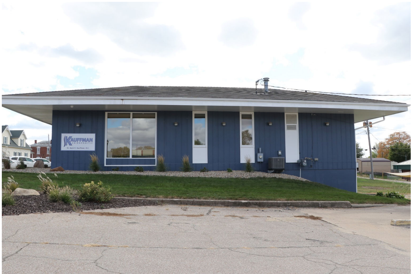
Photograph 44-02240-002. North elevation, looking south (October 2023)