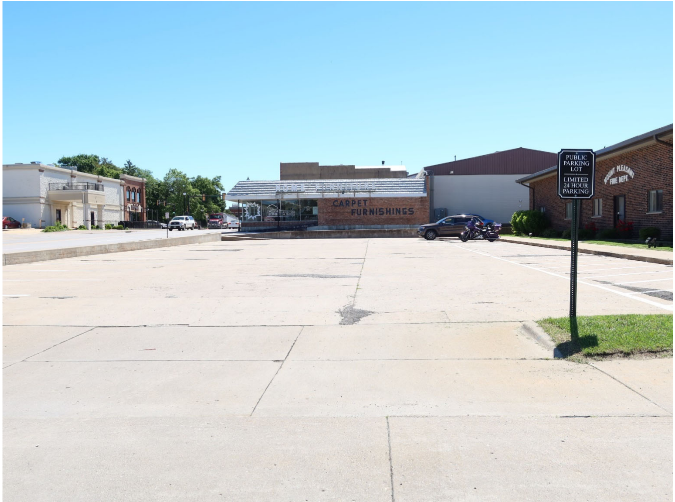
Photograph 44-02275-005. City parking lot, looking east (June 2024)