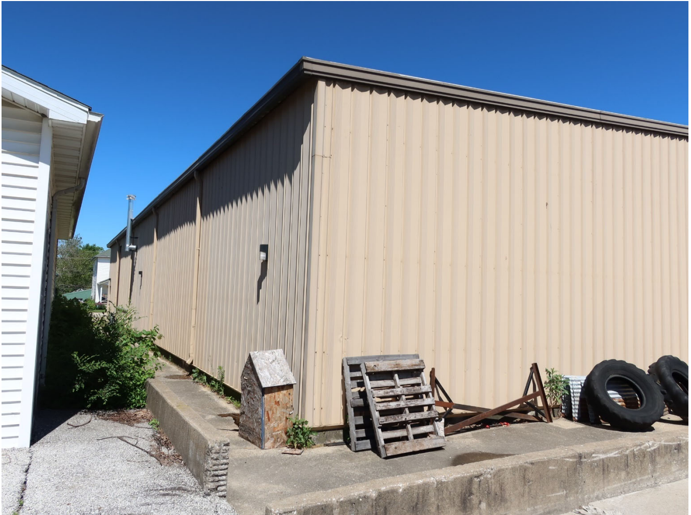
Photograph 44-02275-004. South elevation, looking west (June 2024)