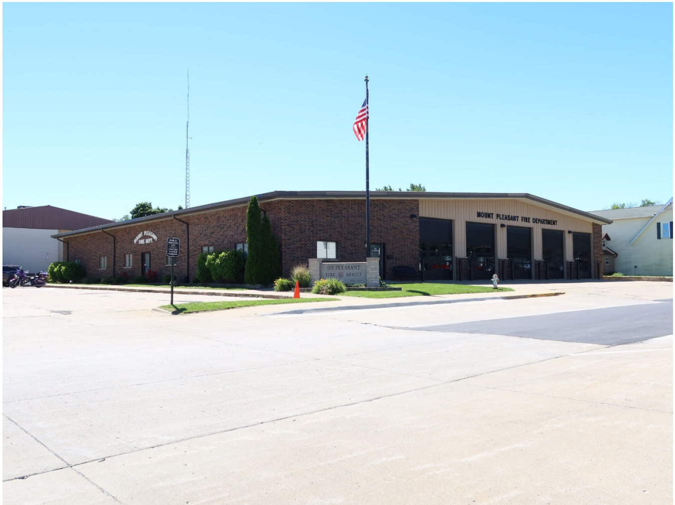
Photograph 44-02275-001. North and west elevations, looking southeast (June 2024)