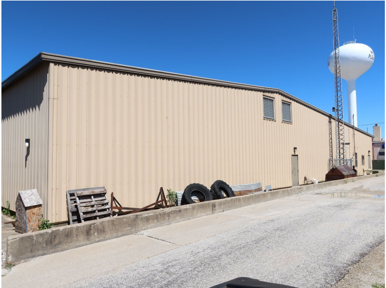
Photograph 44-02275-003. East elevation, looking northwest (June 2024)