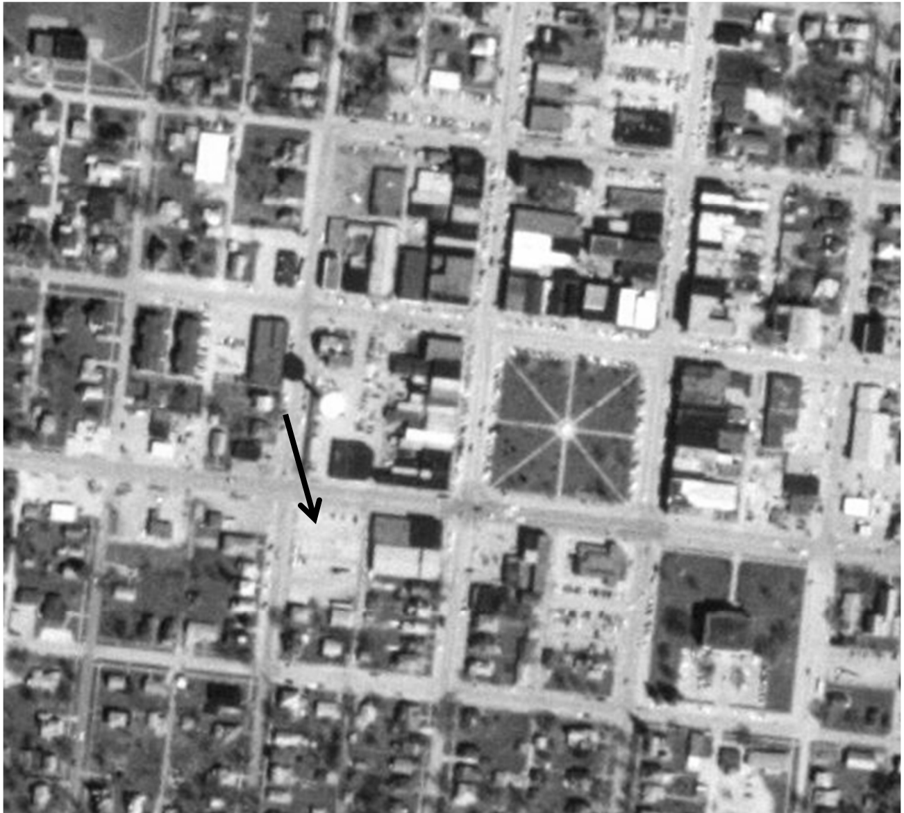
City parking lot on 1984 aerial of Mt Pleasant