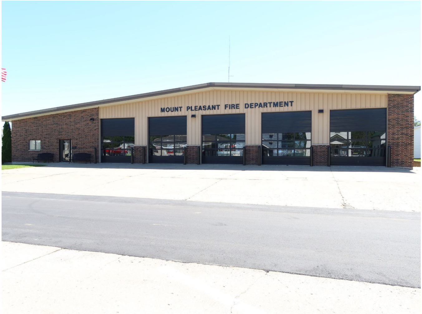
Photograph 44-02275-002. West elevation, looking east (June 2024)