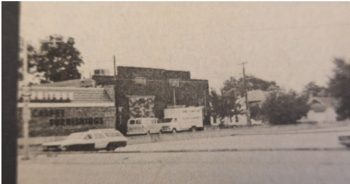
West elevation of building in 1975