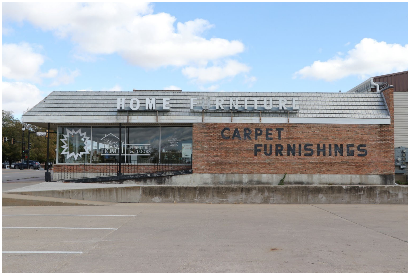
Photograph 44-00445-002. West elevation, looking east (October 2023)