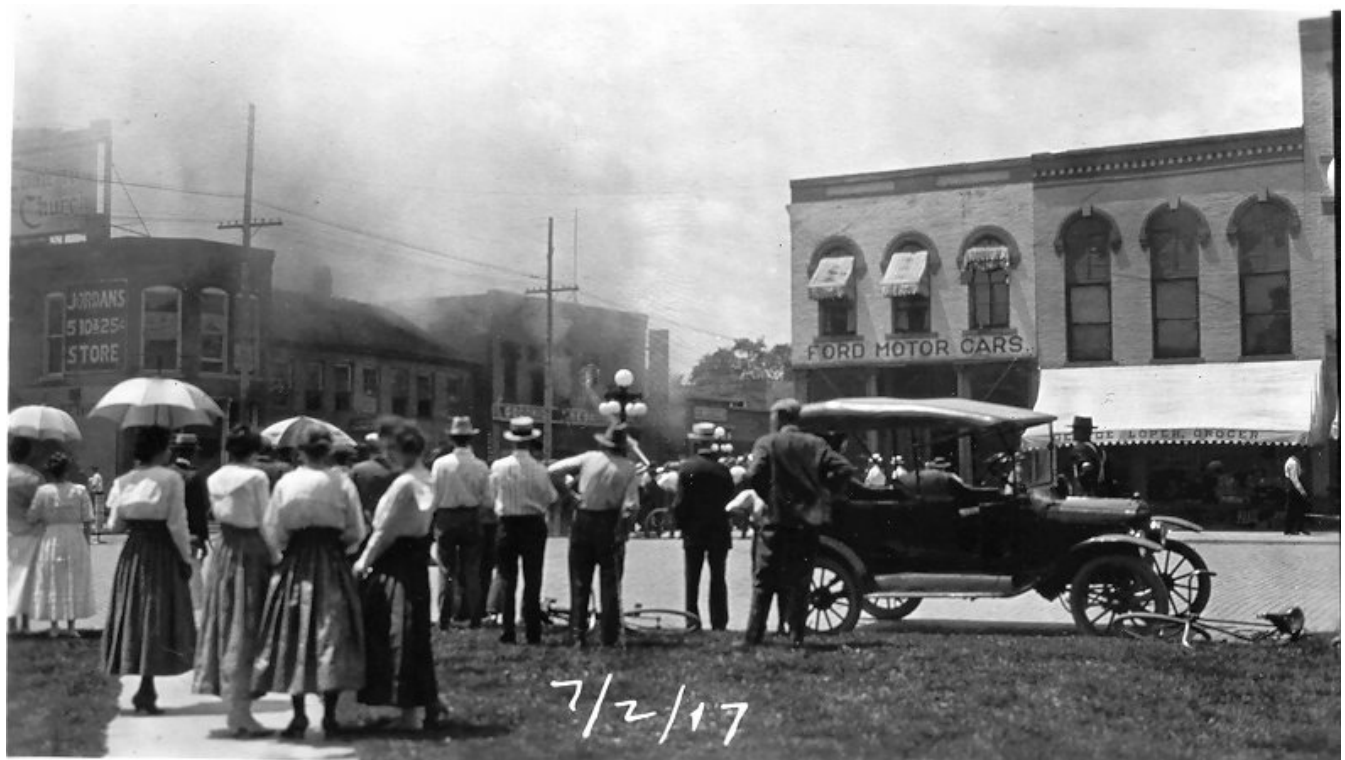
200 block of W. Washington St at left, 1917 fire (HCHT Facebook album)