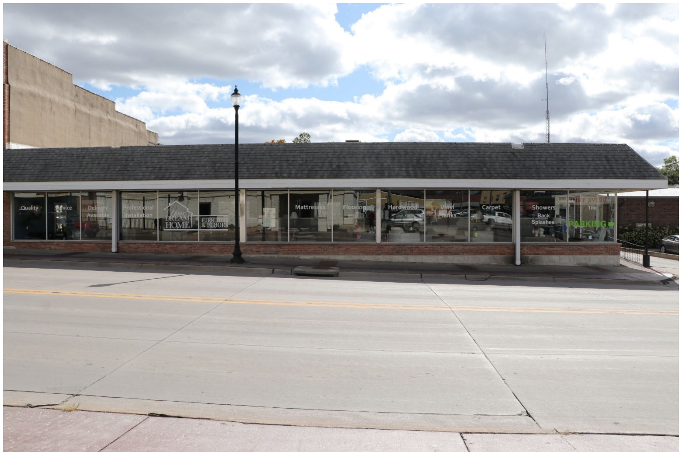
Photograph 44-00445-001. North elevation, looking south (October 2023)