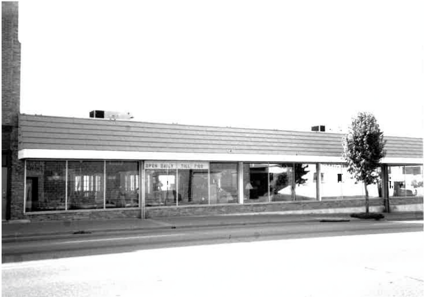
1990 survey photograph (Naumann 1991)

Home Furniture Henry Name of Property County 204 W. Washington St Mount Pleasant Address City