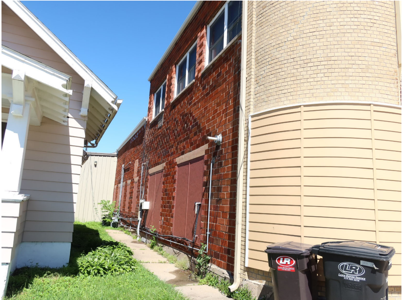
Photograph 44-02251-003. South elevation, looking northwest (June 2024)