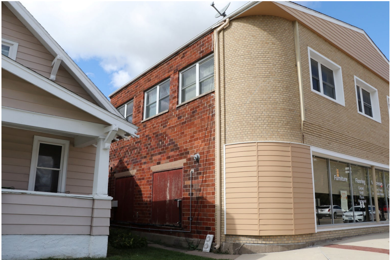
Photograph 44-02251-002. South elevation, looking northwest (October 2023)