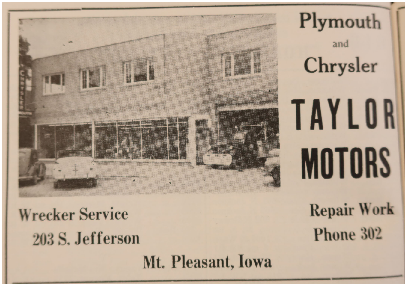
Taylor Motors ad in 1952 city directory

(Johnson Publishing Co. Mt Pleasant, Iowa, 1952 City Directory )