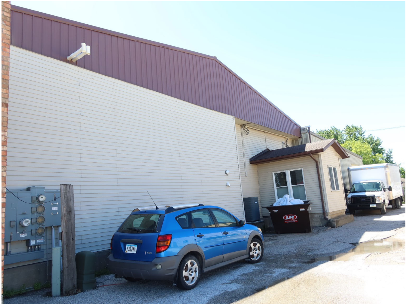
Photograph 44-02251-004. West elevation, looking southeast (June 2024)