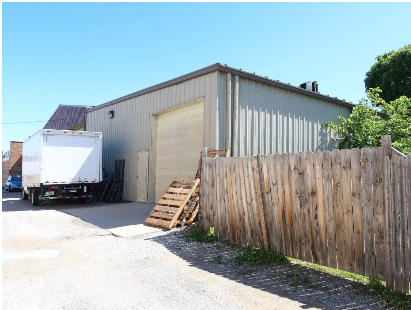
Photograph 44-02251-005. West elevation, looking northeast (June 2024)