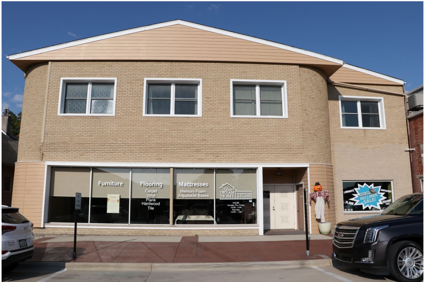
Photograph 44-02251-001. Façade of building, looking west (October 2023)