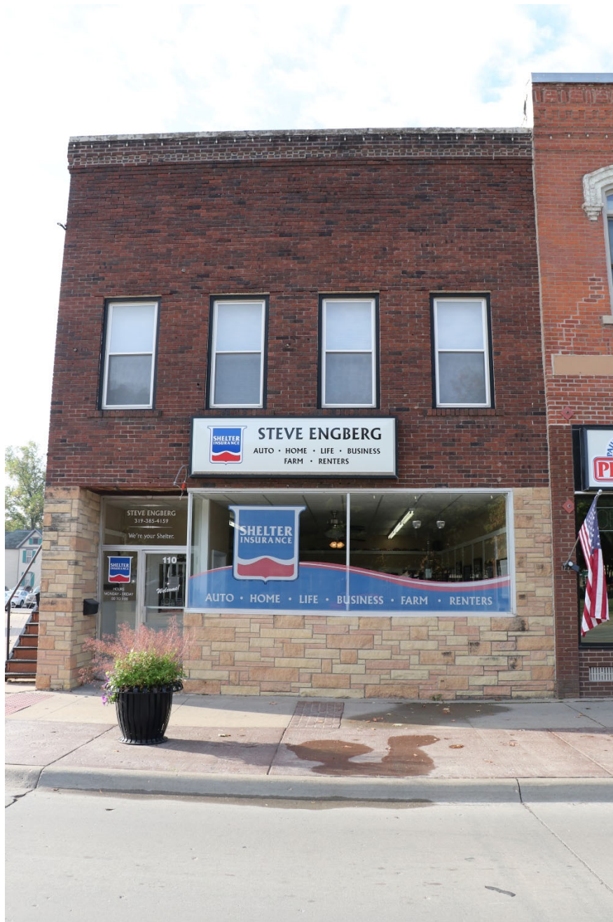
Photograph 44-00443-001. Façade of building, looking south (October 2023)