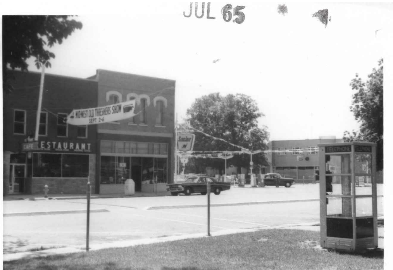
100 block of W. Washington St in July 1965