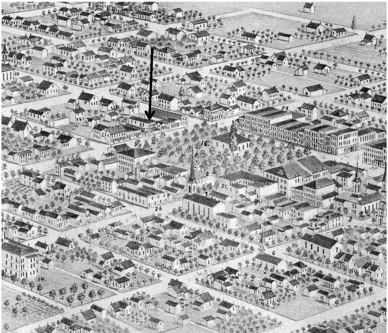
Birds-Eye View of the City of Mount Pleasant, 1869, looking southwest