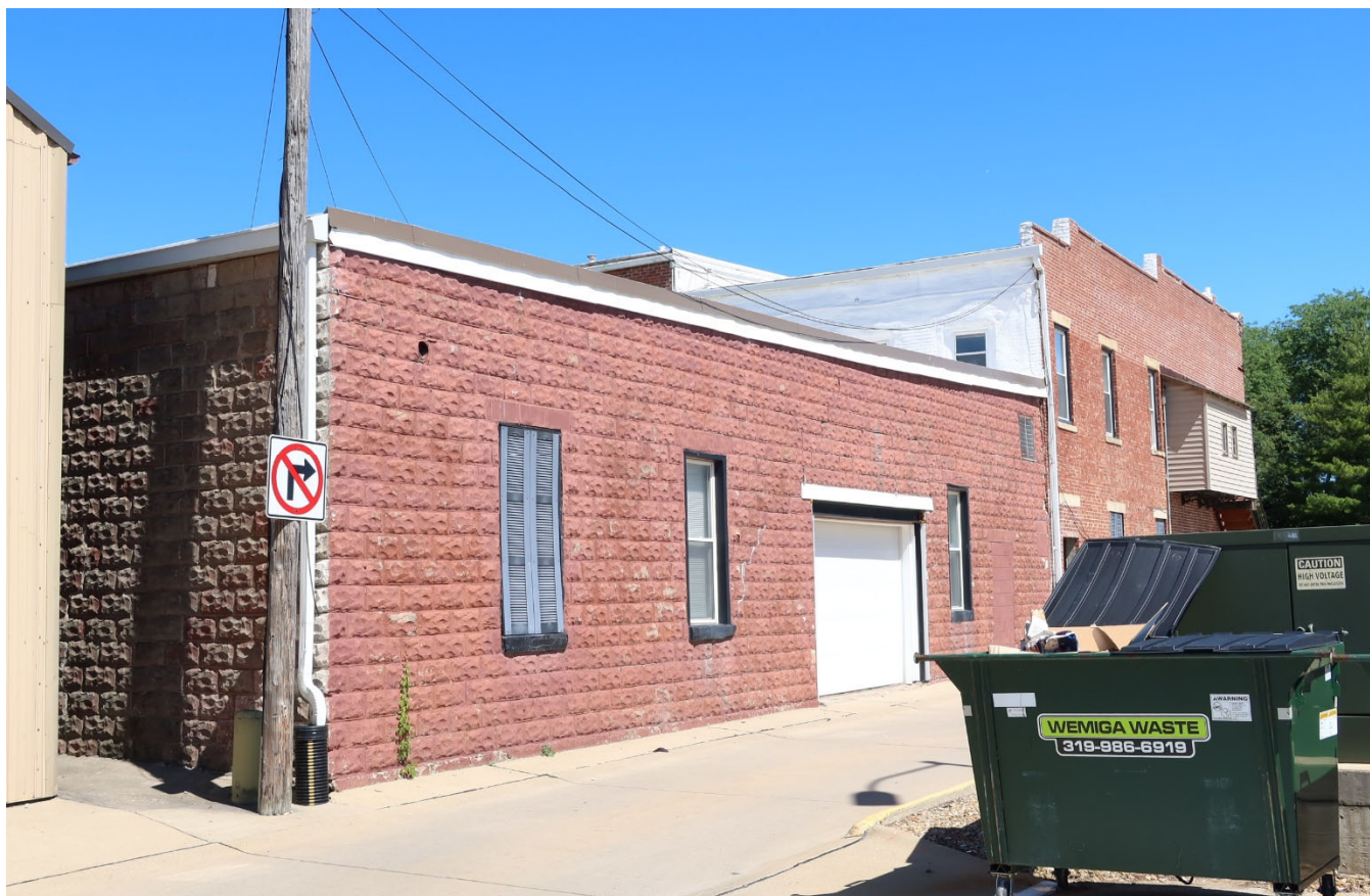
Photograph 44-00443-004. East elevation, looking northwest (June 2024)