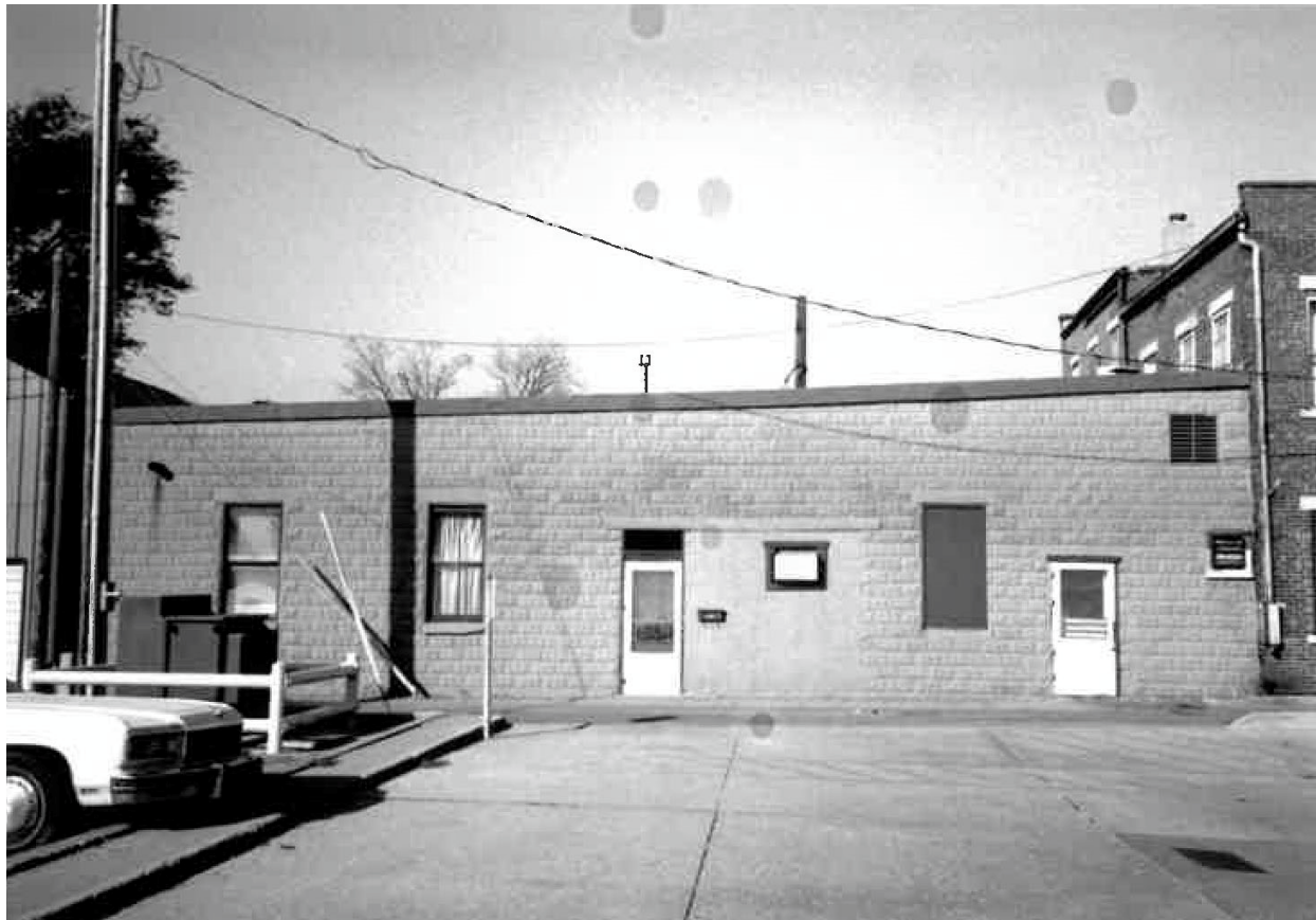
East elevation of rear addition, 1990 survey photograph (Naumann 1991)