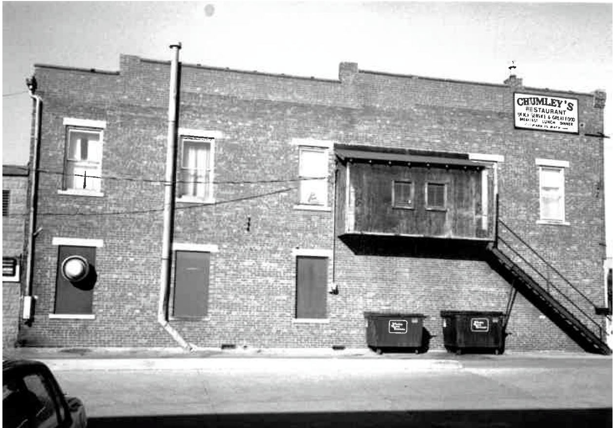
East elevation, 1990 survey photograph (Naumann 1991)