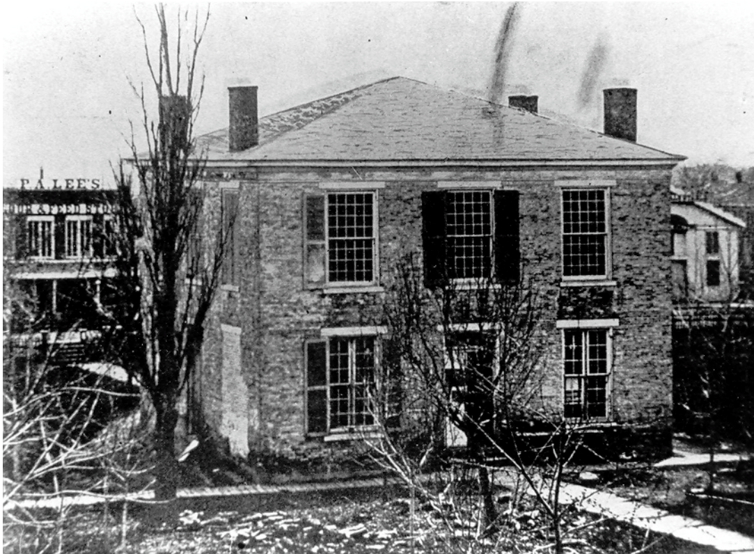
Courthouse in square in 1850s or 1860s, building of P.A. Lee visible to rear