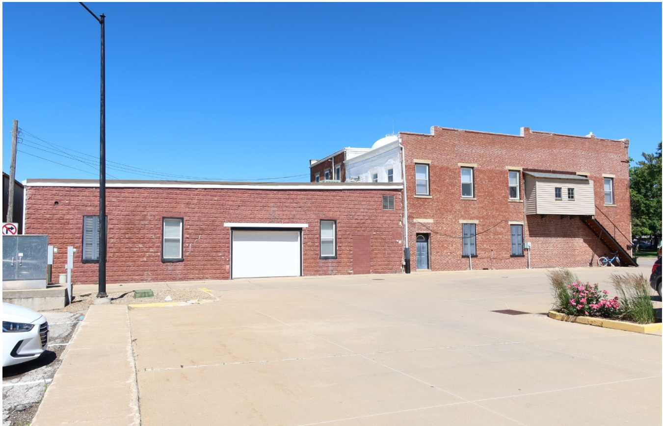
Photograph 44-00443-003. East elevation, looking west (June 2024)