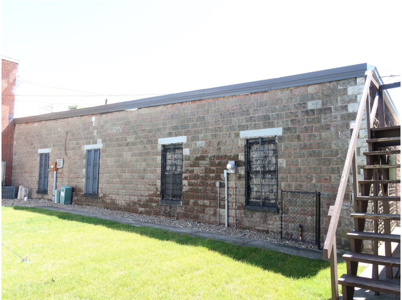
Photograph 44-00443-005. West elevation of rear addition, looking northeast (June 2024)