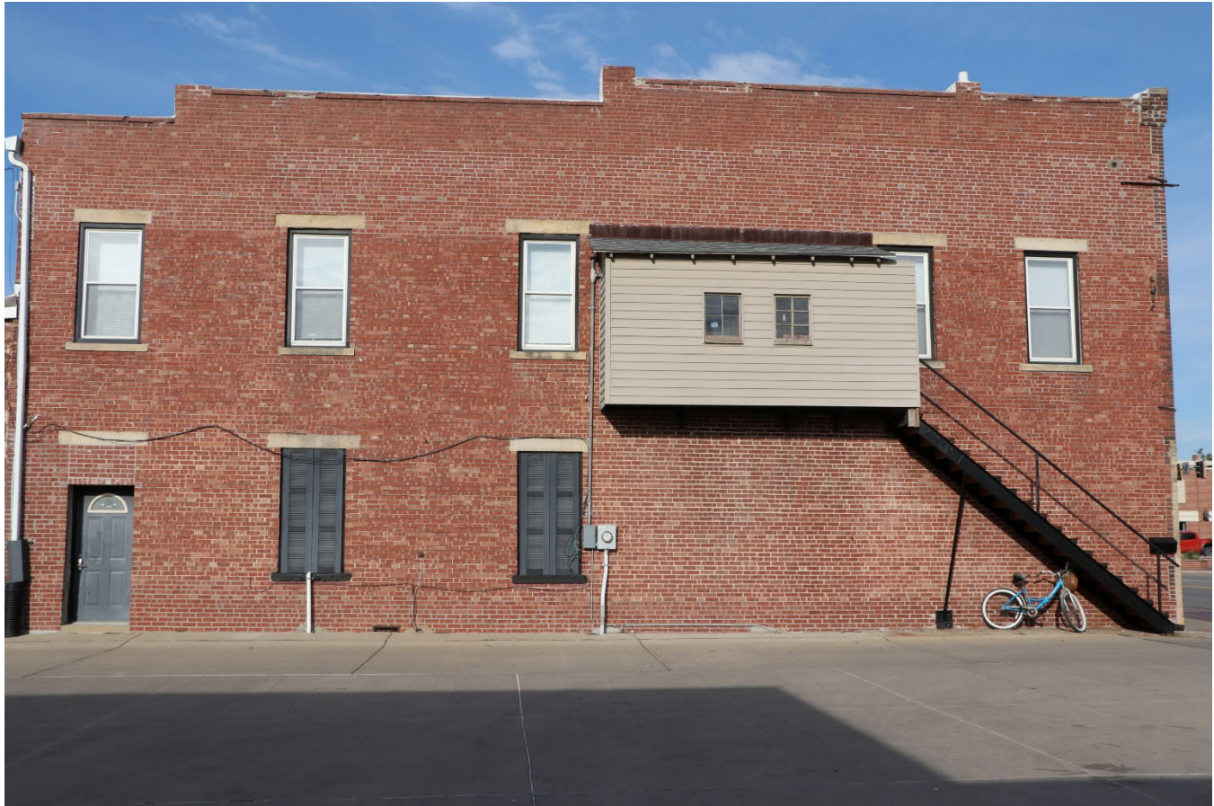
Photograph 44-00443-002. East elevation, looking west (October 2023)