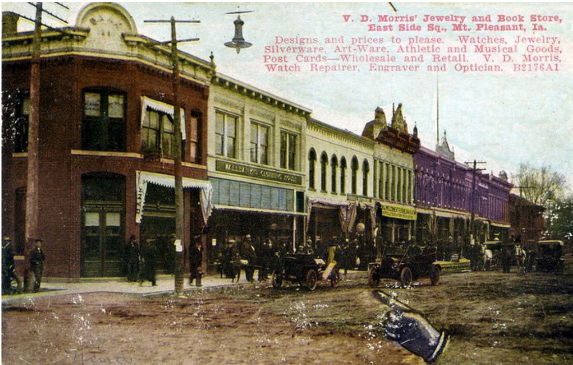
East side of the square around 1912, with Wallbank store next to bank at corner.