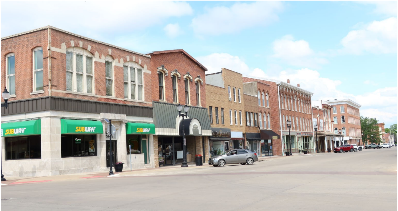
Photograph 44-02280-015. North side of 100 block of W. Monroe St (DT-65-73), looking northeast