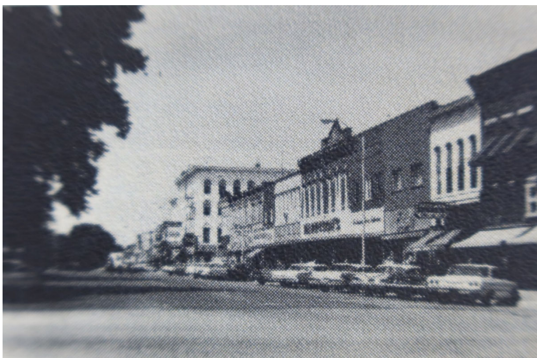
East side of the square (100 block of S. Main St) around 1965 (Shafer 1967: 41).