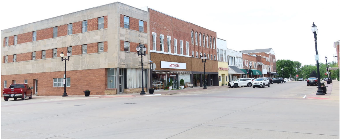
Photograph 44-02280-009. West side of 100 block of N. Jefferson St (DT-36-48), looking northwest