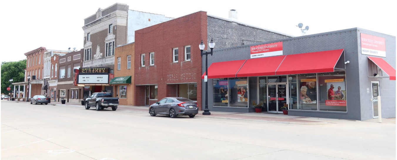
Photograph 44-02280-018. West side of 100 block of N. Jefferson St (DT-74-80), looking southwest