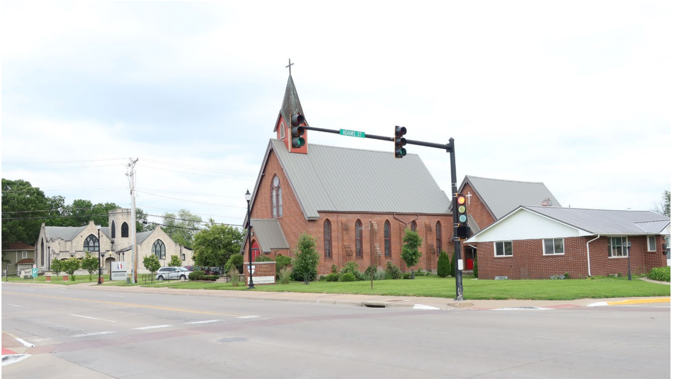
Photograph 44-02280-033. South side of 200-300 block of E. Washington St (DT-133-130), looking southeast