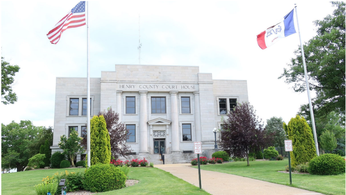
Photograph 44-02280-031. South side of 100 block of E. Washington St (DT-122), looking south