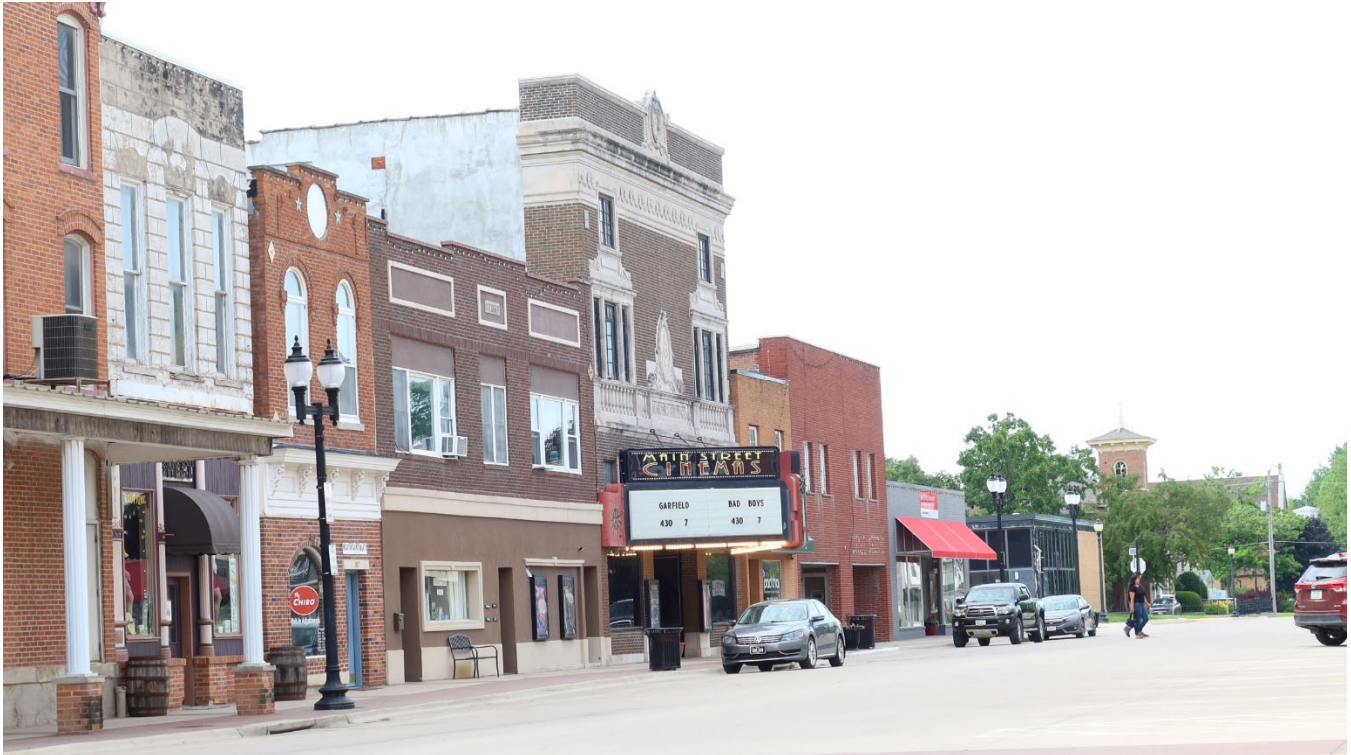
Photograph 44-02280-017. West side of 100 block of N. Jefferson St (DT-74-80), looking northwest