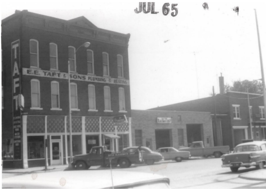
North side of 200 block of E. Monroe St in July 1965, looking northeast (HCHT collection).