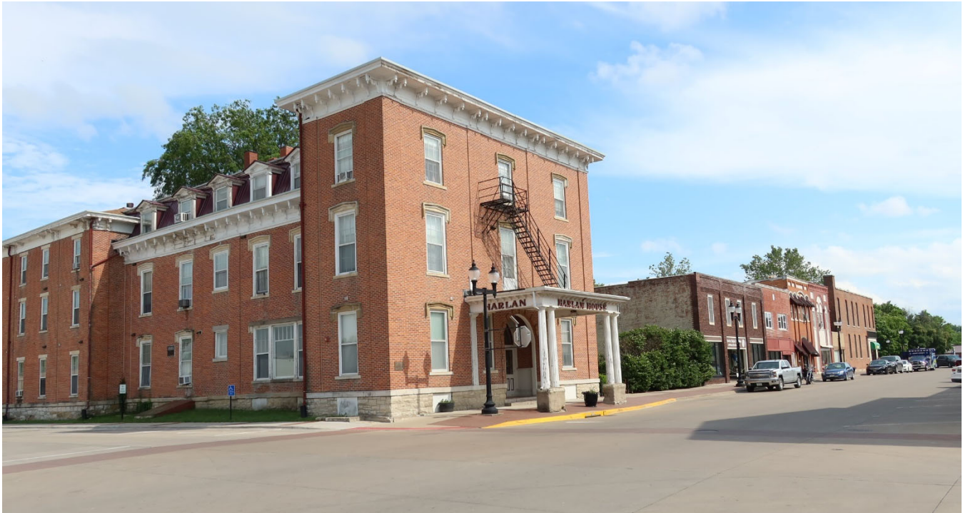
Photograph 44-02280-013. East side of 100 block of N. Jefferson St (DT-60-65), looking southeast