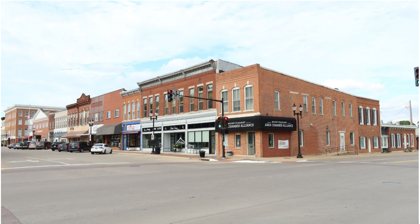
Photograph 44-02280-029. East side of 100 block of S. Main St (DT-110-120), looking northeast