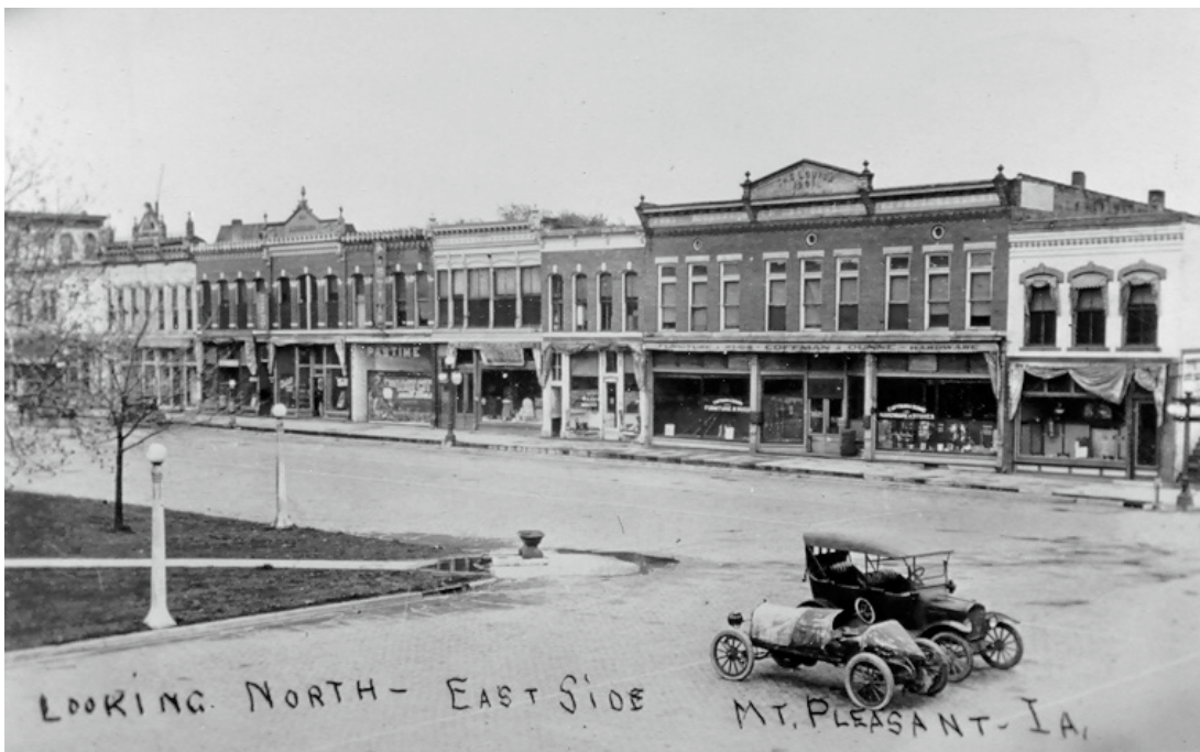
East side of the square in the 1910s, with Louisa Building at right/south end (HCHT collection).