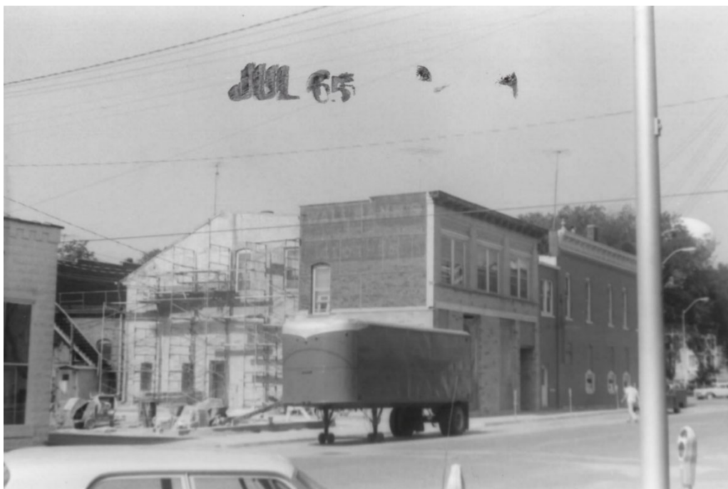
South side of 100 block of E. Monroe St in July 1965, looking southwest.