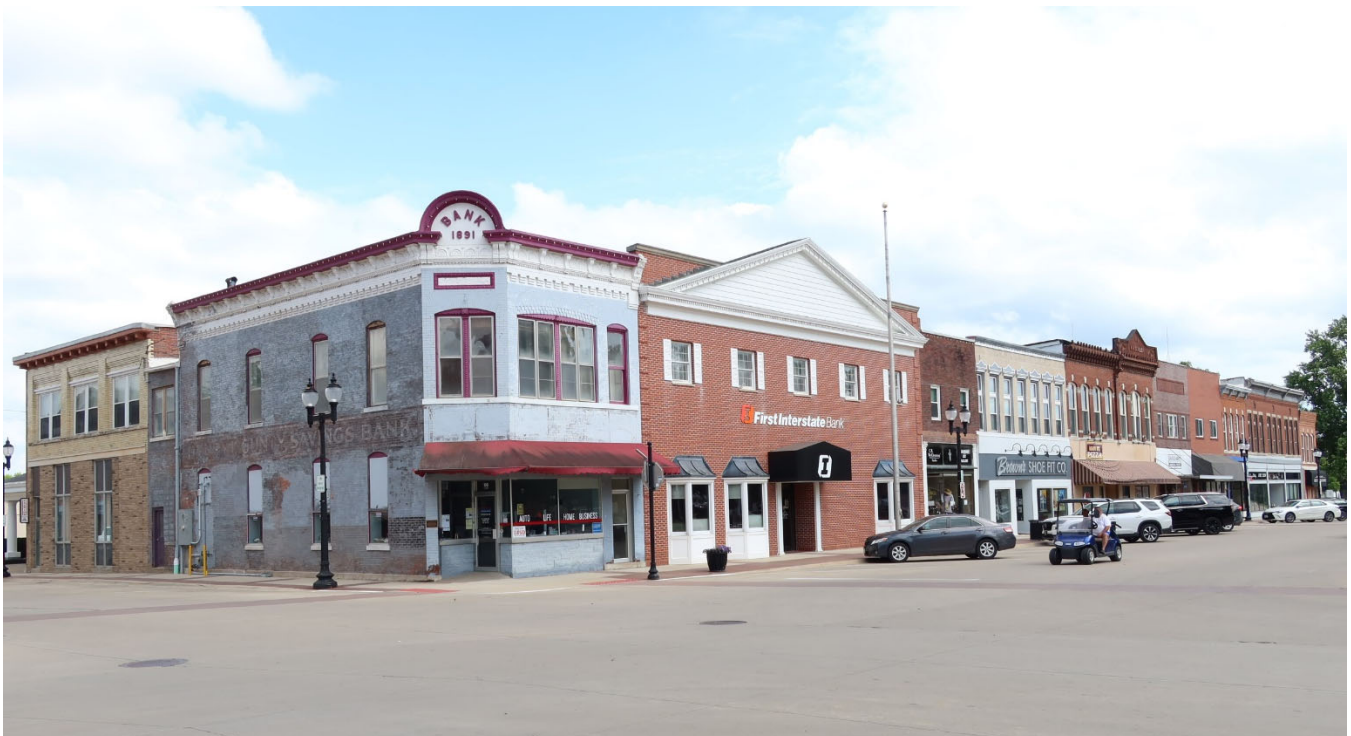
Photograph 44-02280-028. East side of 100 block of S. Main St (DT-110-120), looking southeast