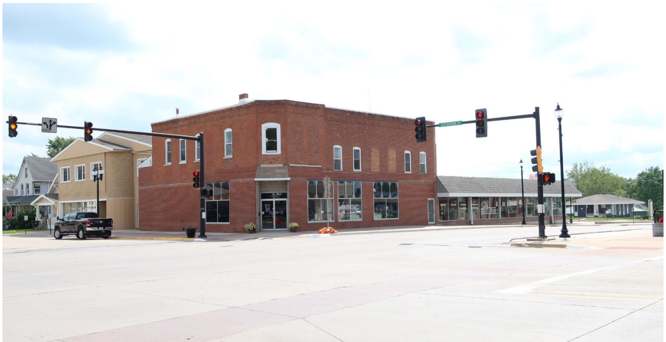
Photograph 44-02280-003. W. Washington St and S. Jefferson St (DT-7-11), looking southwest