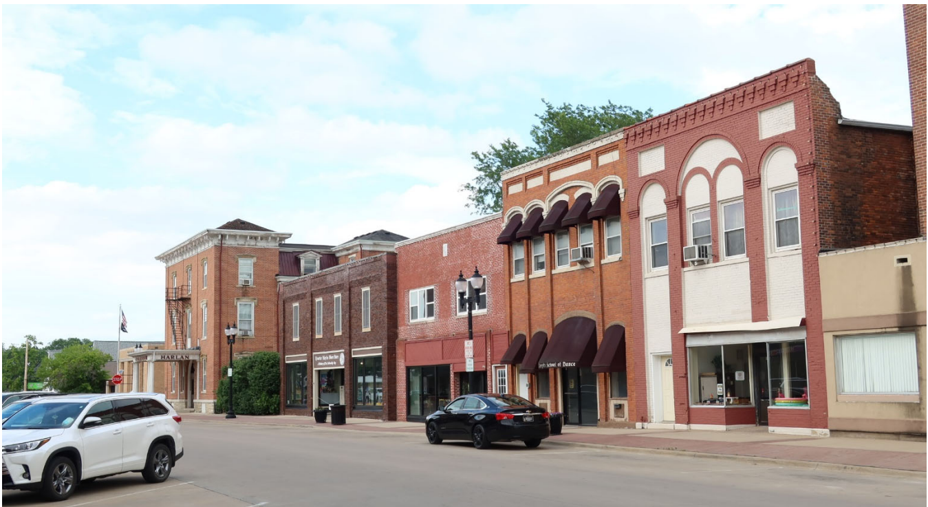
Photograph 44-02280-014. East side of 100 block of N. Jefferson St (DT-60-65), looking northeast