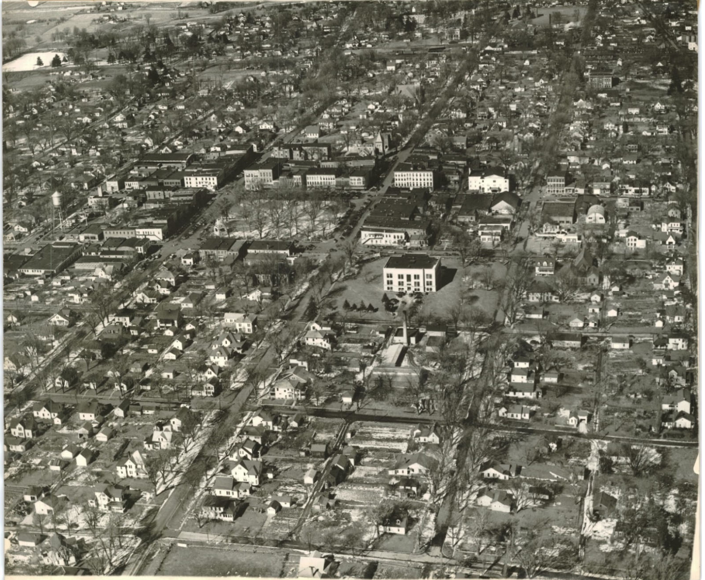
Aerial photograph of Mt Pleasant in spring 1947, looking north.