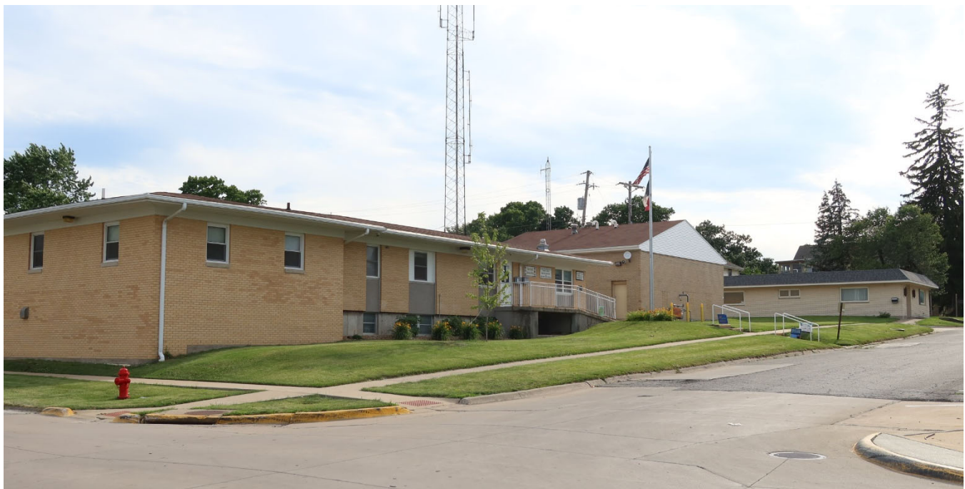
Photograph 44-02280-032. South side of 100 block of E. Clay St (DT-137-139), looking southwest