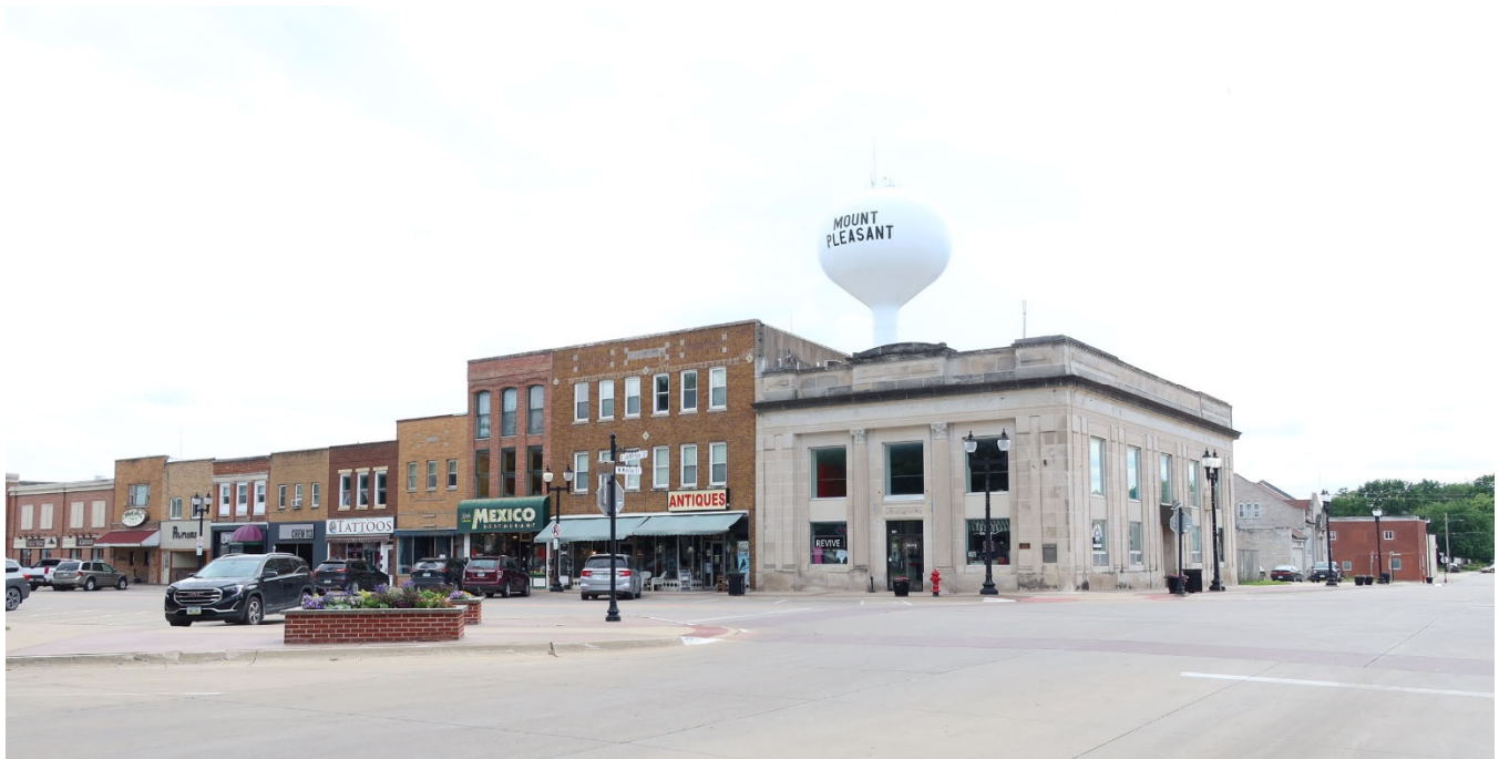
Photograph 44-02280-006. S. Jefferson St and W. Monroe St (DT-18-28), looking southwest