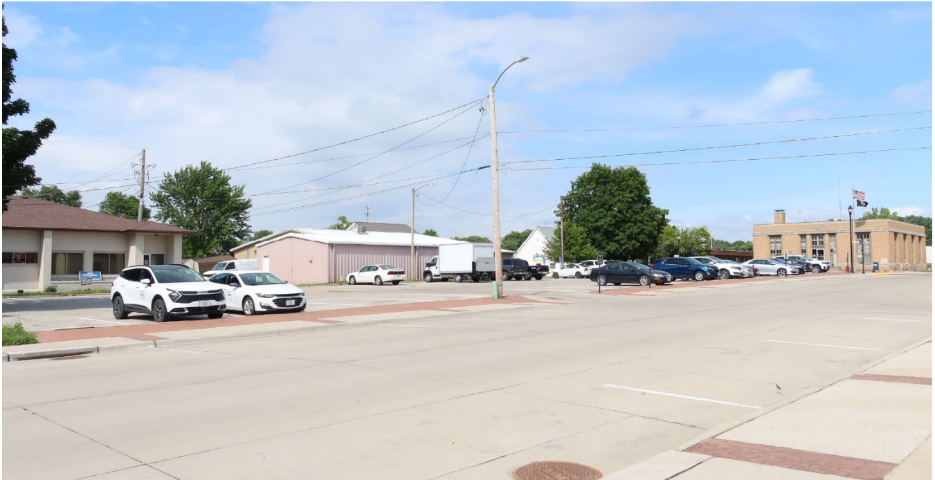
Photograph 44-02280-011. North side of 100 block of W. Madison St (DT-51-52-142-59), looking northeast