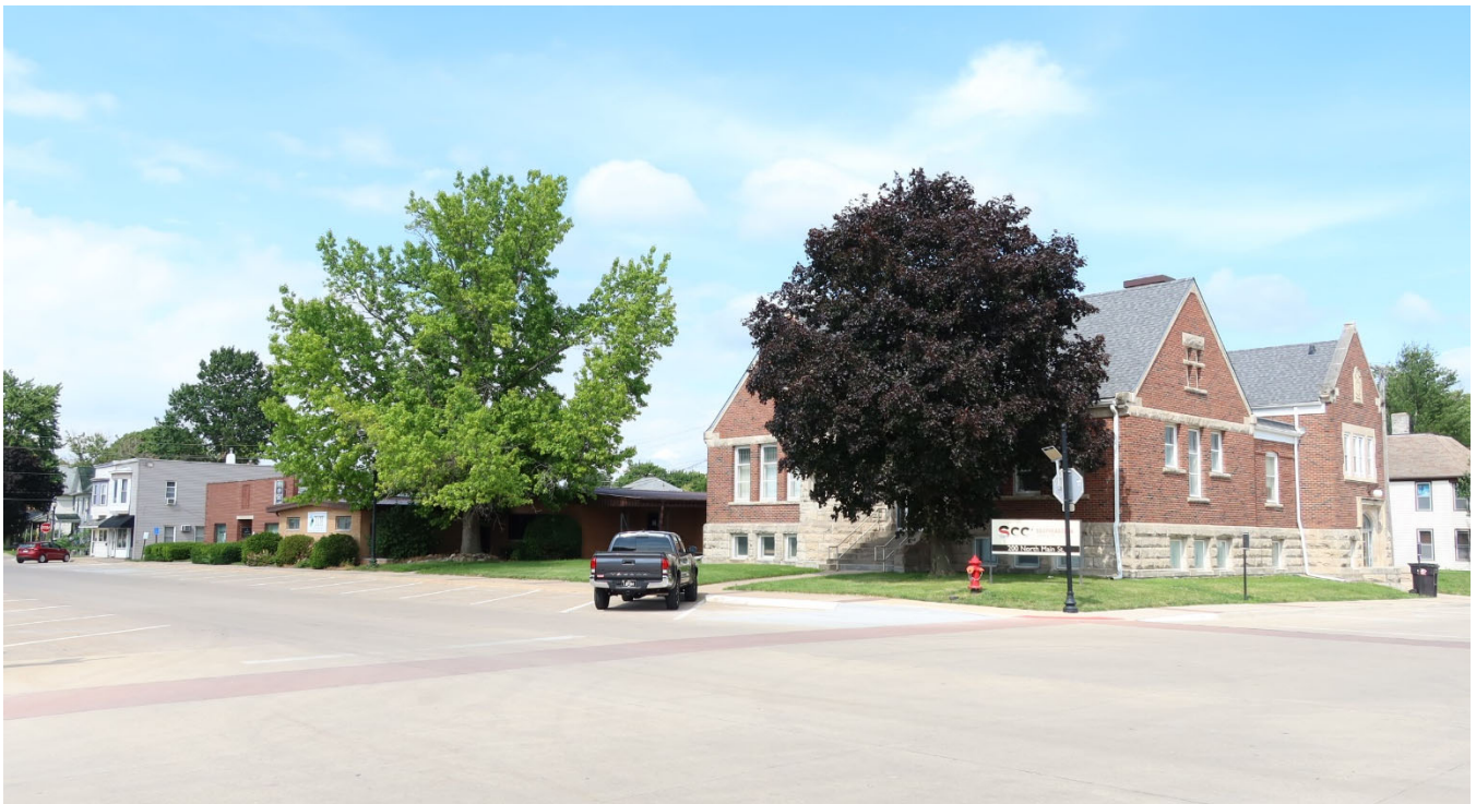
Photograph 44-02280-020. East side of 200 block of N. Jefferson St (DT-84-89), looking northeast