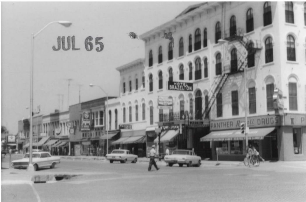
East side of 100 block of N. Main St in July 1965, looking northeast.