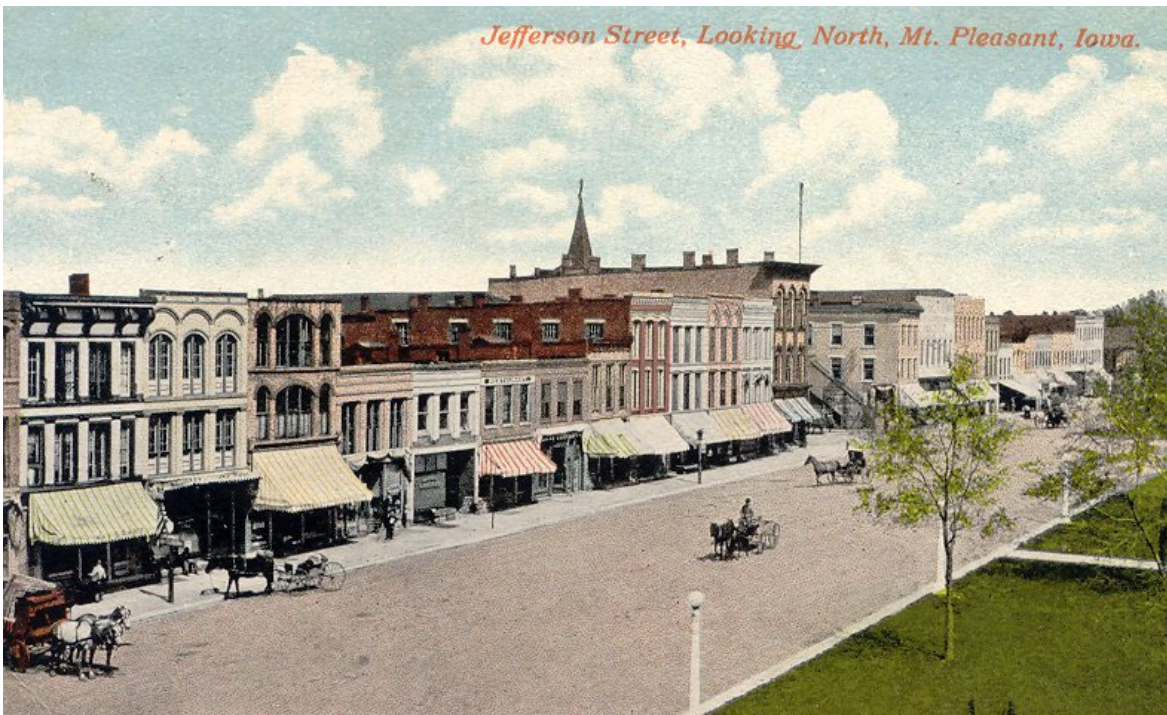
West side of square (Jefferson St), looking northwest from near Washington St.