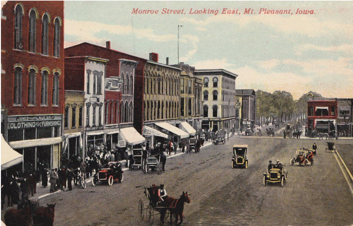
North side of square (Monroe St), looking east from near Jefferson St.