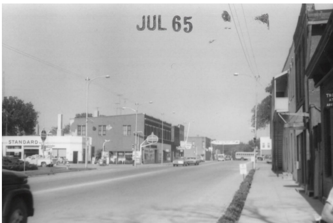
South side of 100 block of W. Washington St in July 1965, looking west.