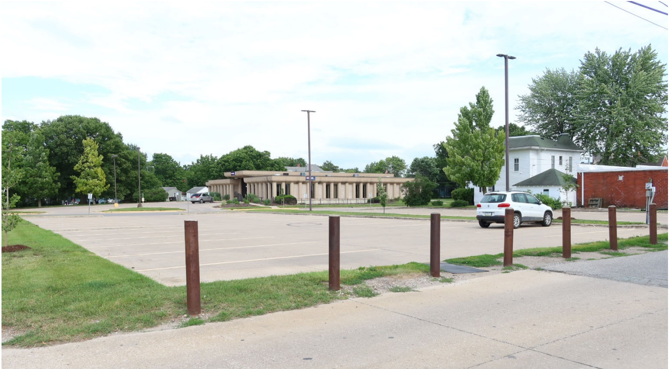
Photograph 44-02280-025. South side of 200-300 block of E. Monroe St (DT-129-108-128), looking southeast