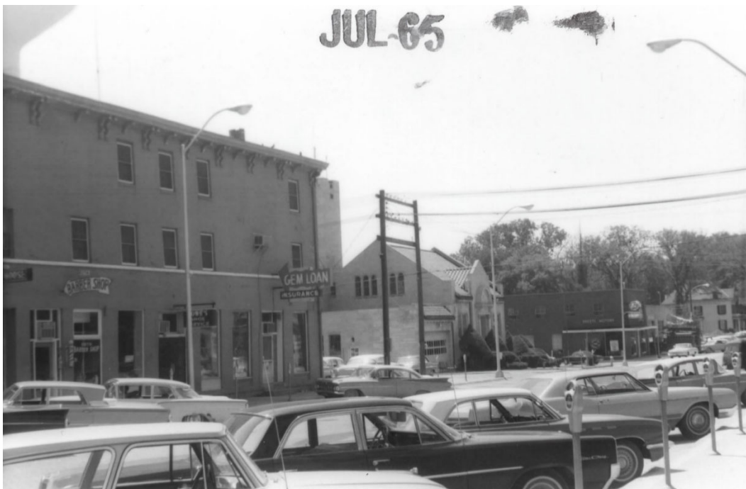
South side of 200 block of W. Monroe St in July 1965, looking southwest.