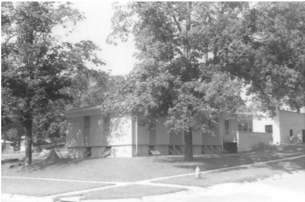
South side of 100 block of E. Clay St in July 1965, looking southwest at Sheriff's residence and county jail.