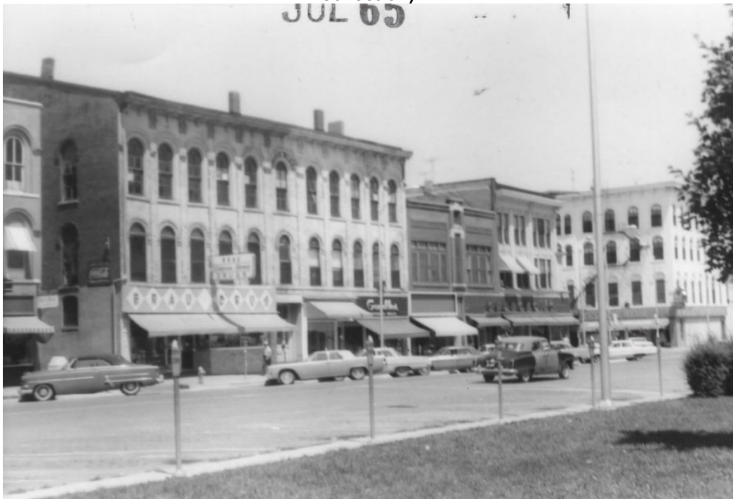
West half of north side of square (100 block of W. Monroe St) in July 1965, looking northeast.