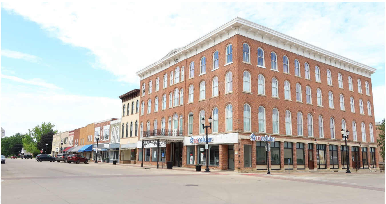
Photograph 44-02280-022. East side of 100 block of N. Main St (DT-91-101), looking northeast