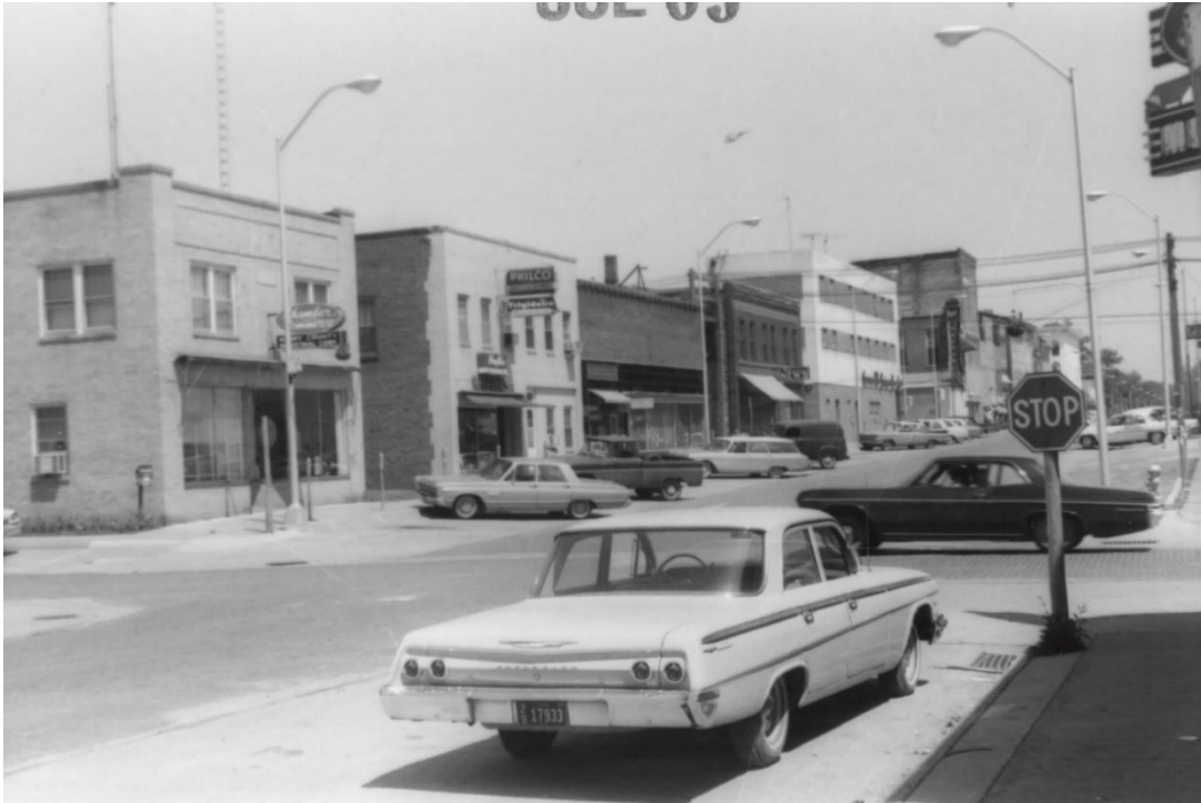
North side of 200 block of W. Monroe St in July 1965, looking northeast.