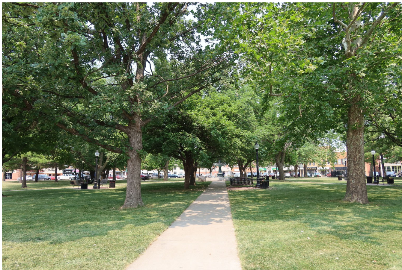
Photograph 44-02280-001. Central Park (DT-001), looking northwest (June 2024).