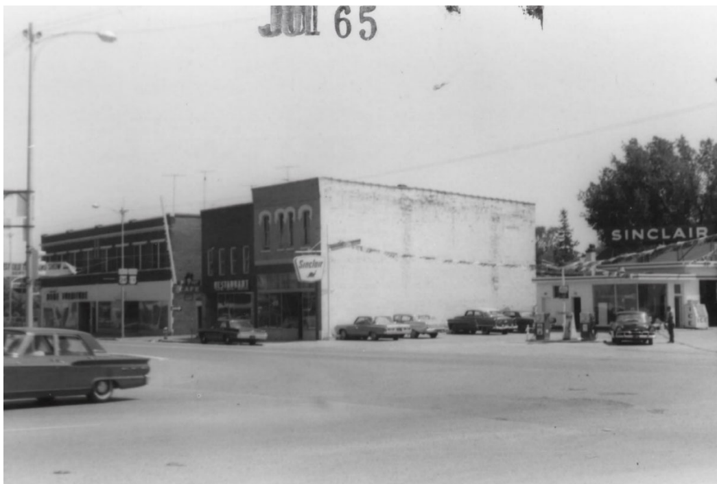
South side of 100 block of W. Washington St in July 1965, looking southeast.