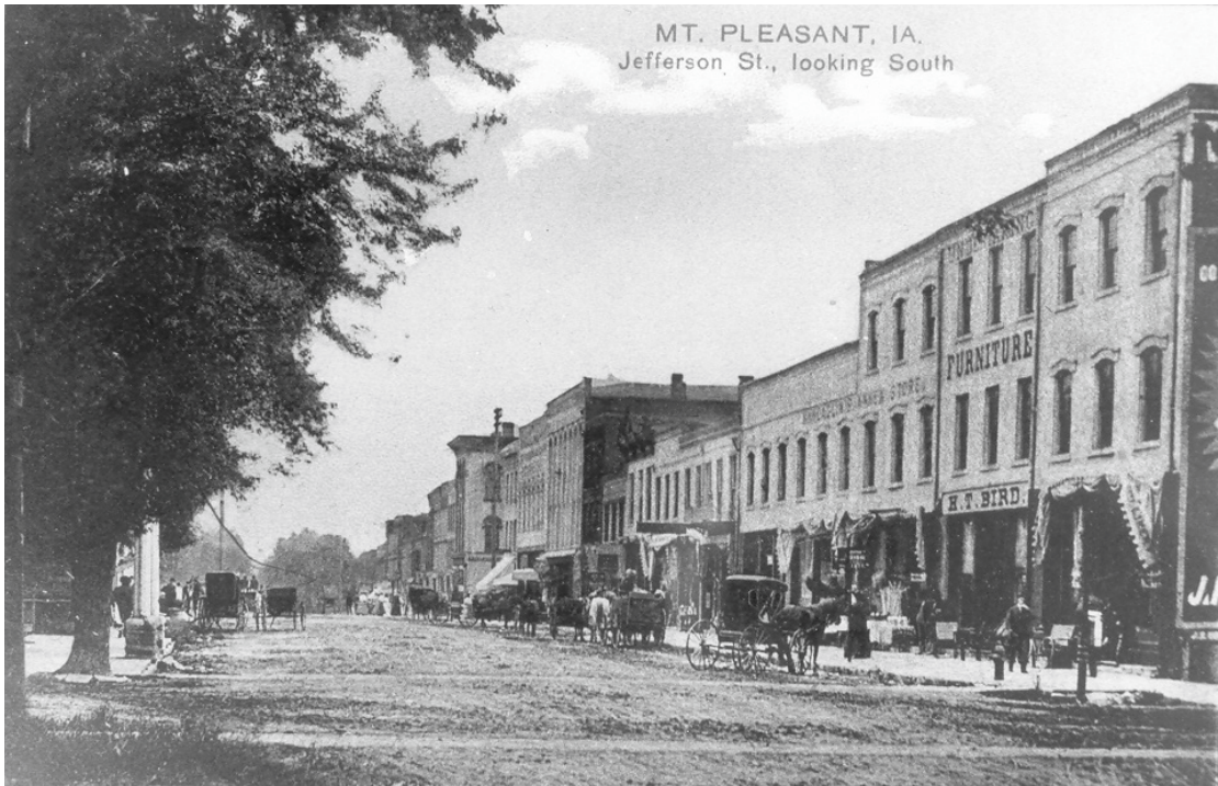
West side of 100 block of N. Jefferson in early 1900s with 1850s buildings on south half of block and 1866-69 buildings on north (right) half of block, looking southwest (HCHT collection).