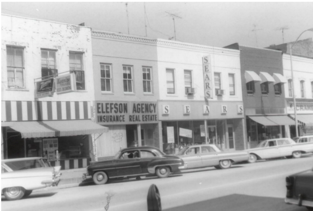
Middle of 100 block of N. Jefferson St in July 1965, looking northwest.