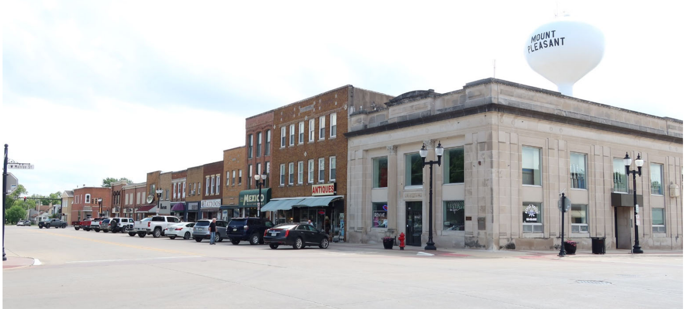
Photograph 44-02280-005. West side of 100 block of S. Jefferson St (DT-17-26), looking southwest