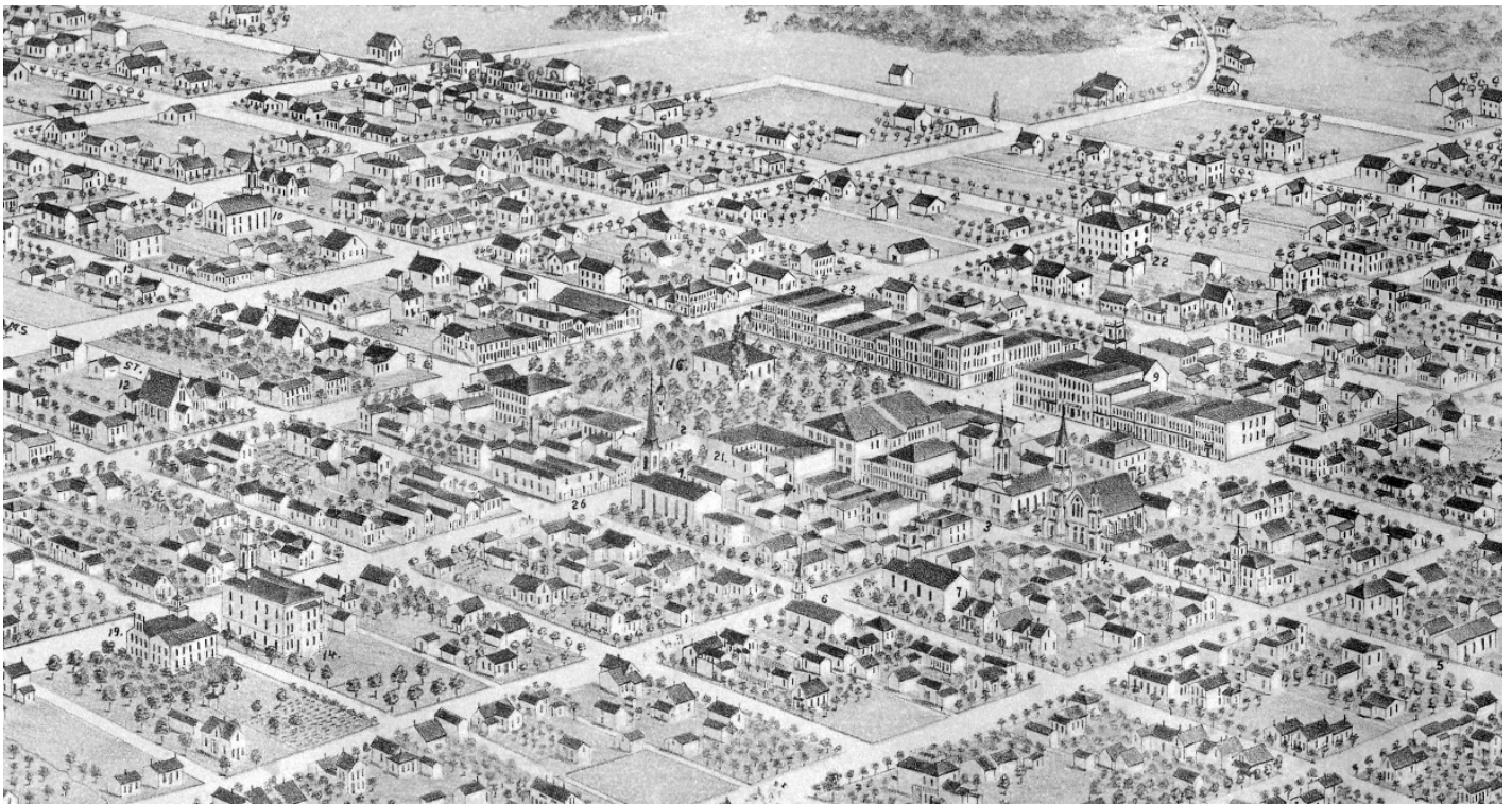
Downtown on the 1869 Birds-Eye View , looking southwest (Koch 1869).

Numerous additional historic photographs are included in the survey report and Iowa Site Inventory forms for the individual properties in the historic district