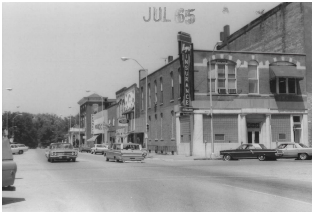
East side of 100 block of N. Jefferson St in July 1965, looking northeast with Hayes building at 125 W. Monroe St at the corner.