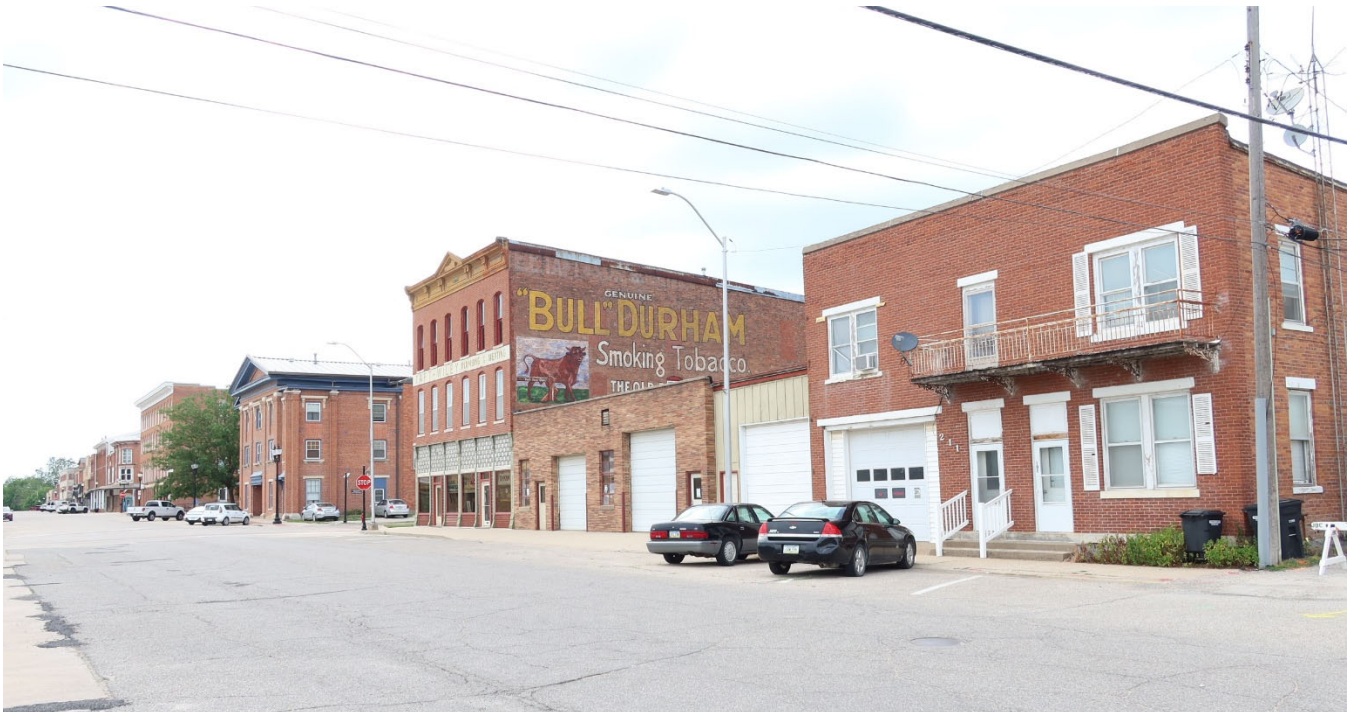
Photograph 44-02280-024. North side of 100-200 block of E. Monroe St (DT-102-106), looking northwest