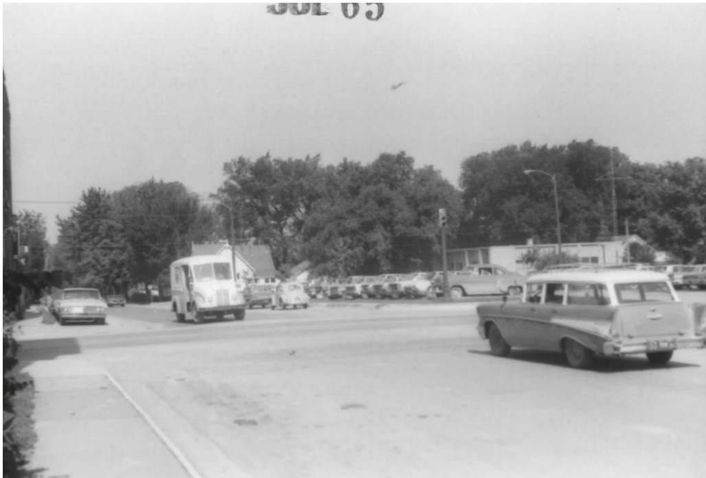
City parking lot at the northwest corner of N. Jefferson and W. Madison St in July 1965, looking northwest with Couchman Clinic in background.