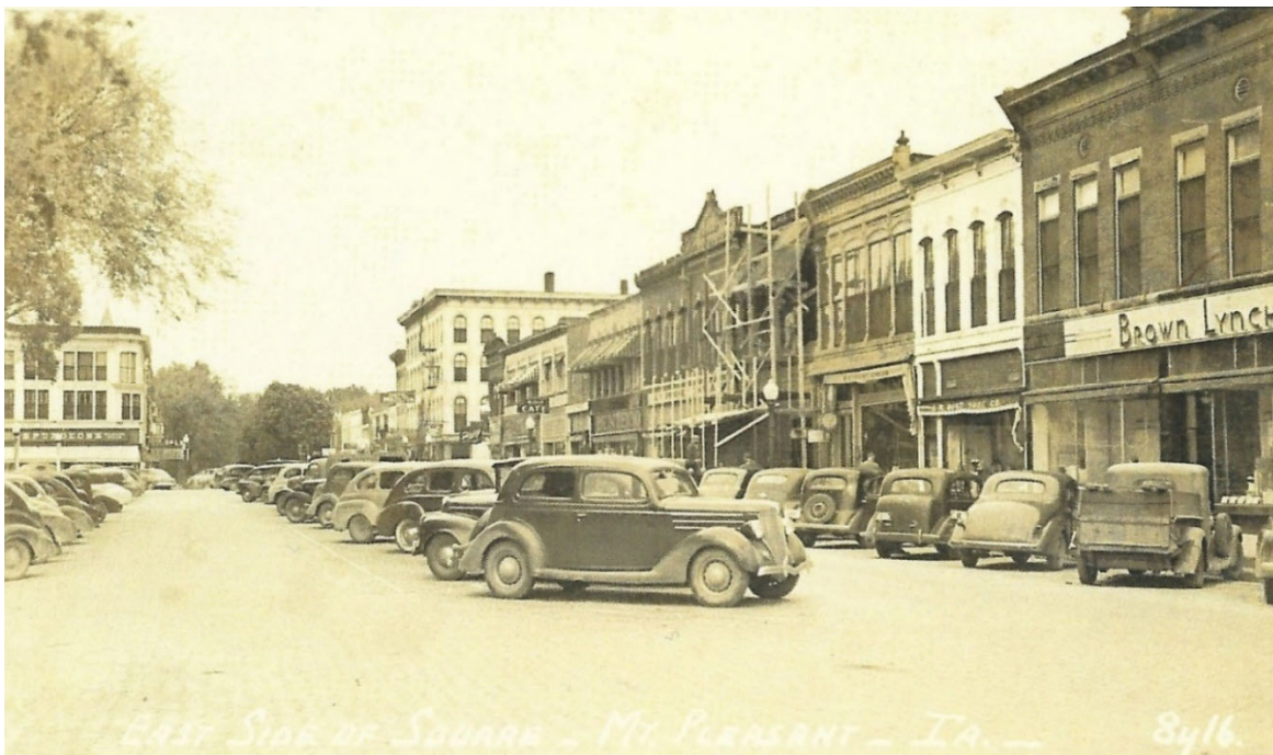
100 block of S. Main St (east side of square) in 1946 during façade remodel on building occupied by Mt Pleasant Fruit Supply (HCHT collection).