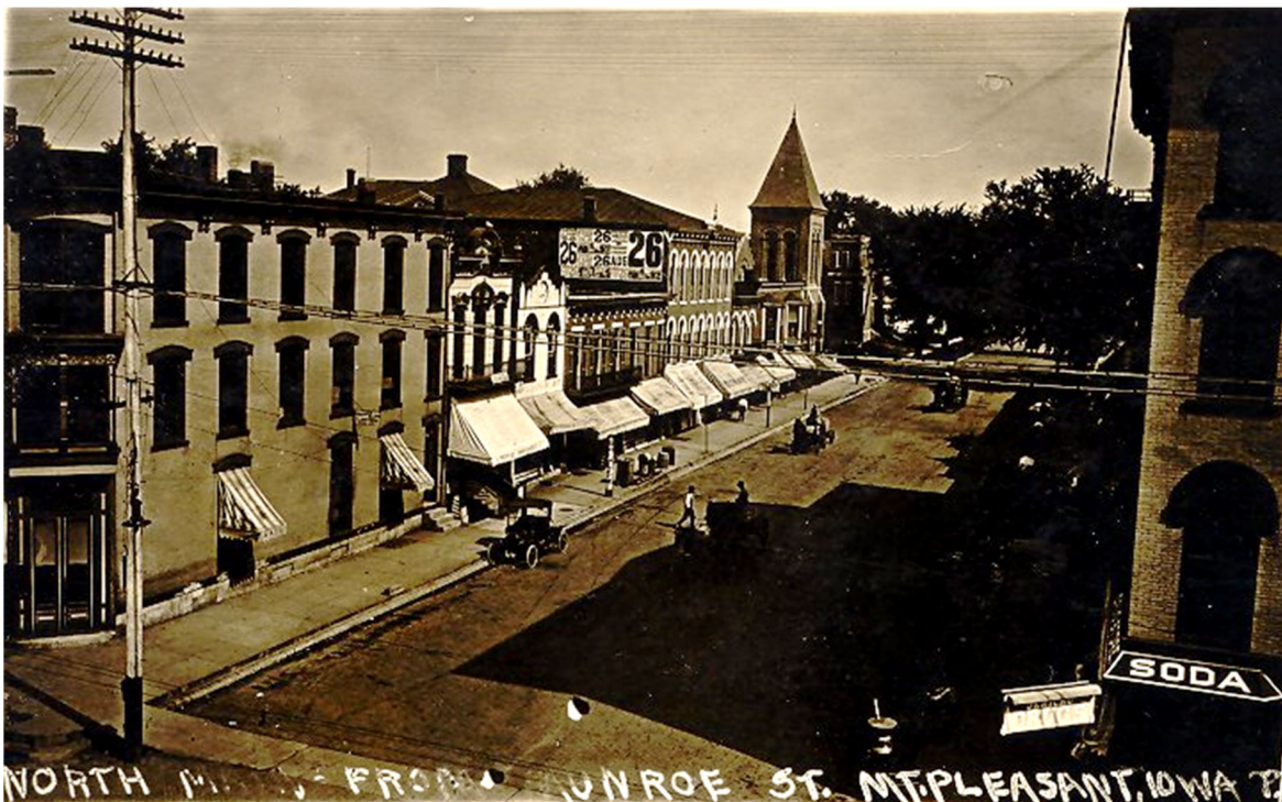
West side of 100 block of N. Main St, looking northwest from Monroe St.