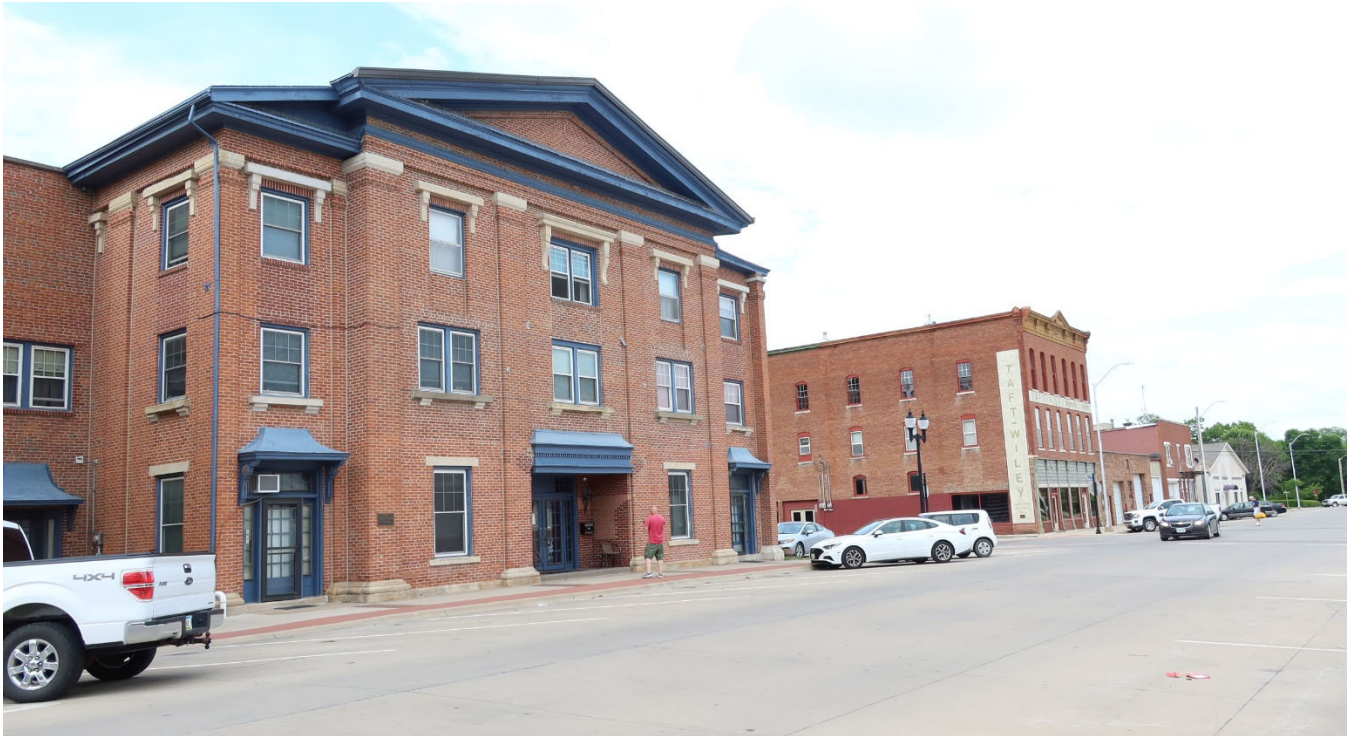
Photograph 44-02280-023. North side of 100-200 block of E. Monroe St (DT-102-106), looking northeast