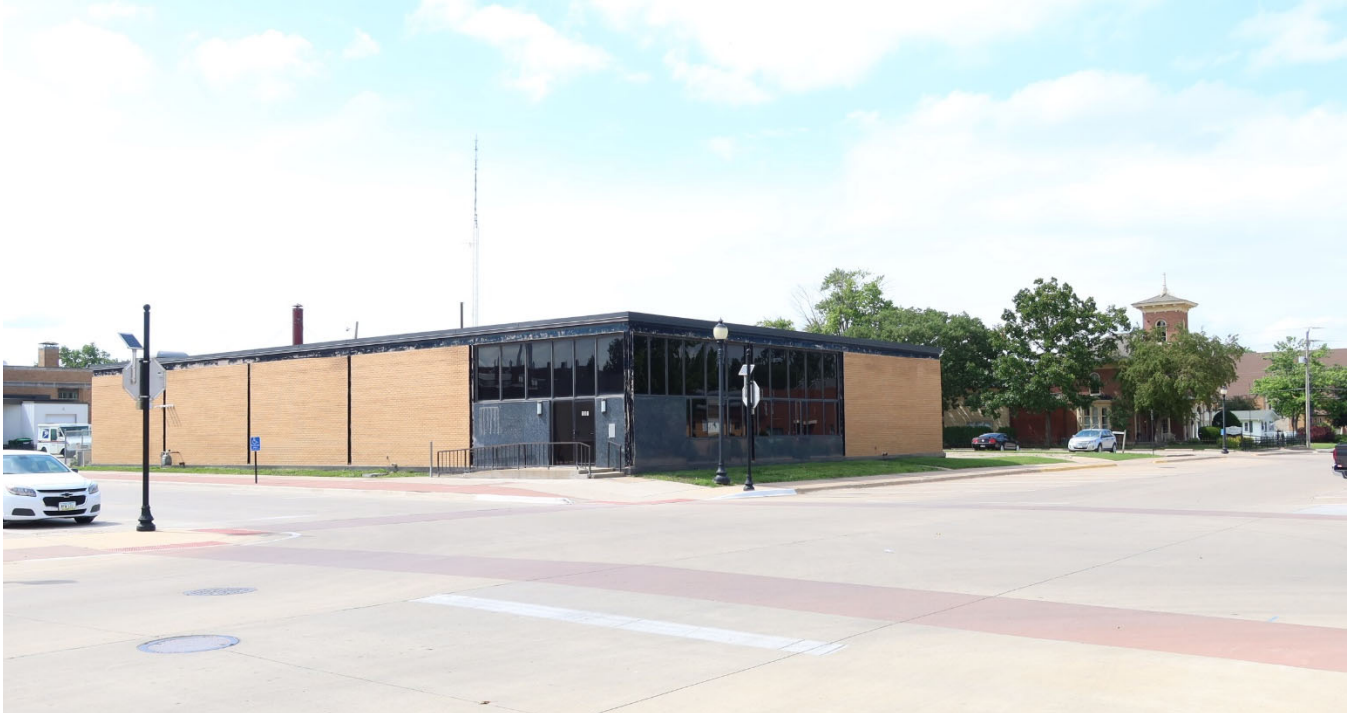
Photograph 44-02280-019. West side of 200 block of N. Jefferson St (DT-81-143-144-82), looking northwest