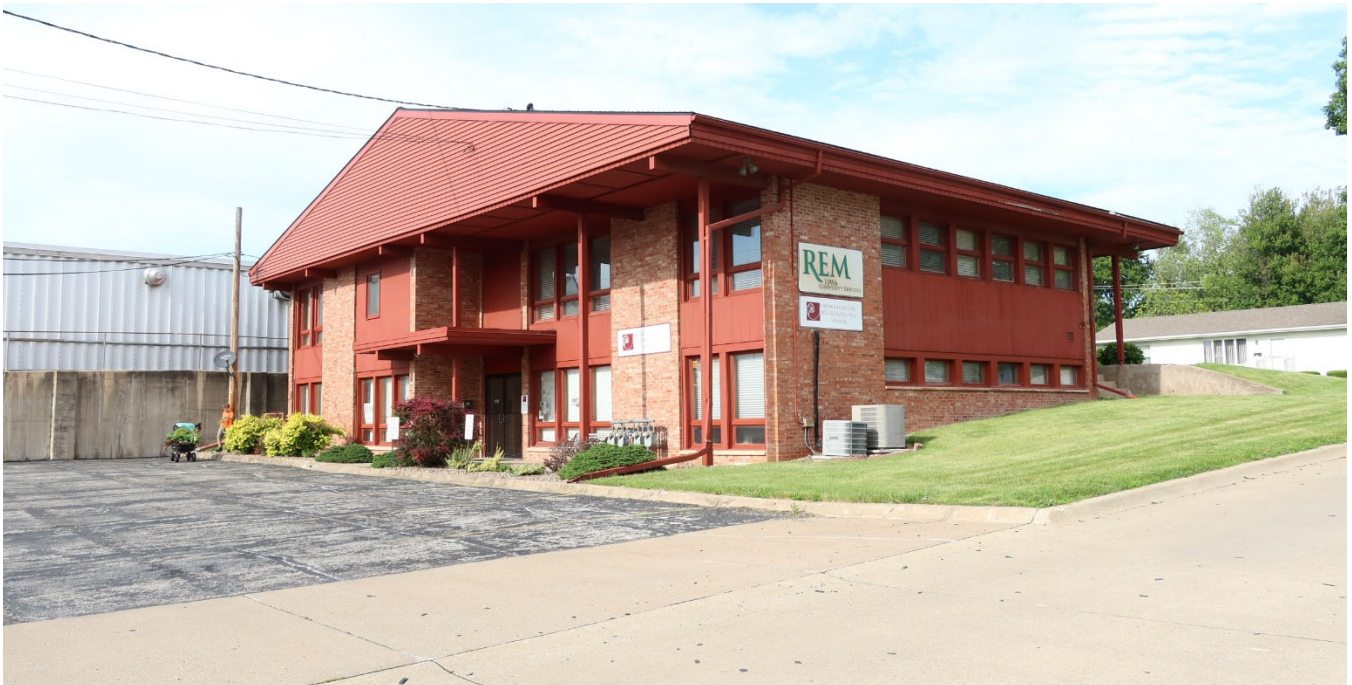
Photograph 44-02280-034. Southwest corner of S. Harrison and E. Clay St (DT-134), looking northeast