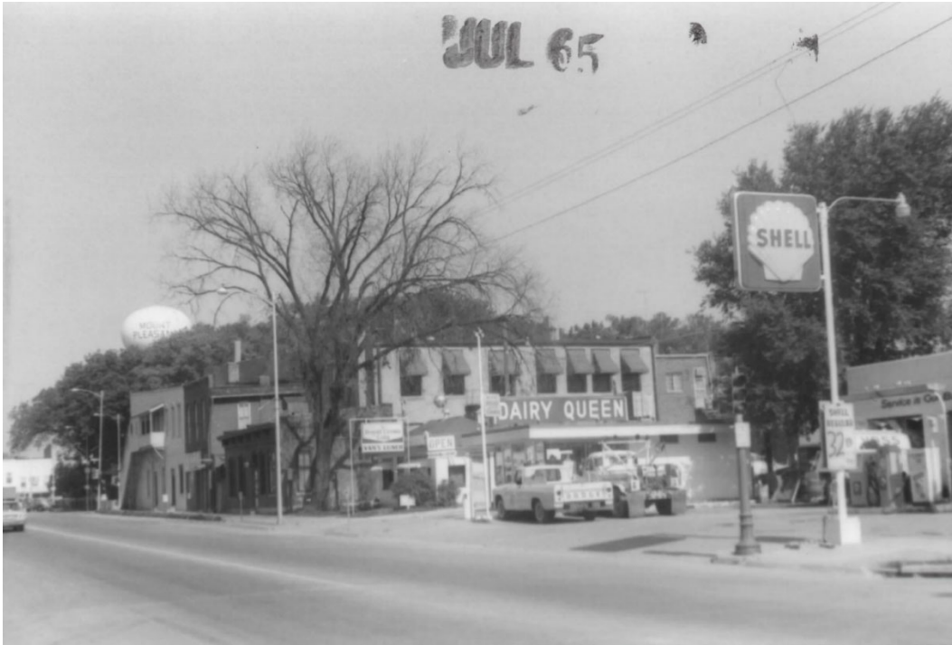
North side of 100 block of E. Washington St in July 1965, looking northwest.