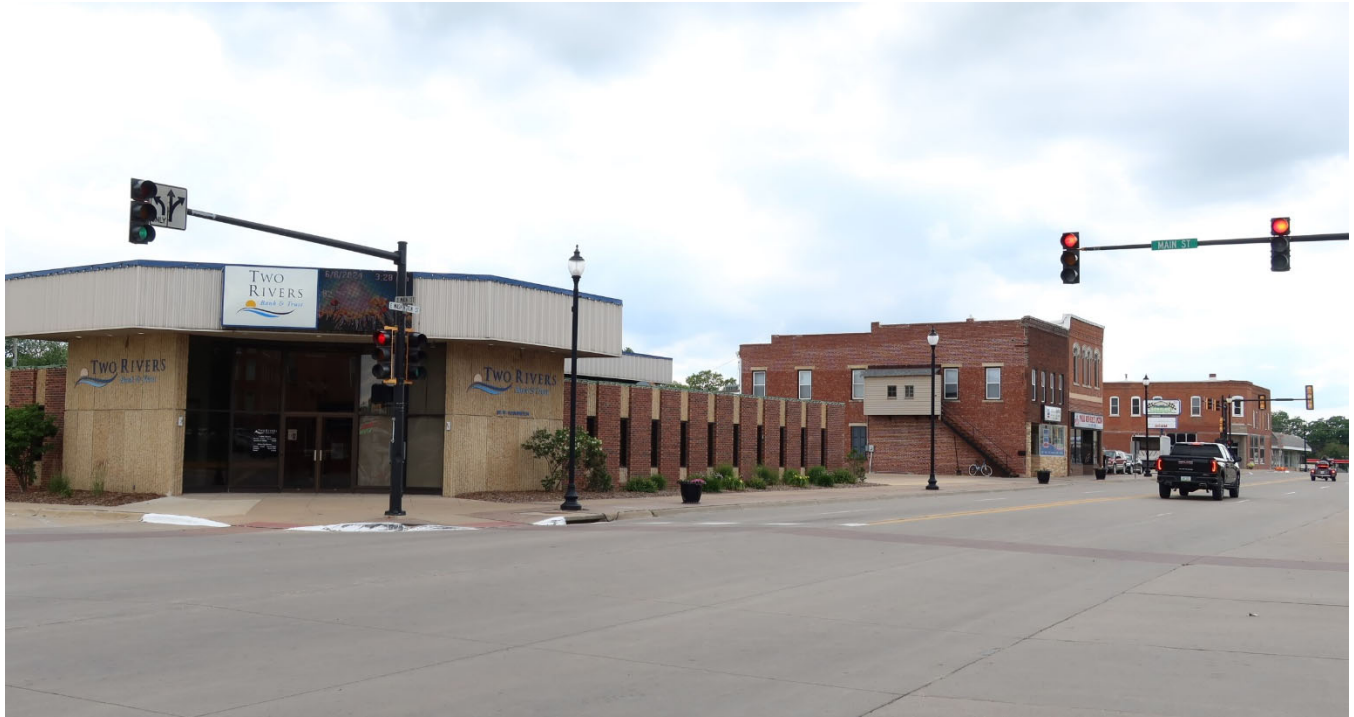
Photograph 44-02280-002. South side of 100 block of W. Washington St (DT-2-3-4), looking southwest