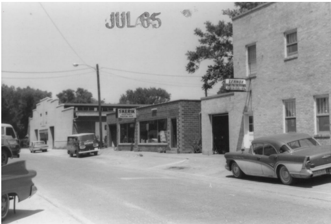
East side of 100 block of N. Jackson St in July 1965, looking northeast.