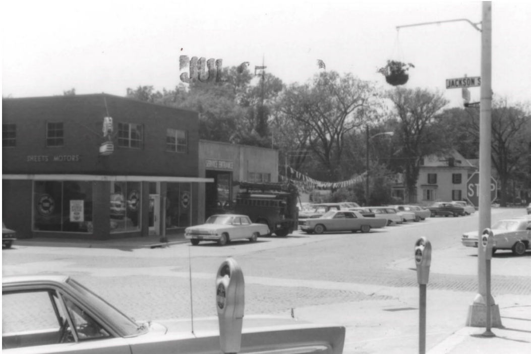
South side of 300 block of W. Monroe St in July 1965, looking southwest.