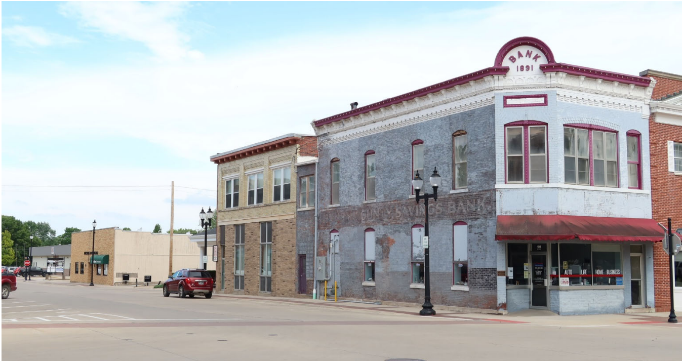
Photograph 44-02280-027. South side of 100 block of E. Monroe St (DT-109-111), looking southeast