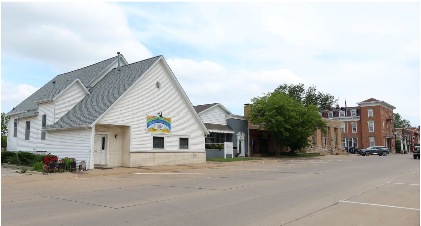
Photograph 44-02280-012. East side of 200 block of N. Jefferson St (DT-56-60), looking southeast