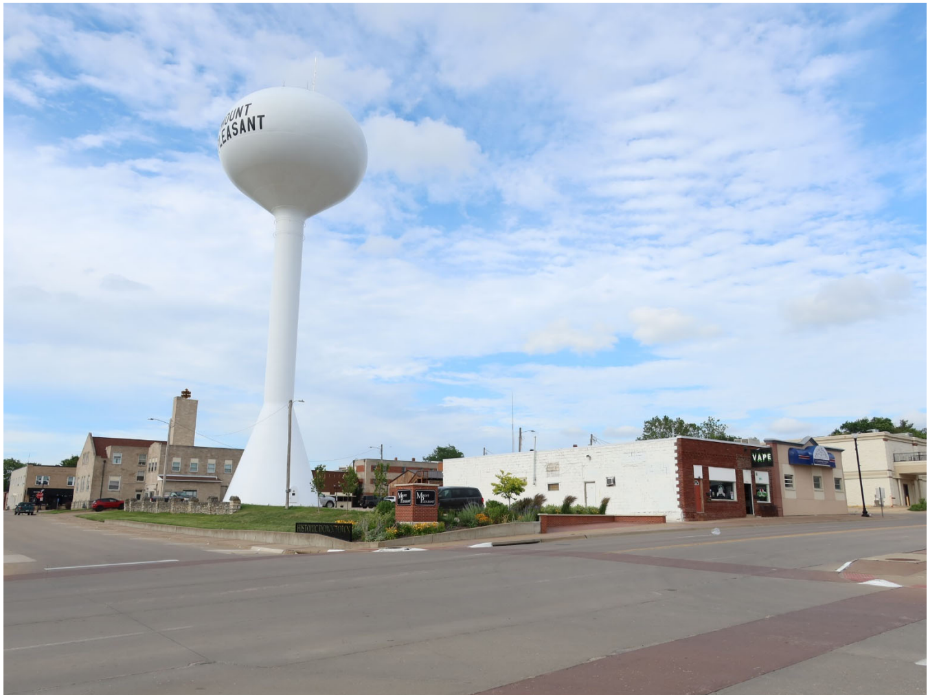
Photograph 44-02280-004. North side of 200 block of W. Washington St (DT-27-15-16), looking northeast