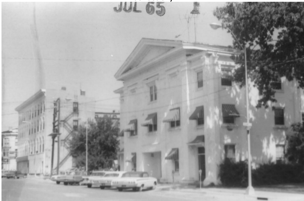
North side of 100 block of E. Monroe St in July 1965, looking northwest.