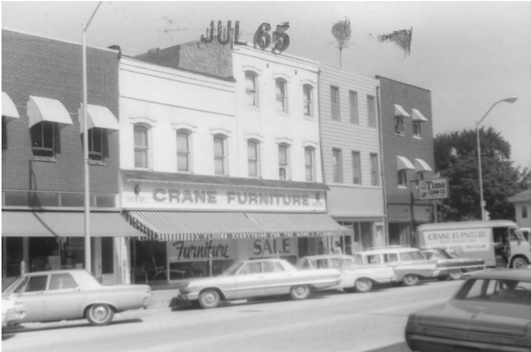
North end of 100 block of N. Jefferson St in July 1965, looking northwest.