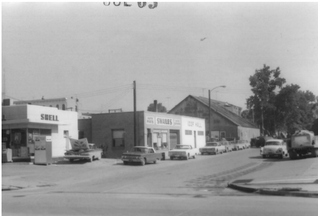
West side of 100 block of S. Adams St in July 1965, looking northwest.