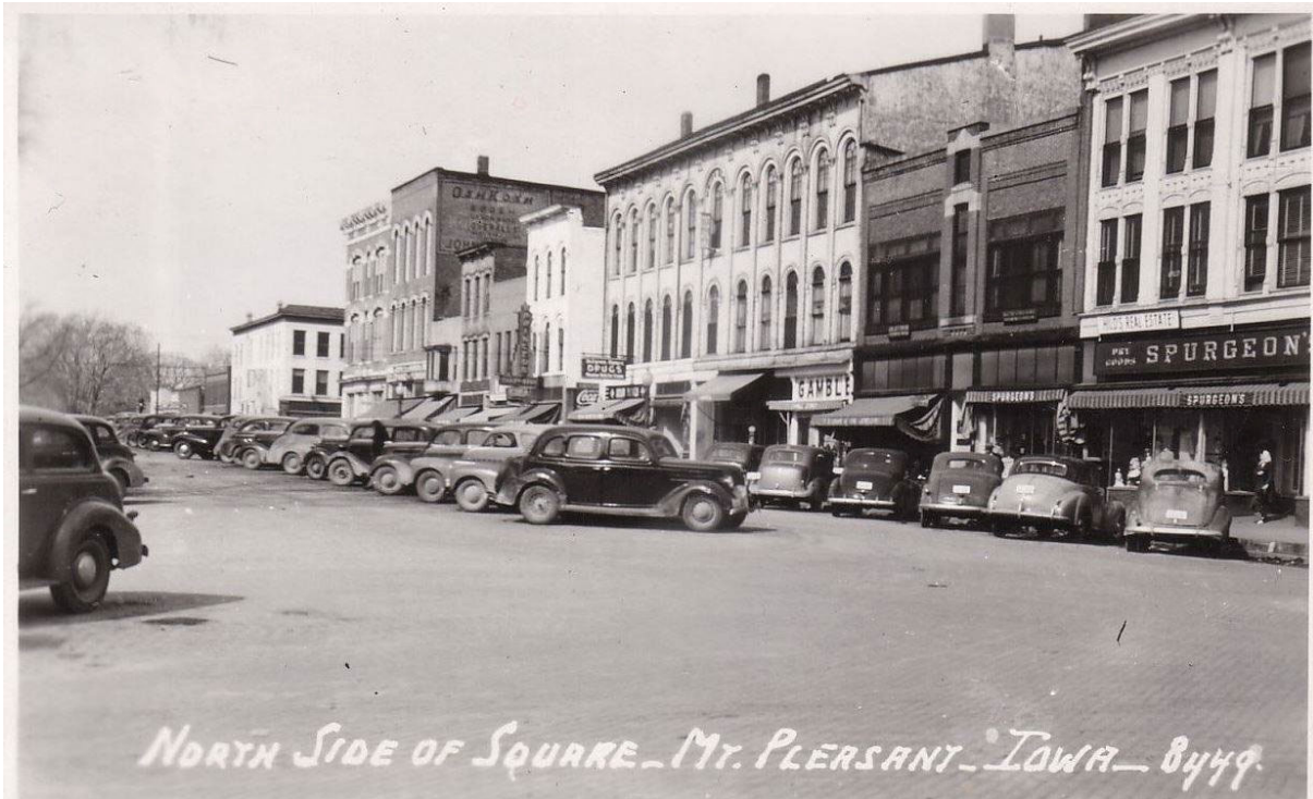
North side of square (100 block W. Monroe St) in early 1940s (HCHT collection).