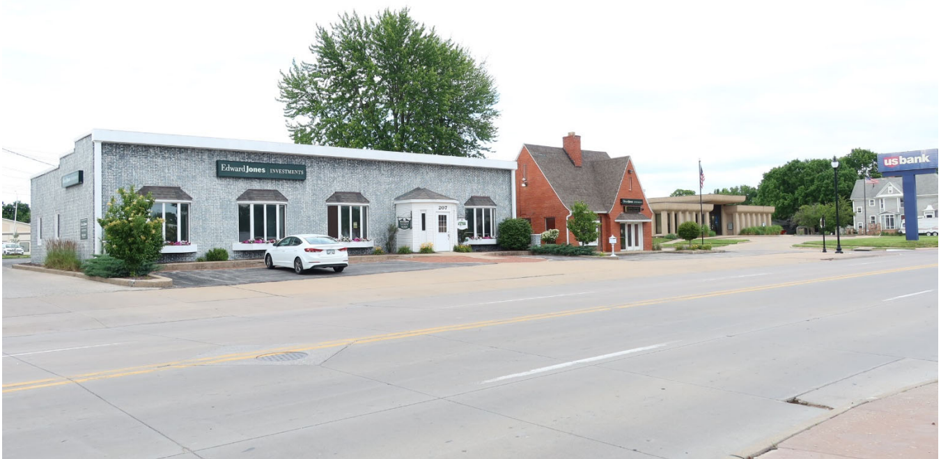
Photograph 44-02280-030. North side of 200-300 block of E. Washington St (DT-126-129), looking northeast