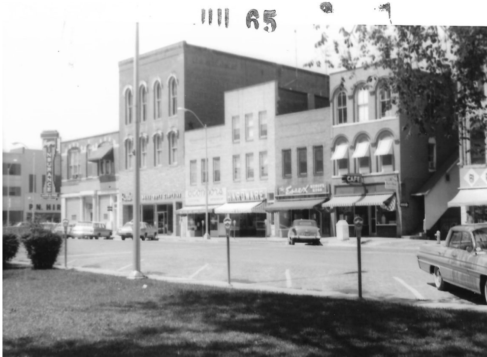
West half of north side of square (100 block of W. Monroe St) in July 1965, looking northwest (HCHT collection).