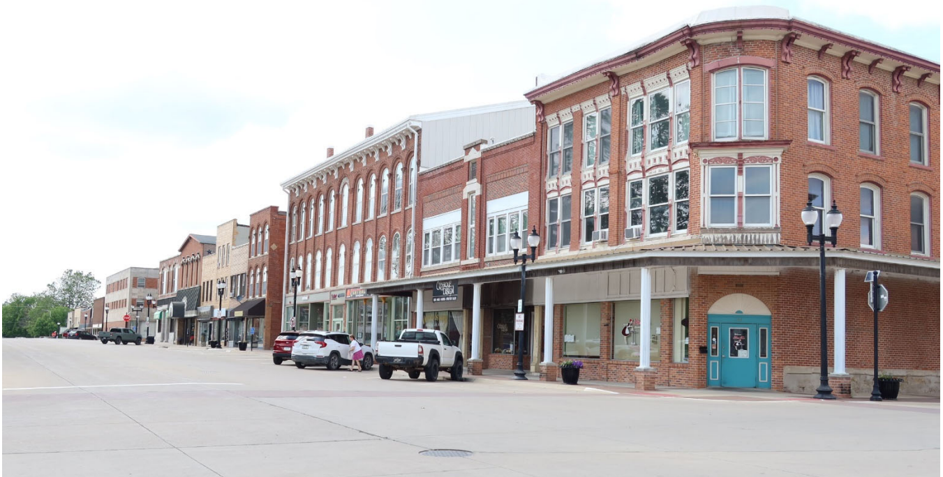
Photograph 44-02280-016. North side of 100 block of W. Monroe St (DT-65-73), looking northwest