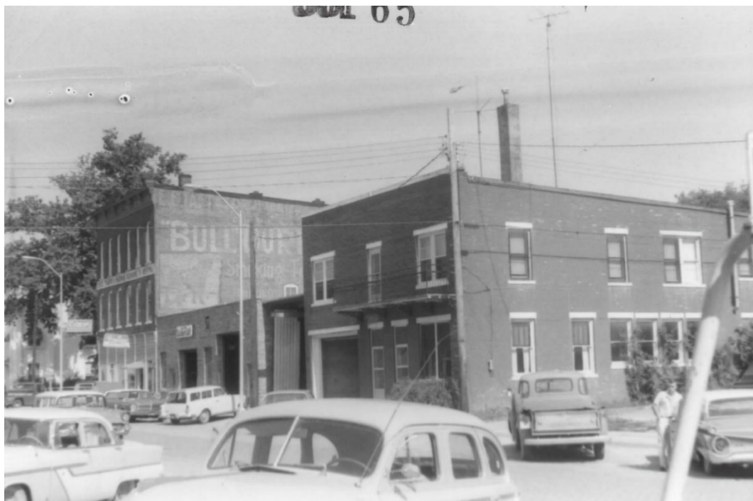
North side of 200 block of E. Monroe St in July 1965, looking northwest.