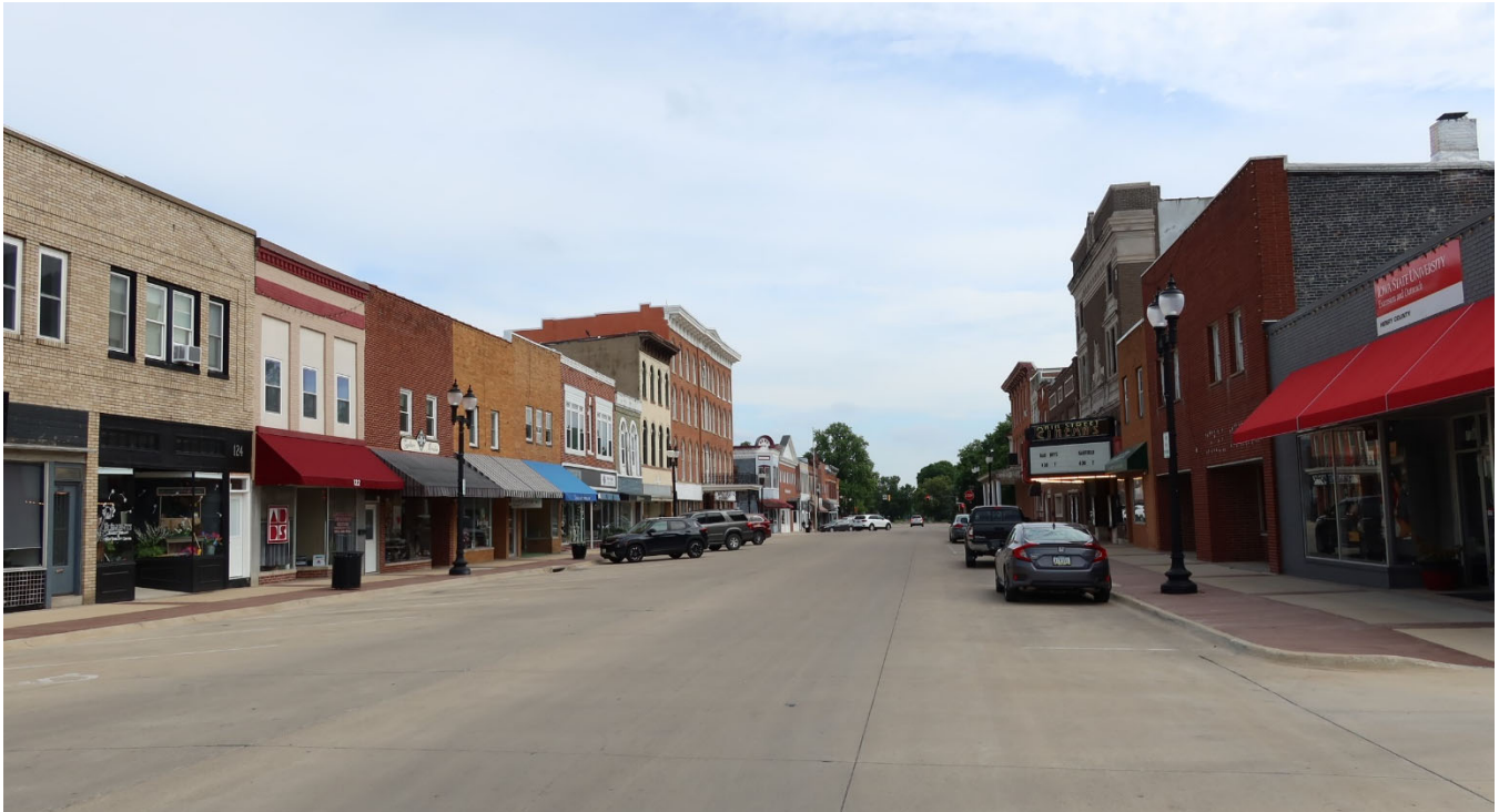
Photograph 44-02280-021. 100 block of N. Main St, looking south from Madison St