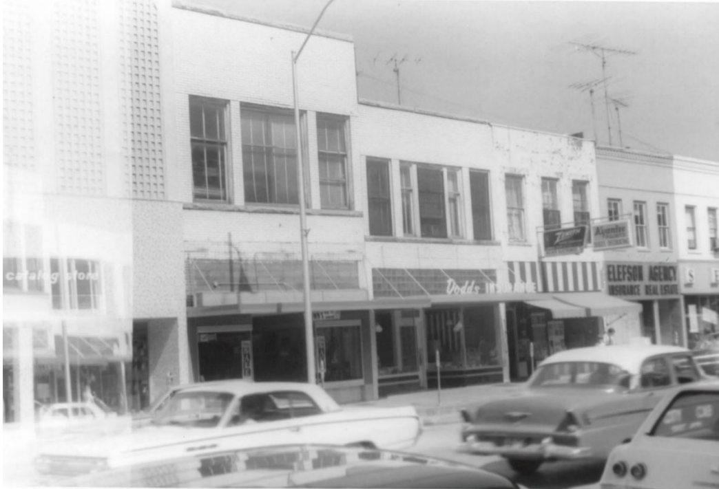
Middle of 100 block of N. Jefferson St in July 1965, looking northwest.