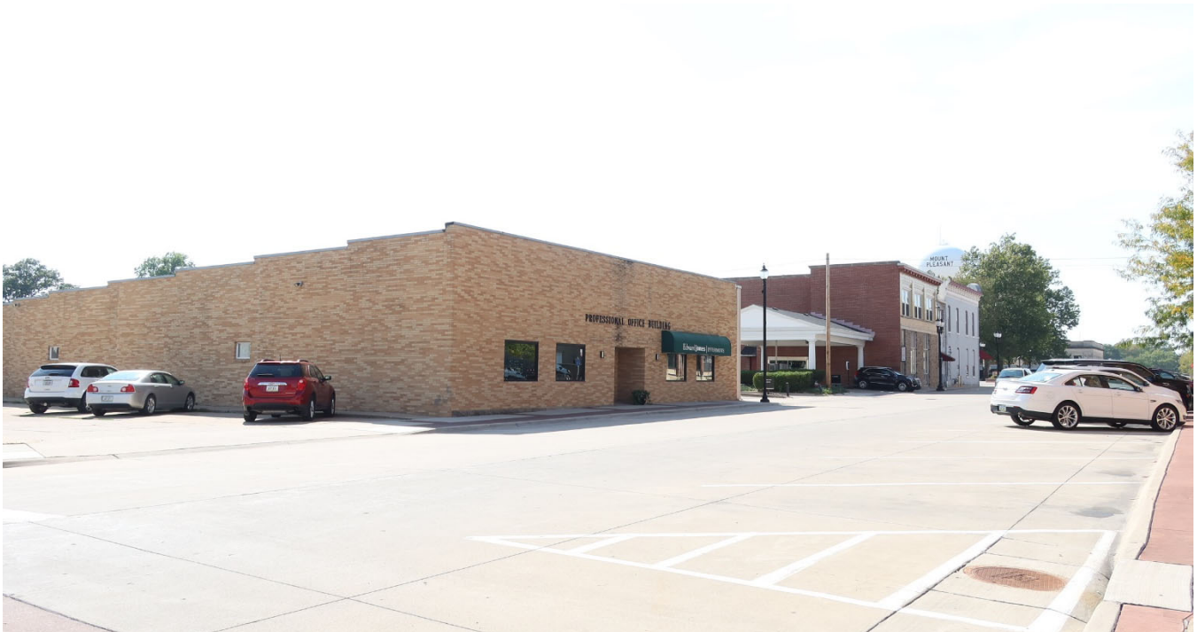
Photograph 44-02280-026. South side of 100 block of E. Monroe St (DT-109-111), looking southwest