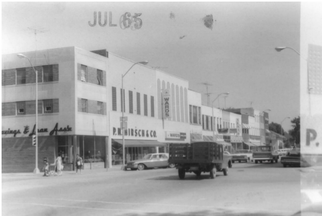
100 block of N. Jefferson St in July 1965, looking northwest.