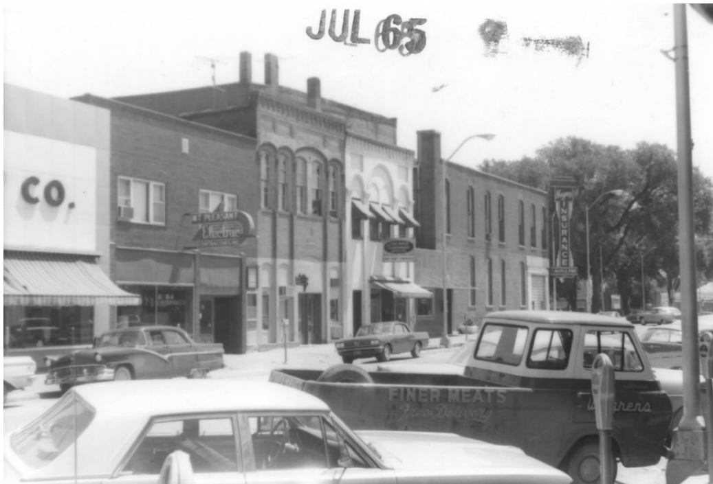
East side of 100 block of N. Jefferson St in July 1965, looking southeast.