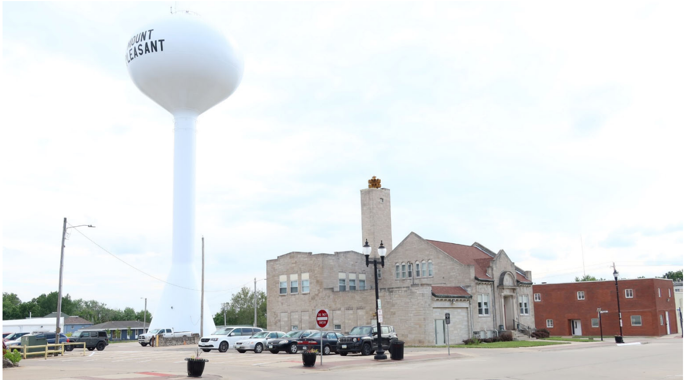
Photograph 44-02280-007. South side of 200-300 block of W. Monroe St (DT-27-28), looking southwest