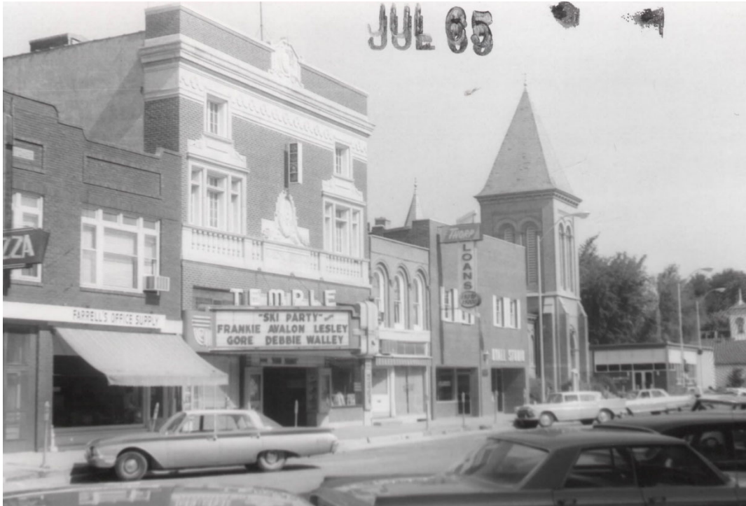
West side of 100 block of N. Main St in July 1965, looking northwest.