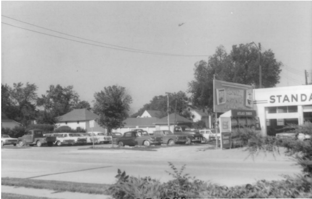
City parking lot on west side of 200 block of S. Main St in July 1965, looking southwest.