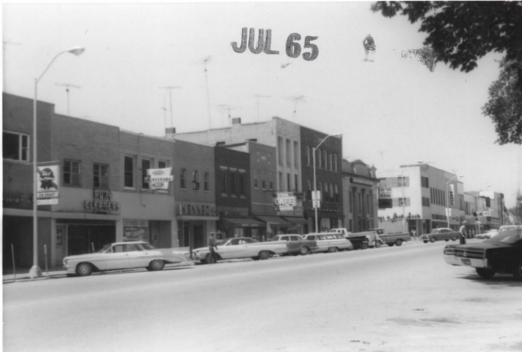
West side of square (100 block S. Jefferson) with new façades by July 1965.