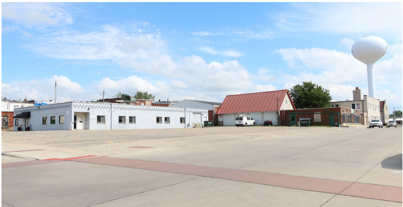
Photograph 44-02280-010. East side of 100 block N. Jackson St (DT-30-32), looking southeast