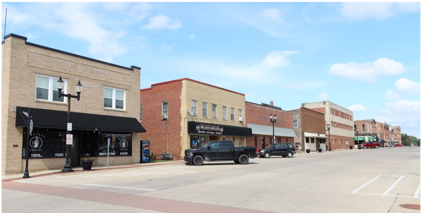
Photograph 44-02280-008. North side of 200 block of W. Monroe St (DT-32-36), looking northeast