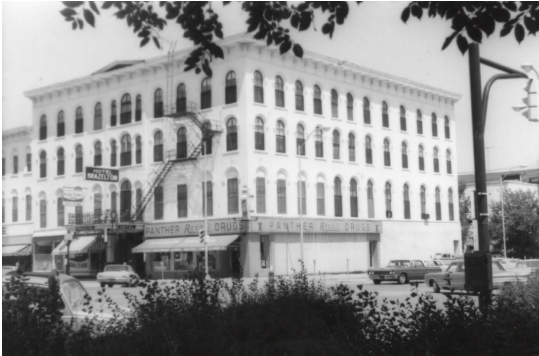
Brazelton Hotel at northeast corner of N. Main St and E. Monroe St in July 1965, looking northeast.