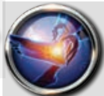
FOOT & ANKLE