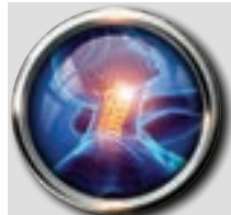
NECK & SPINE