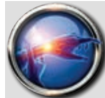
WRIST & HAND